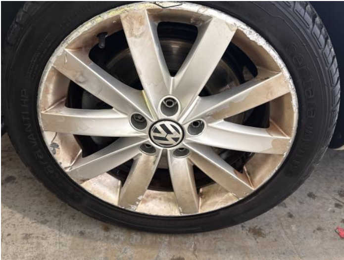
3: Wheel osf Scratched Over 50mm