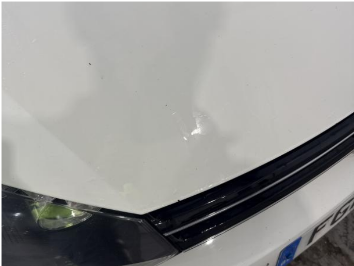
2: Bonnet Chipped 1 To 5