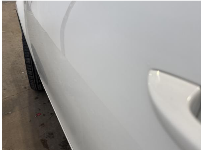
4: Door nsf Dented Between 10mm + 30mm