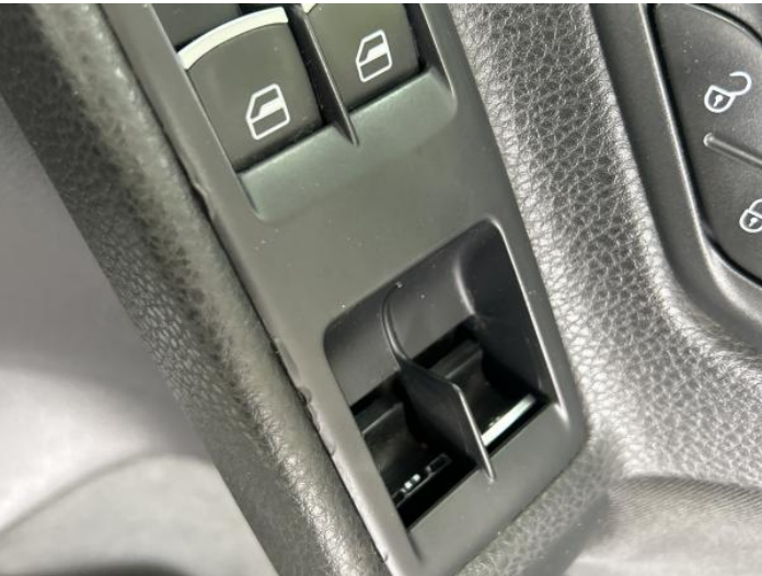
1: Other N/A N/A