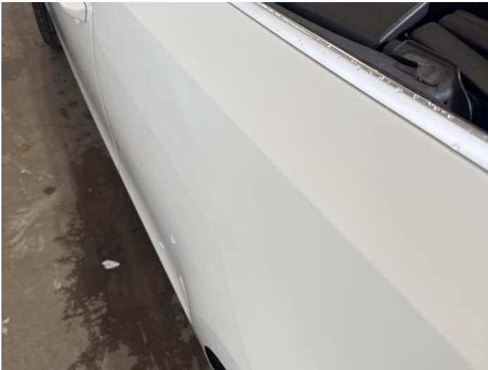
5: Qtr Panel nsr Dented Over 30mm