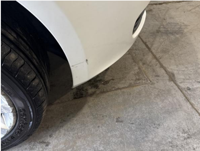
10: Bumper Front Scratched 25 to 100mm Thru Paint