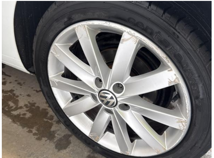
6: Wheel nsr Scratched Over 50mm