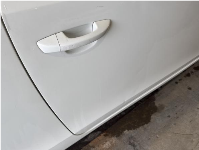
9: Door osf Dented With Paint Damage