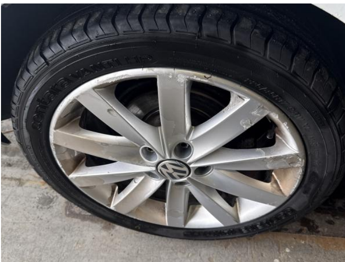
7: Wheel osr Scratched Over 50mm