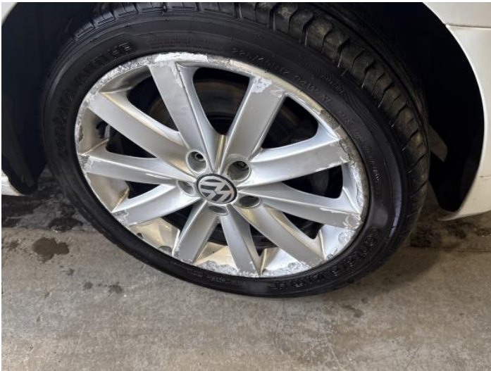
11: Wheel osf Scratched Over 50mm

Carpet Condition Average Seat Condition Average