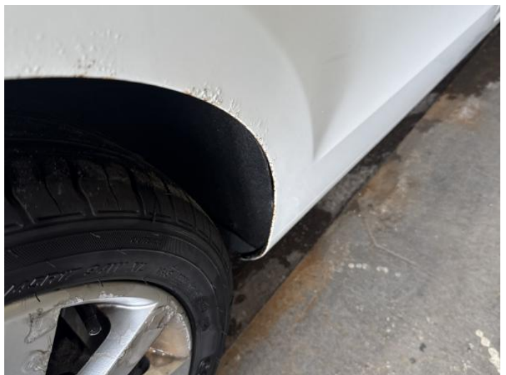
8: Qtr Panel osr Rusted Over 5mm