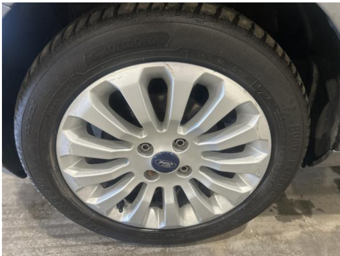
9: Wheel nsf Scratched Over 50mm