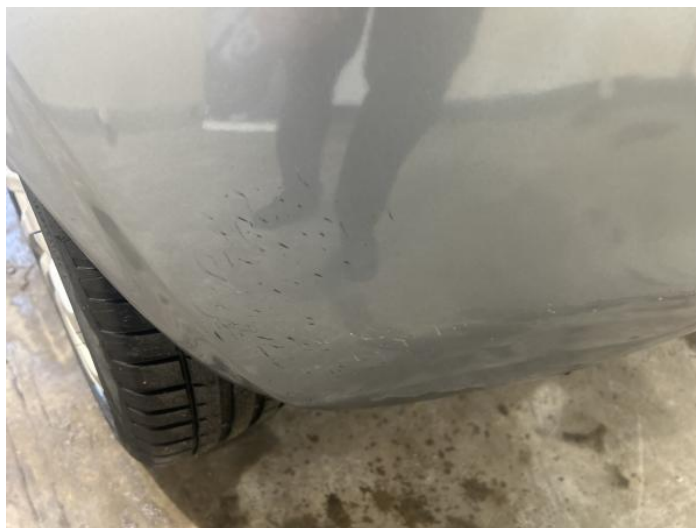
2: Bumper Rear Chipped Multiple Chips