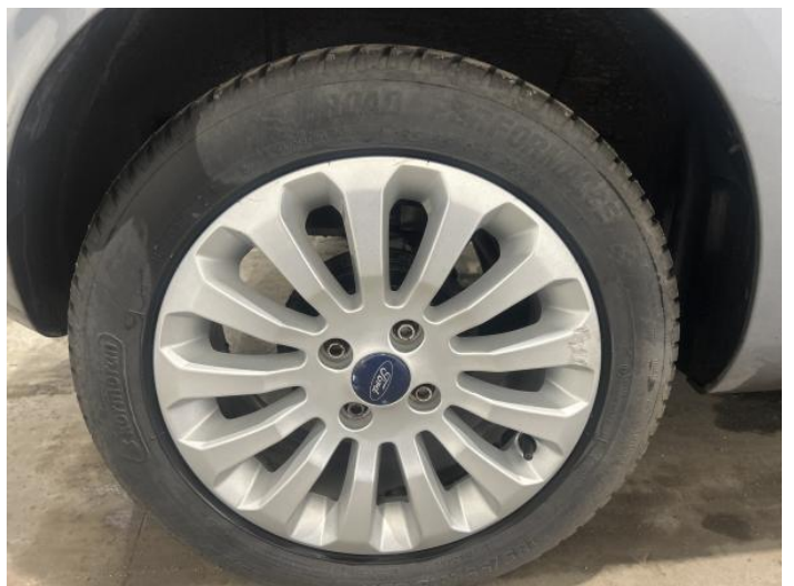
8: Wheel osr Scratched Over 50mm