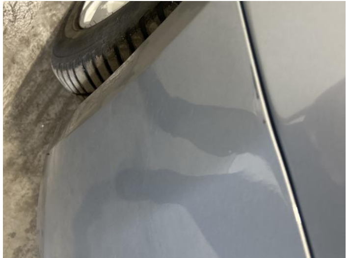
4: Bumper Front Scratched UpTo 25mm Thru Paint