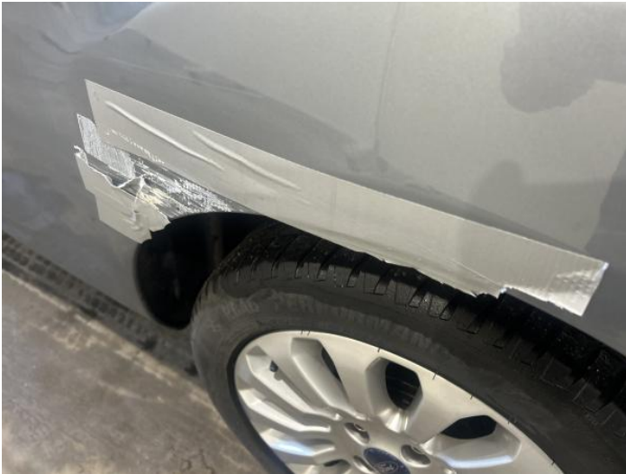
3: Qtr Panel nsr Dented With Paint Damage