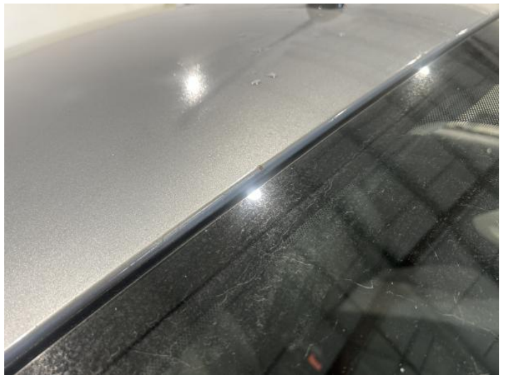
6: Roof Chipped 1 To 5