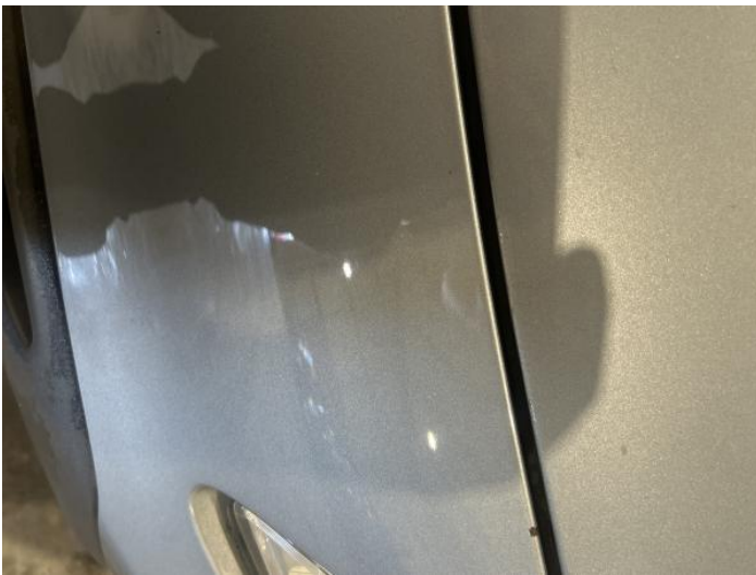
5: Bumper Front Chipped Multiple Chips