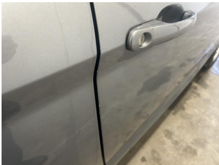
1: Door osf Chipped Edge Chip