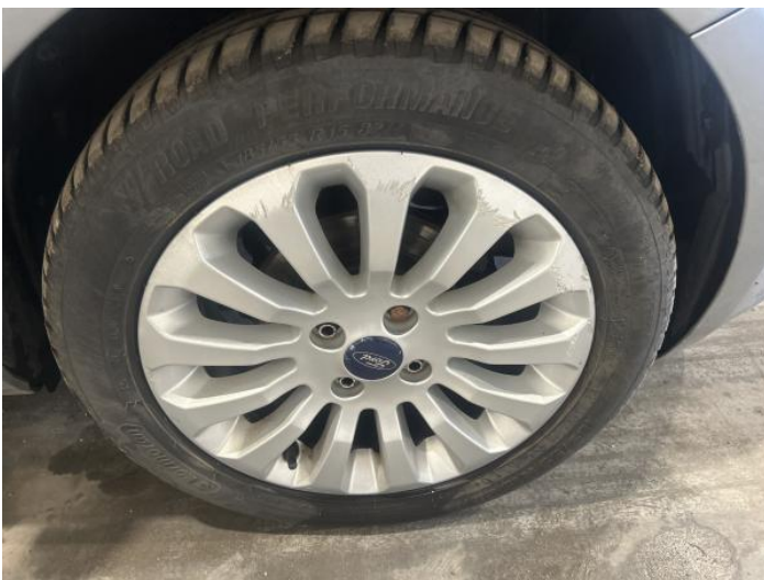
7: Wheel osf Scratched Over 50mm