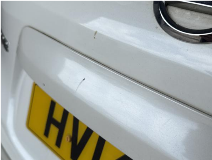
9: Tailgate Chipped 1 To 5