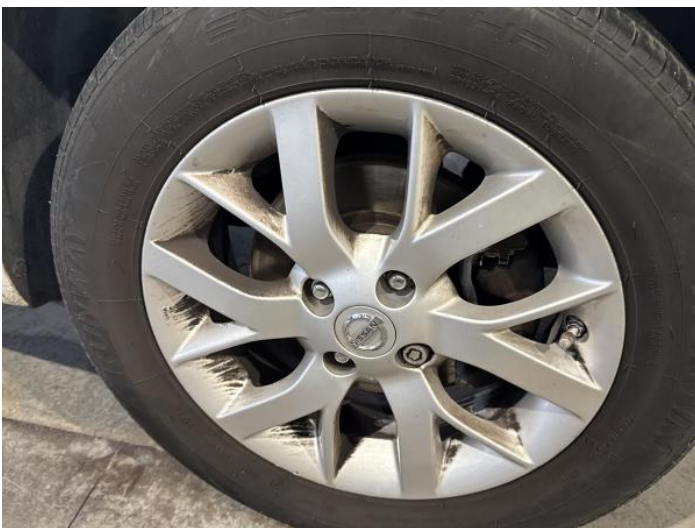
13: Wheel osf Scratched Up To 50mm