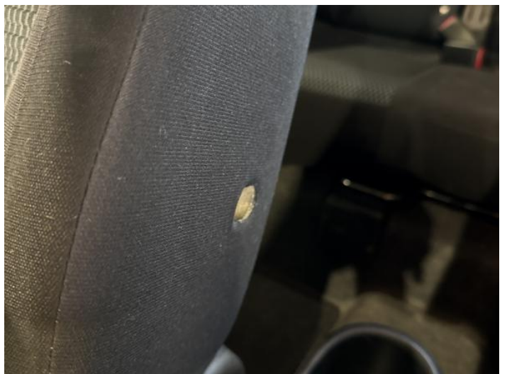
14: Fascia Panel Broken Replace