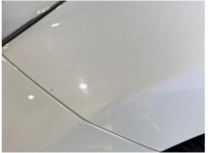
4: Wing nsf Chipped 1 To 5