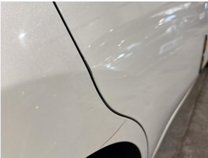
11: Door osr Chipped Edge Chip