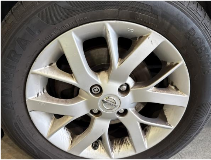
3: Wheel osf Scratched Over 50mm