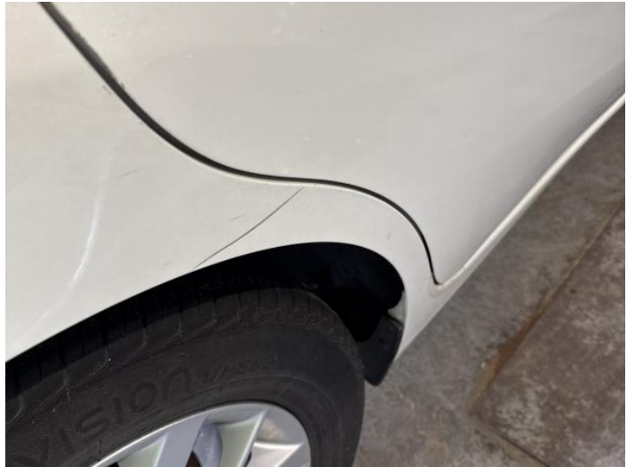
10: Qtr Panel osr Dented Between 10mm + 30mm