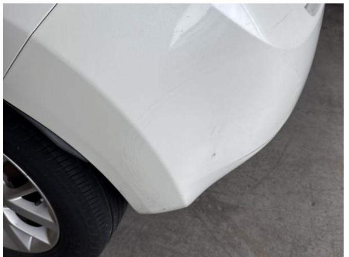
8: Bumper Rear Dented With Paint Damage