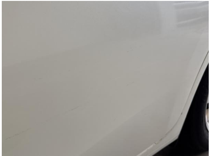
6: Door nsr Scratched Over 25mm Thru Paint