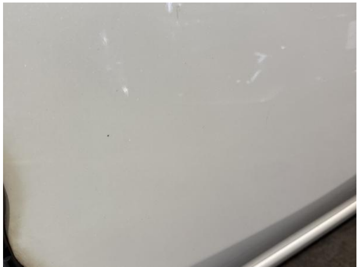
12: Door osf Chipped 1 To 5