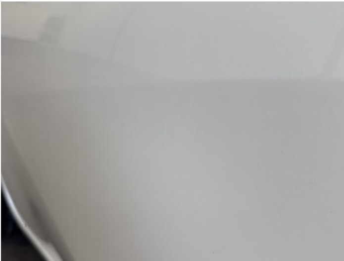
5: Door nsf Dented 2 Or Less UpTo 10mm