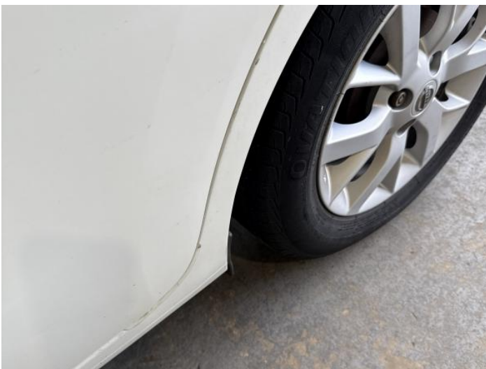
7: Qtr Panel nsr Chipped Edge Chip