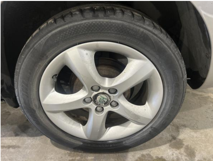
11: Wheel nsr Scratched Over 50mm