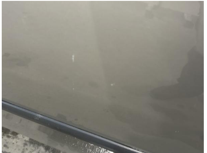
6: Door nsf Chipped 1 To 5