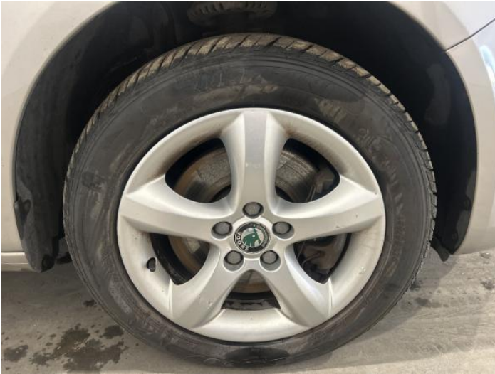
9: Wheel osf Scratched Over 50mm