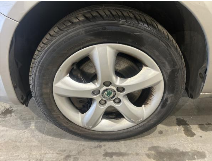
12: Wheel nsf Scratched Over 50mm