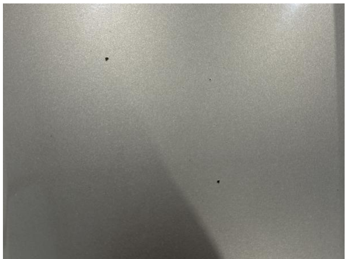
8: Bonnet Chipped 1 To 5