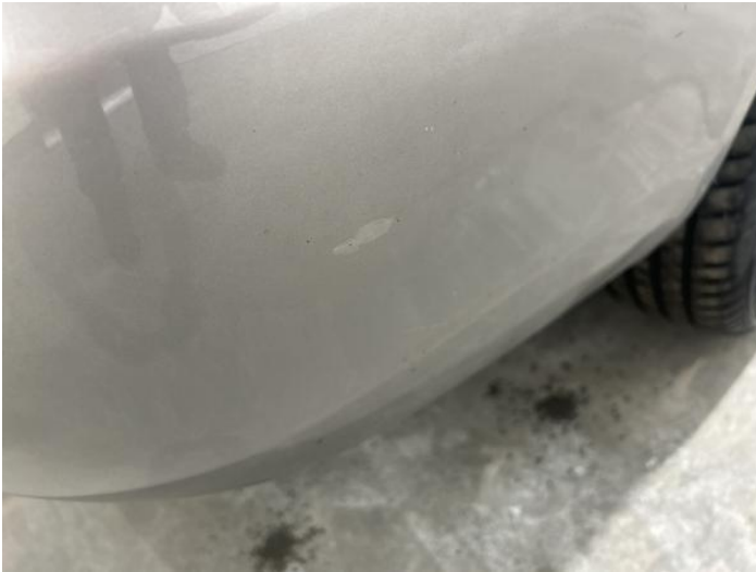
3: Bumper Rear Scratched Up To 25mm Thru Paint