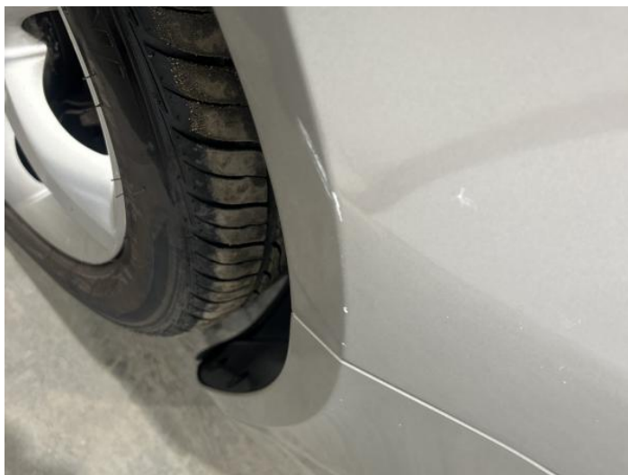
1: Wing osf Scratched Over 25mm Thru Paint