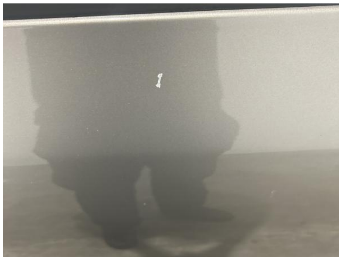
2: Door osf Chipped 1 To 5