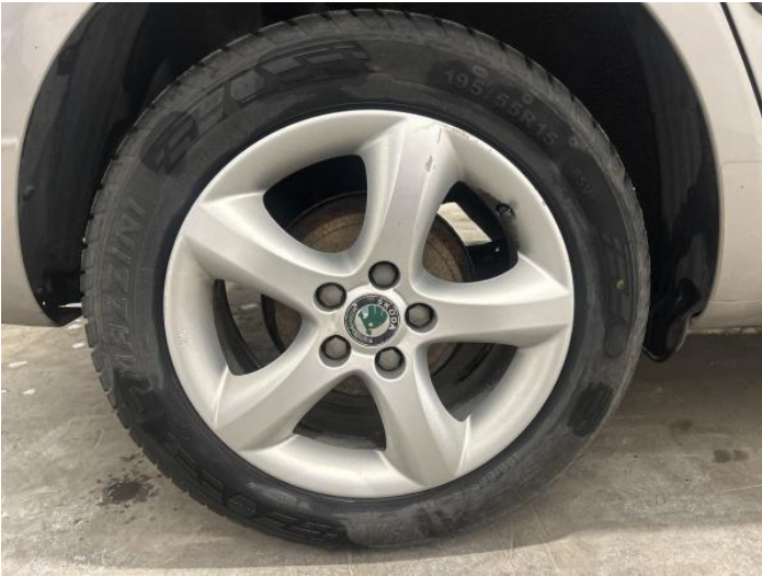
10: Wheel osr Scratched Up To 50mm