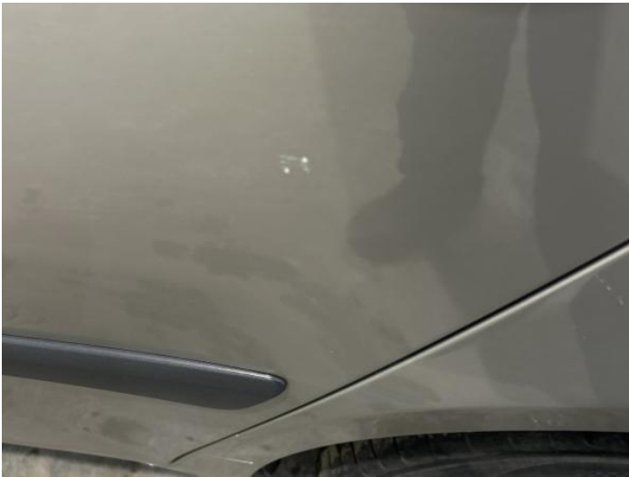
5: Door nsr Chipped 1 To 5