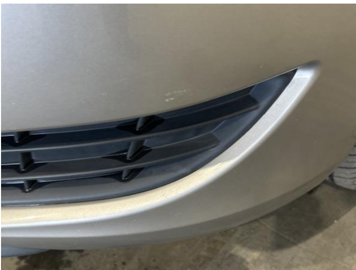
7: Bumper Front Chipped 1 To 5