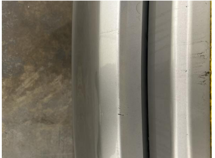
4: Bumper Rear Chipped 1 To 5