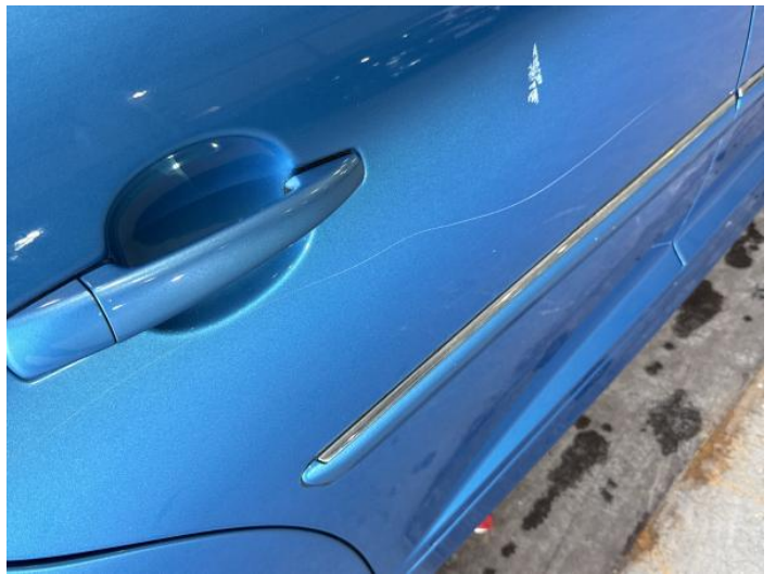
12: Door osr Dented With Paint Damage