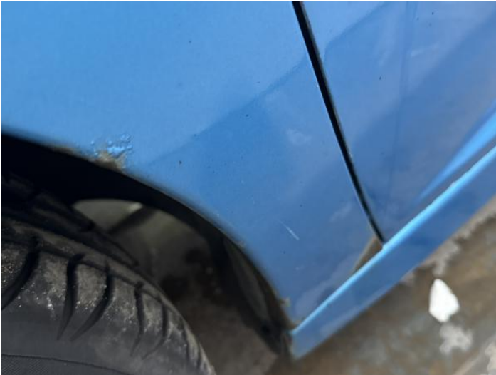
3: Wing nsf Rusted Over 5mm