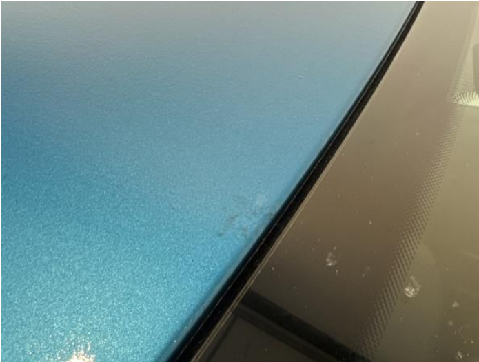
15: Roof Rusted Over 5mm