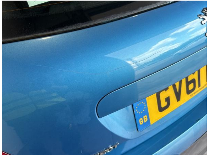
10: Tailgate Scratched Over 25mm Thru Paint