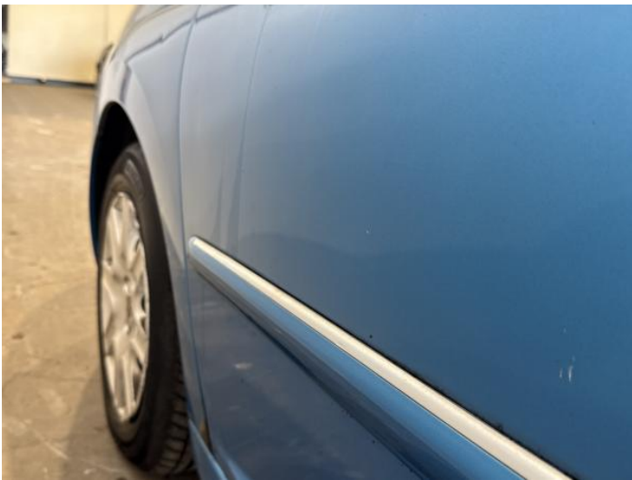
5: Door nsf Dented Over 30mm