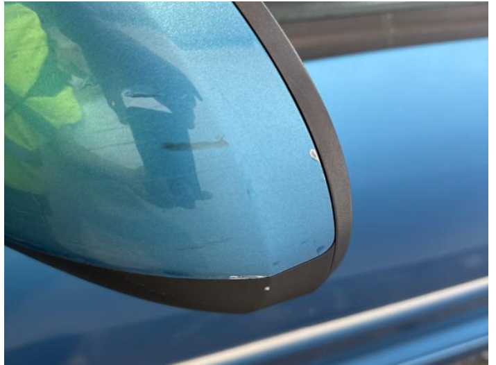
4: Door Mirror Assy nsf Scratched (Painted) Over 25mm Thru Paint