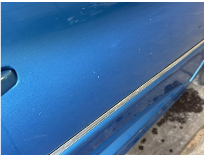
13: Door osf Chipped Multiple Chips