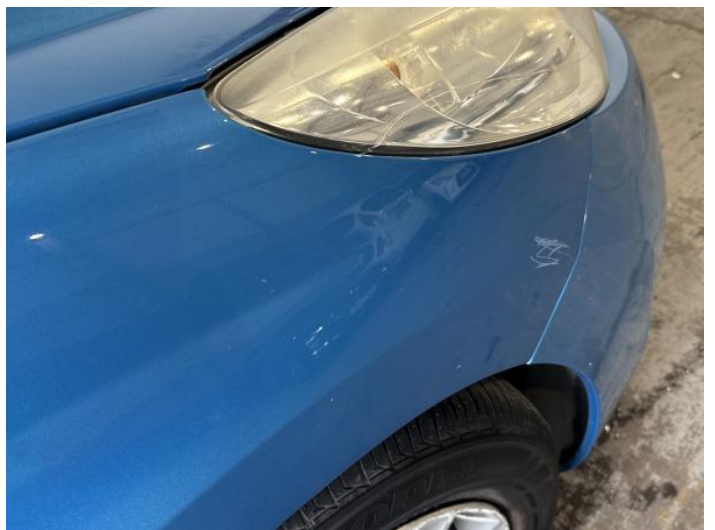
14: Wing osf Dented With Paint Damage