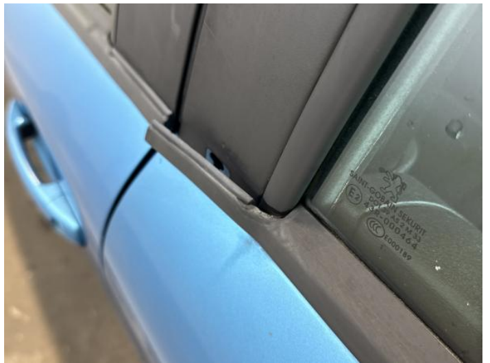
6: Aperture Seal nsr Broken Replace