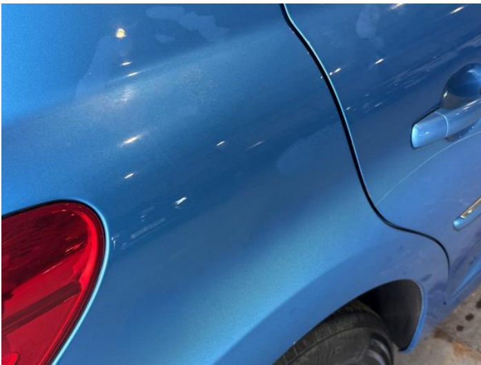
11: Qtr Panel osr Scratched Over 25mm Thru Paint