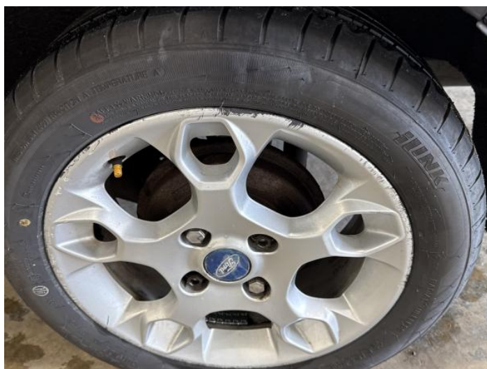
8: Wheel nsr Scratched Over 50mm