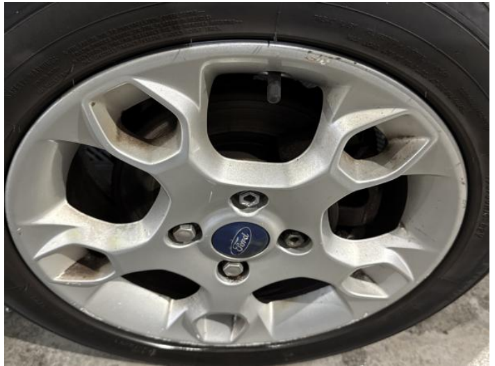
18: Wheel osf Scratched Over 50mm