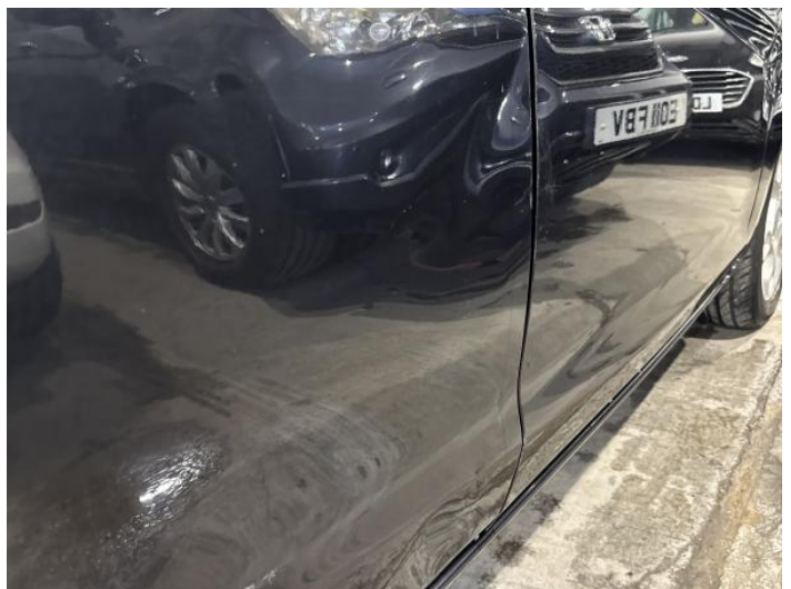
14: Door osr Dented Over 30mm