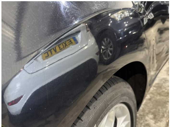
12: Qtr Panel osr Dented Between 10mm + 30mm