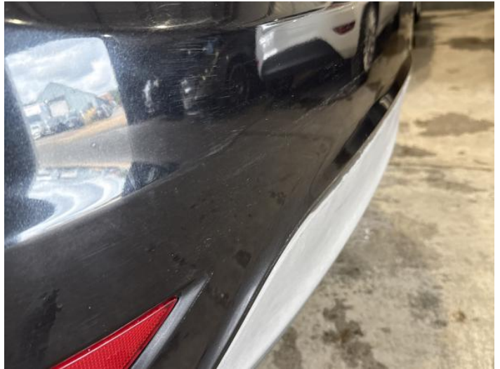
10: Bumper Rear Scratched Over 100mm Thru Paint