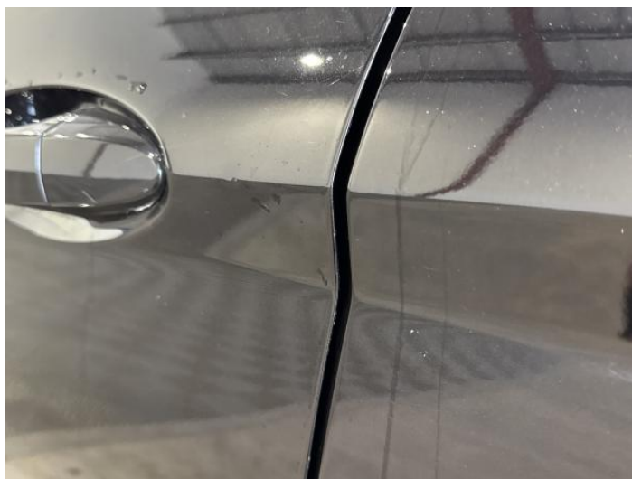
6: Door nsf Dented Between 10mm + 30mm