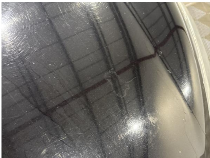
1: Bonnet Scratched Over 25mm Thru Paint