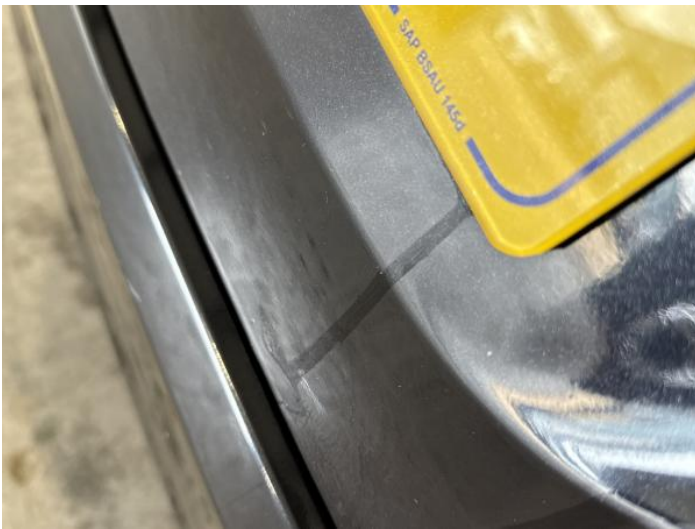
11: Tailgate Chipped 1 To 5