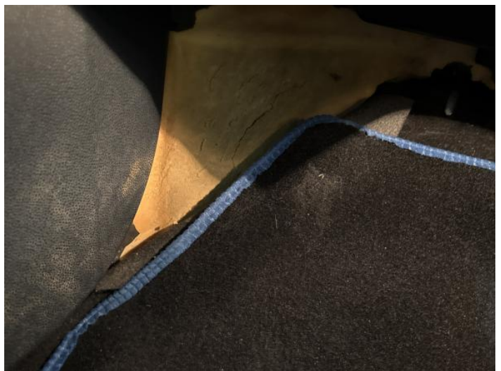
20: Carpets Front Scuffed Over 25mm