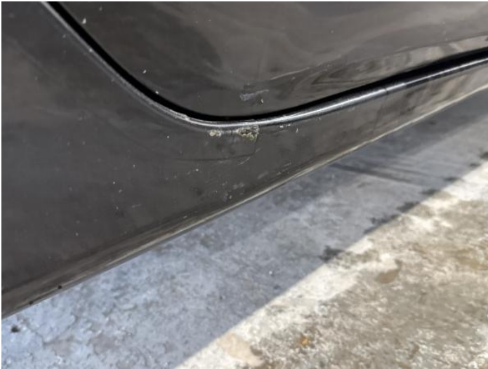
15: Sill os Scratched Over 25mm Thru Paint