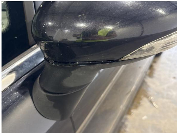
4: Door Mirror Assy nsf Scuffed (Unpainted) Over 100mm