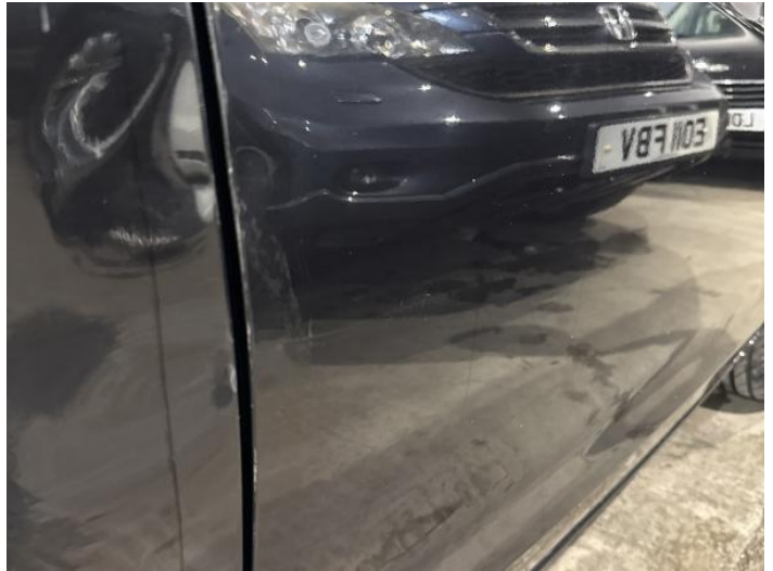
16: Door osf Dented Over 30mm