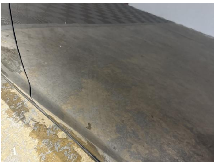
7: Door nsr Chipped 1 To 5