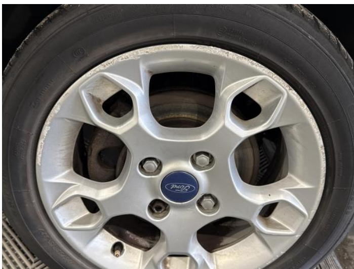
5: Wheel nsf Scratched Over 50mm