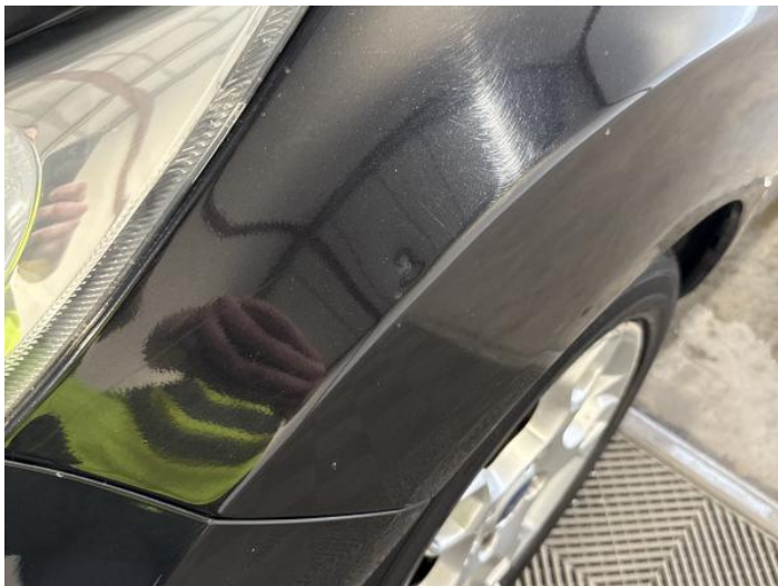
3: Wing nsf Dented With Paint Damage