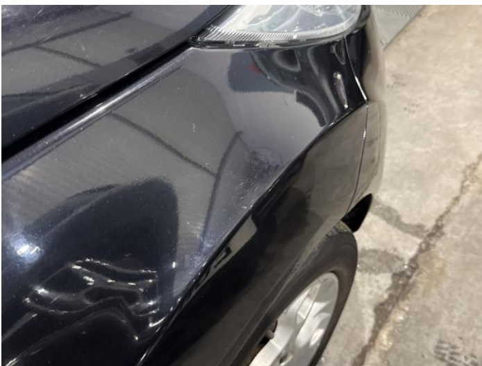
19: Wing nsf Chipped 1 To 5