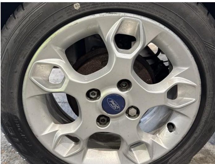
13: Wheel osr Scratched Up To 50mm