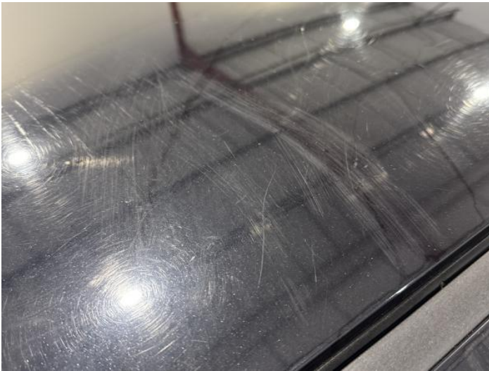
17: Roof Scratched Over 25mm Thru Paint