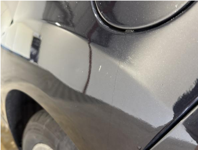
9: Qtr Panel nsr Dented Between 10mm + 30mm