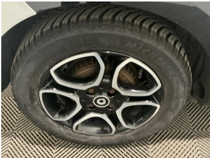
15: Wheel osr Scratched Over 50mm