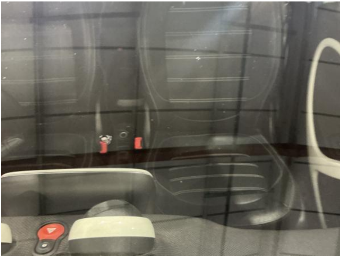
23: Screen Front Chipped Over 10mm