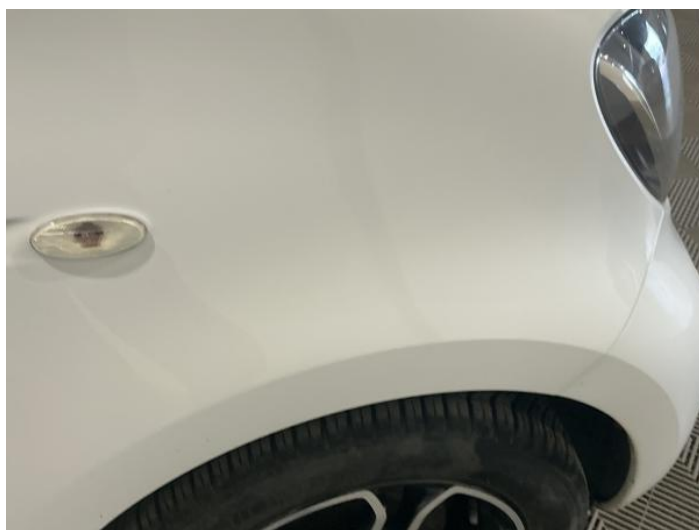
20: Wing osf Chipped 1 To 5