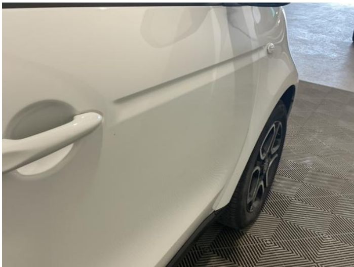
17: Door osf Dented 2 Or Less UpTo 10mm