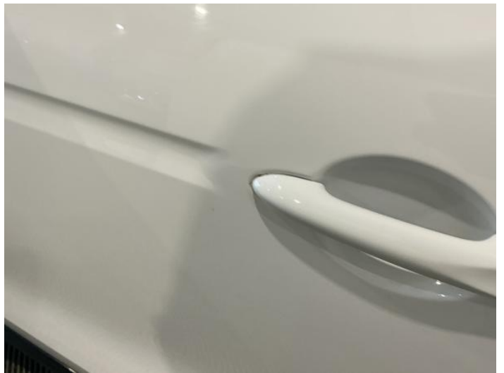
6: Door nsf Dented Over 2 UpTo 10mm