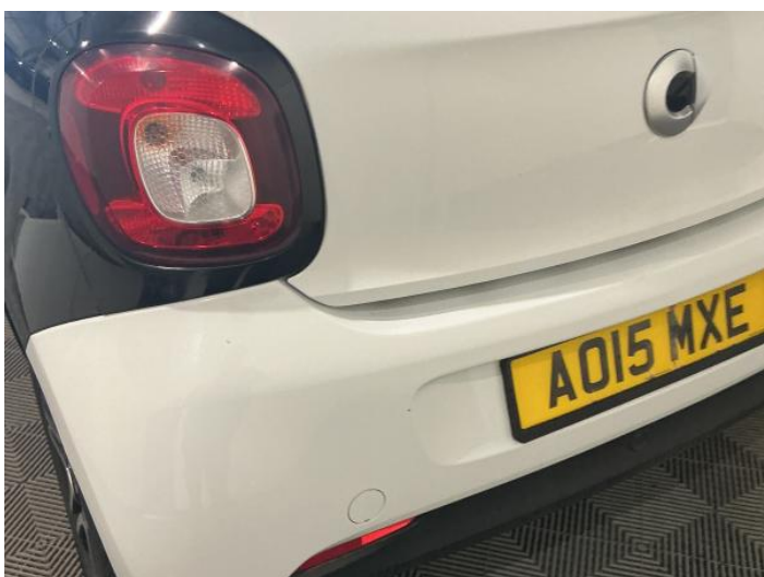
11: Bumper Rear Scratched 25 to 100mm Thru Paint