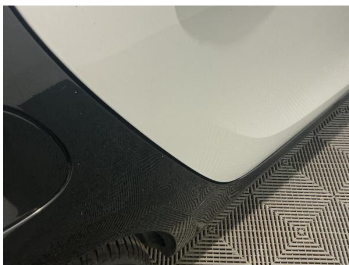
14: Qtr Panel osr Dented Over 30mm