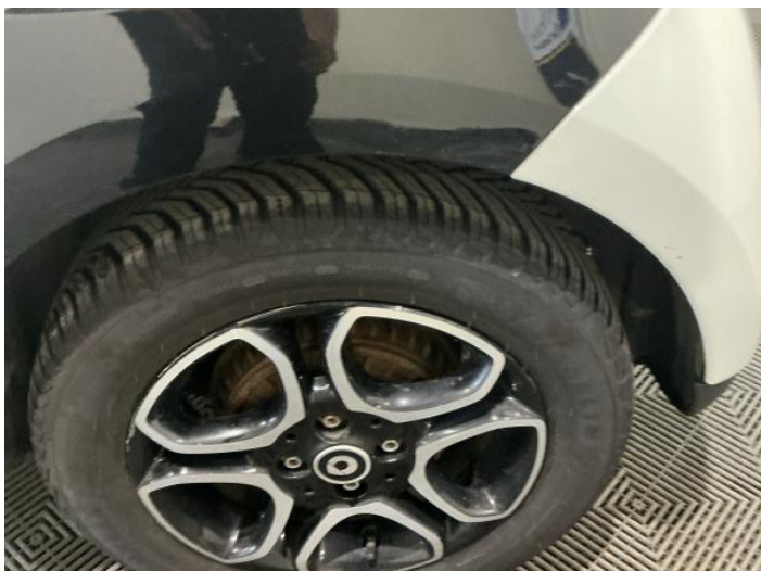
9: Wheel nsr Scratched Over 50mm