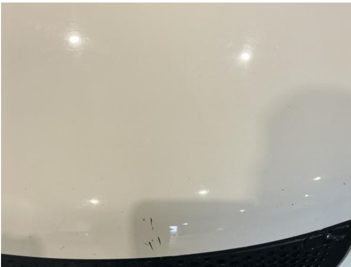
1: Bonnet Scratched Over 25mm Thru Paint