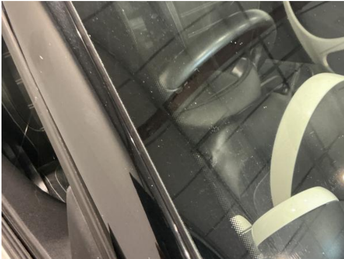
22: A Post os Chipped Multiple Chips