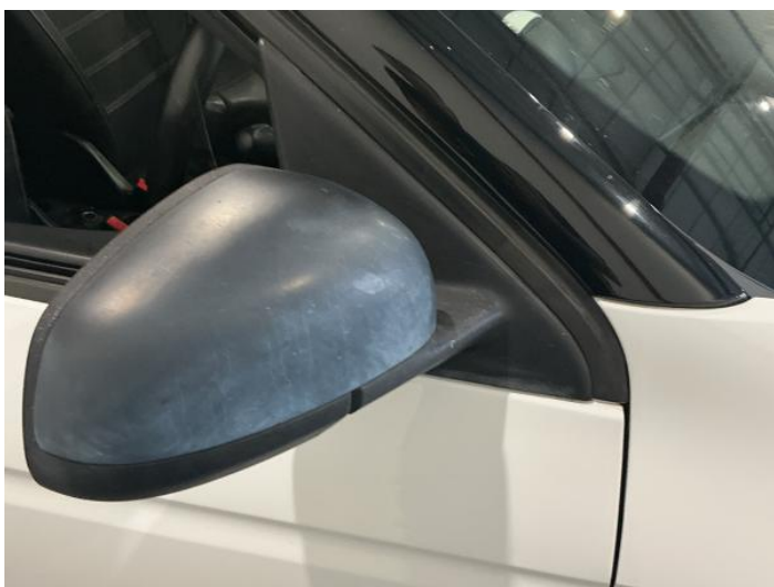
19: Door Mirror Assy osf Scratched (Painted) Over 25mm Thru Paint