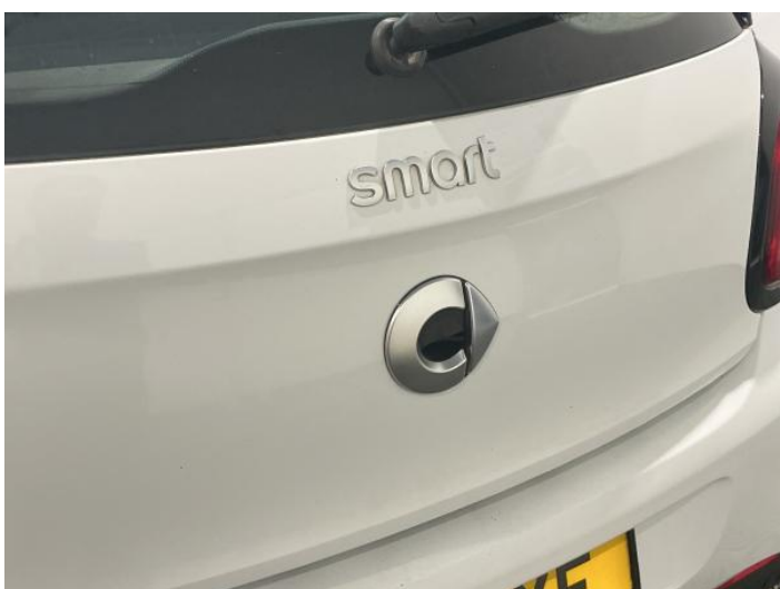
13: Boot Lid Chipped 1 To 5