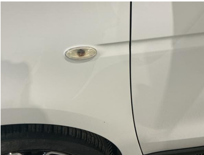
5: Wing nsf Chipped 1 To 5