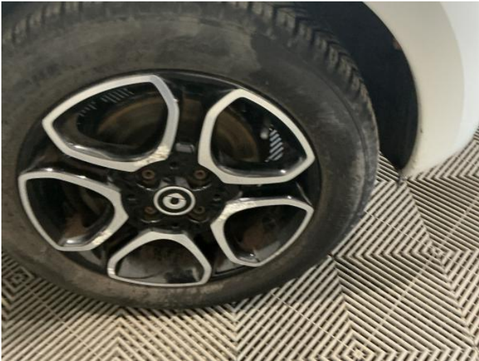
21: Wheel osf Scratched Over 50mm