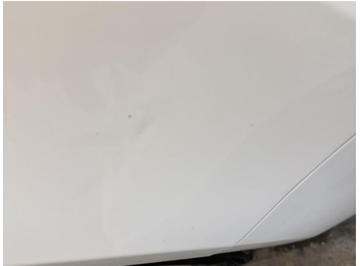
4: Wing osf Chipped 1 To 5