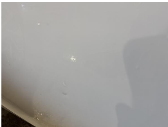
12: Door nsf Dented Between 10mm + 30mm