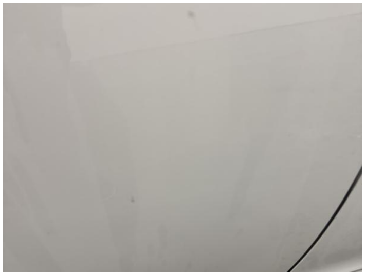
6: Door osr Chipped 1 To 5