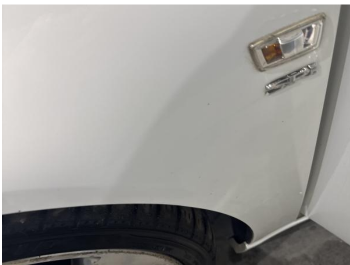
13: Wing nsf Chipped 1 To 5