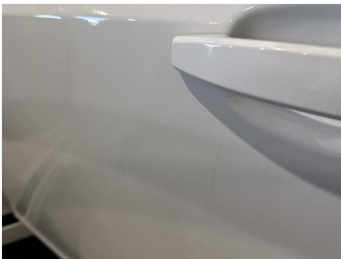
11: Door nsr Scratched Over 25mm Not Thru Paint