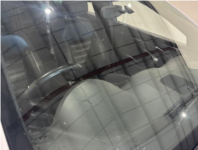
3: Screen Front Chipped UpTo 10mm