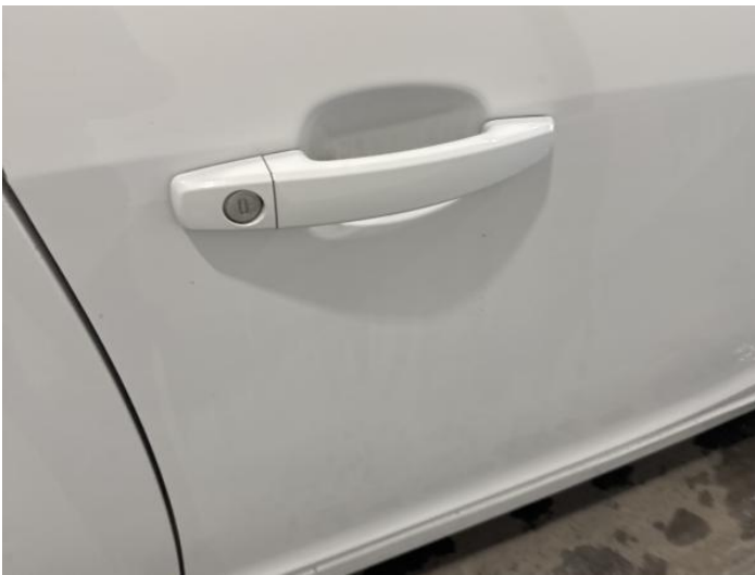
5: Door osf Chipped 1 To 5