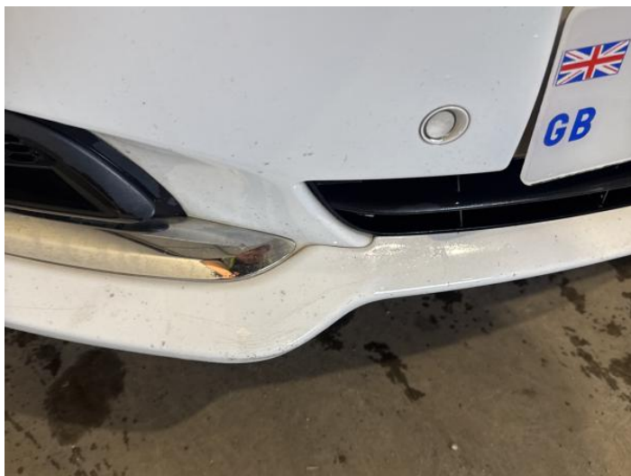
1: Bumper Front Poor Previous Repair Rippled Over 30%