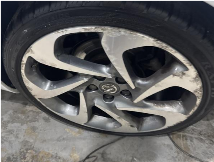
15: Wheel nsr Scratched Over 50mm