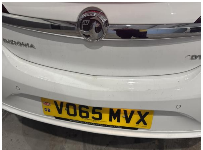
8: Bumper Rear Scratched 25 to 100mm Thru Paint