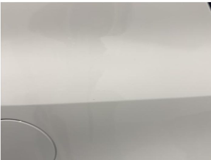
7: Qtr Panel osr Scratched Over 25mm Not Thru Paint