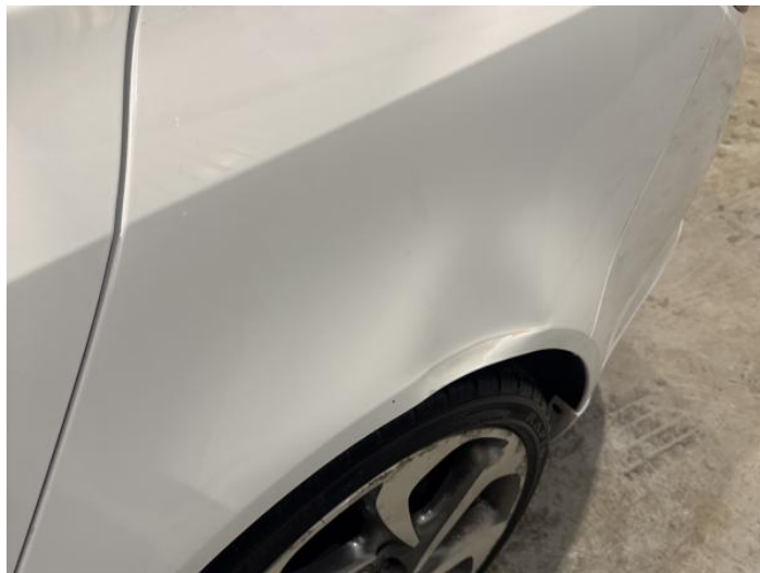
10: Qtr Panel nsr Dented Over 30mm