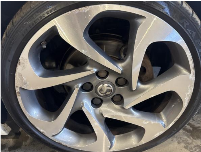
17: Wheel osf Scratched Over 50mm