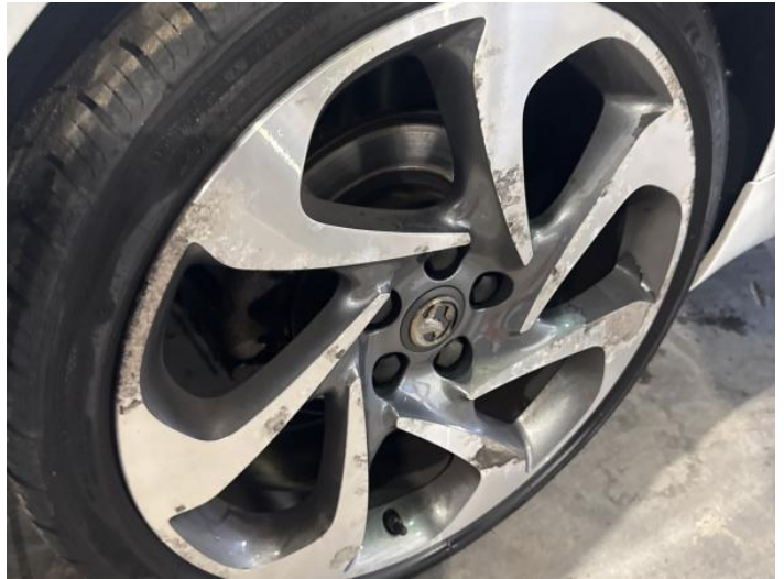
16: Wheel osr Scratched Over 50mm