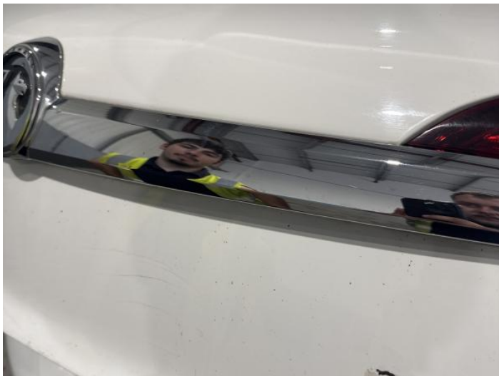
9: Boot Lid Scratched Over 25mm Not Thru Paint