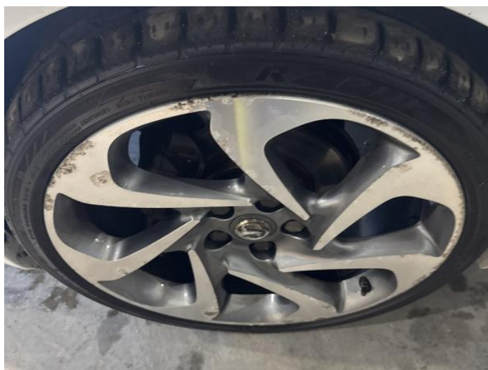
14: Wheel nsf Scratched Over 50mm