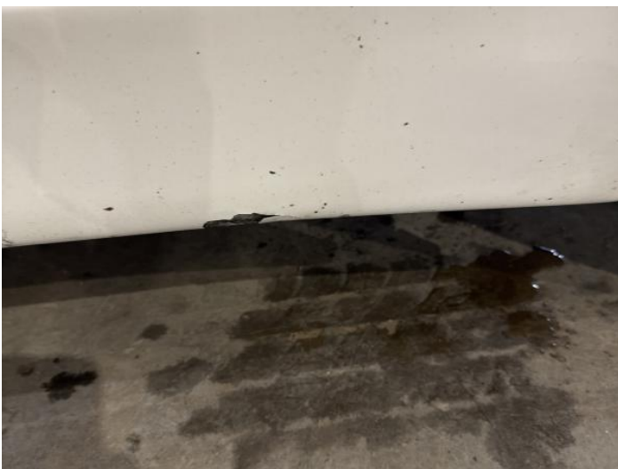
19: Sill os Scratched Over 25mm Thru Paint