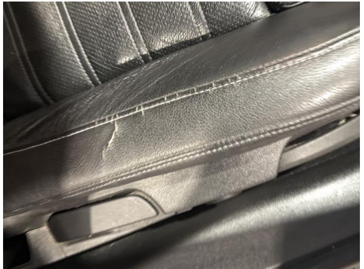
18: Seat Base Cover osf Torn Over 3mm