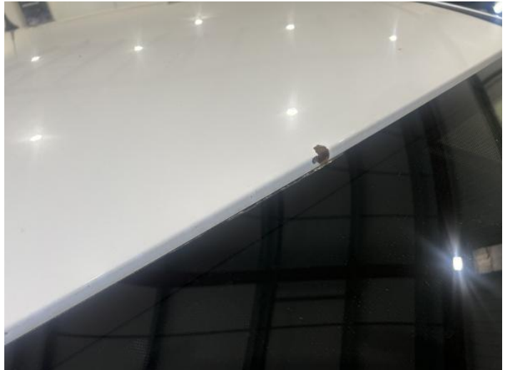
12: Roof Chipped Over 5mm