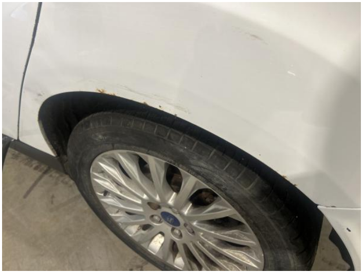
5: Qtr Panel nsr Dented With Paint Damage