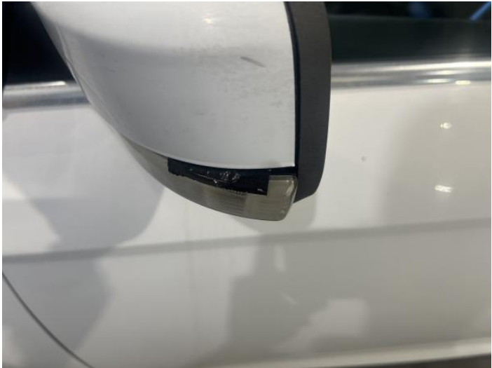
8: Door Mirror Assy nsf Broken Replace