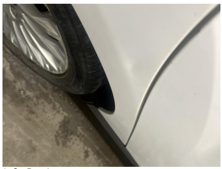
2: Qtr Panel osr Dented Between 10mm + 30mm