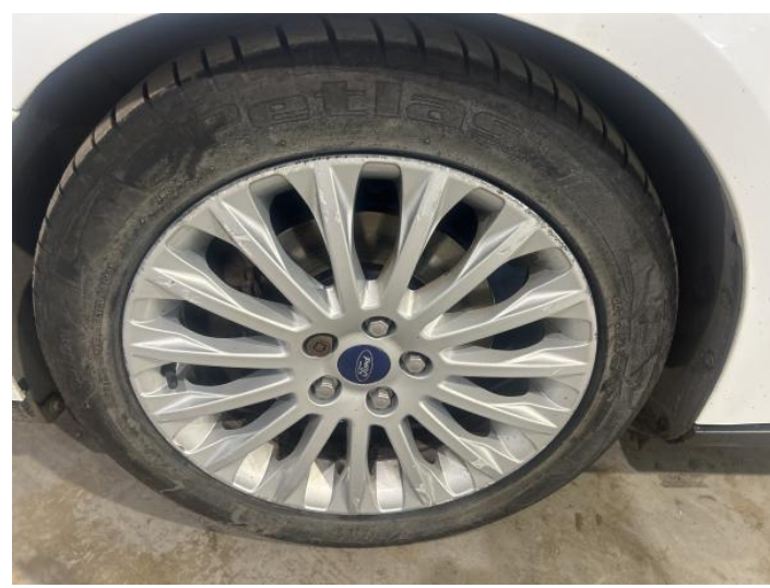
16: Wheel nsf Scratched Over 50mm