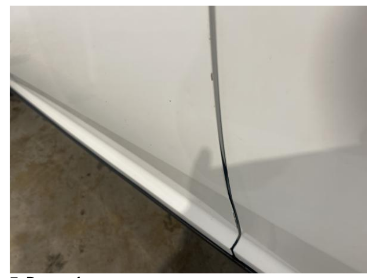
7: Door nsf Dented Between 10mm + 30mm