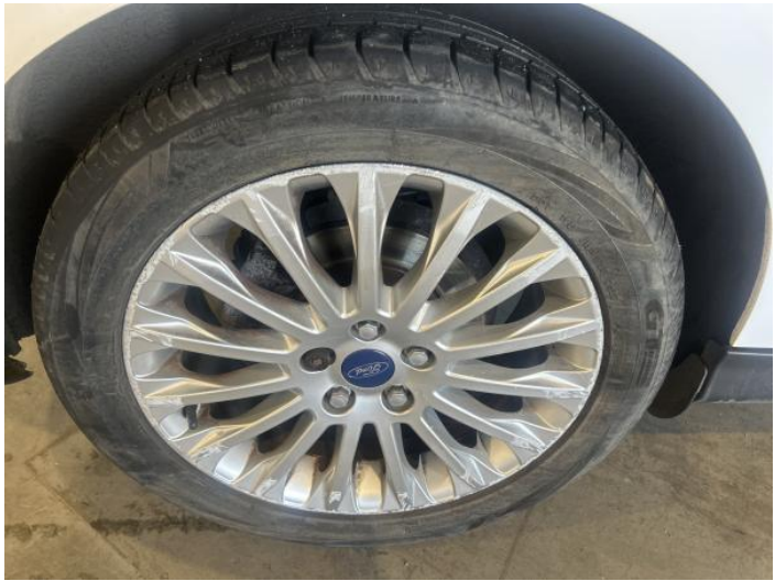
14: Wheel osr Scratched Over 50mm