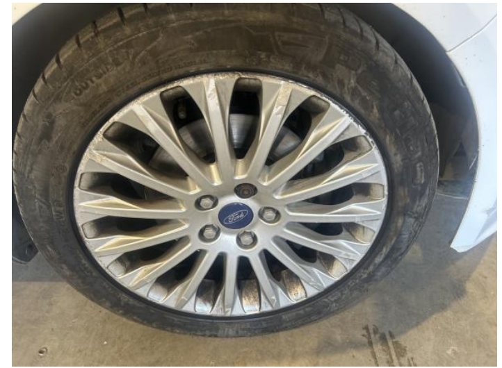
13: Wheel osf Scratched Over 50mm