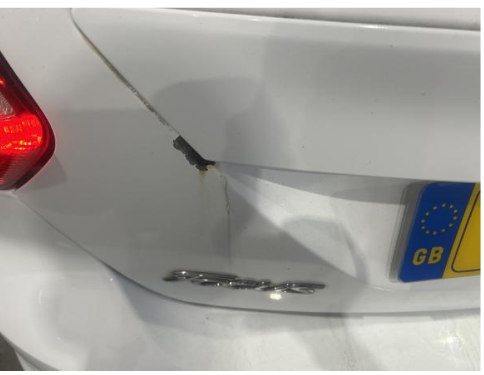
4: Tailgate Chipped Over 5mm