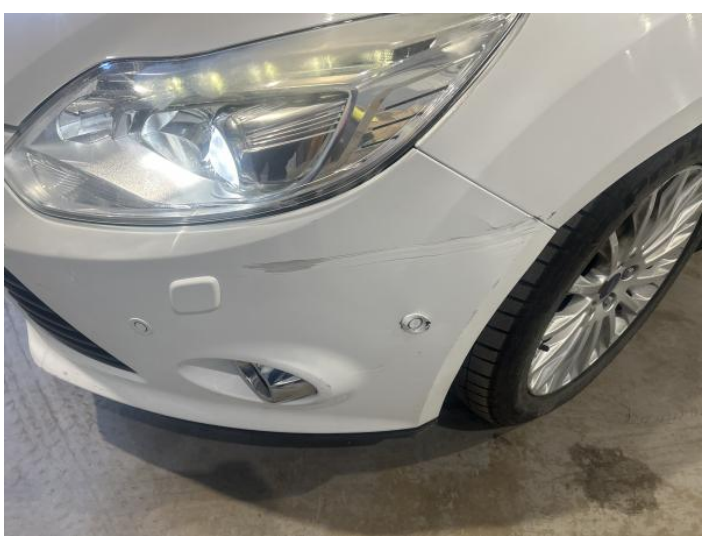
10: Bumper Front Scratched Over 100mm Thru Paint