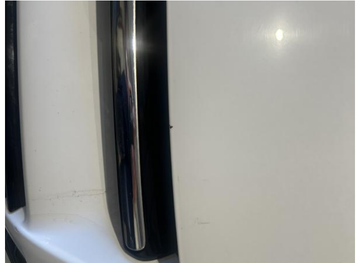
11: Bonnet Chipped 1 To 5