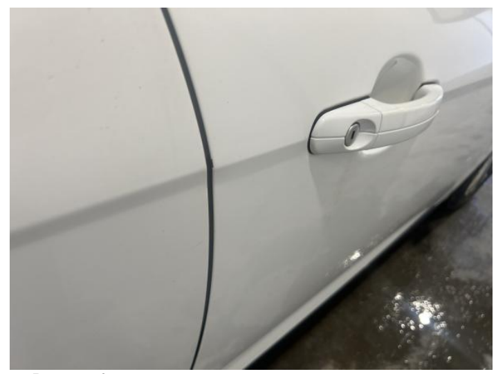
1: Door osf Chipped Edge Chip