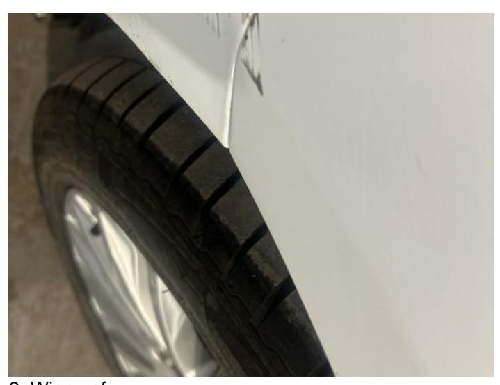
9: Wing nsf Scratched UpTo 25mm Thru Paint