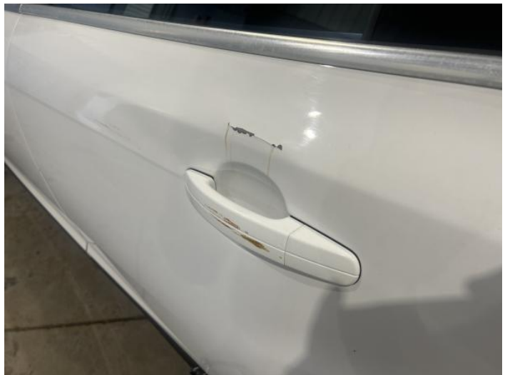
6: Door nsr Dented With Paint Damage