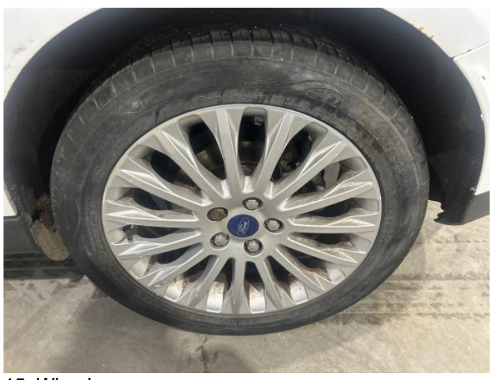
15: Wheel nsr Scratched Over 50mm