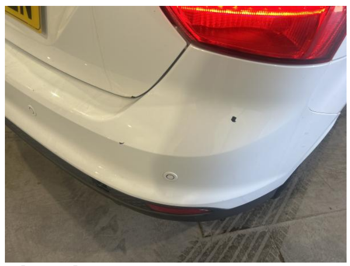
3: Bumper Rear Scratched Over 100mm Thru Paint