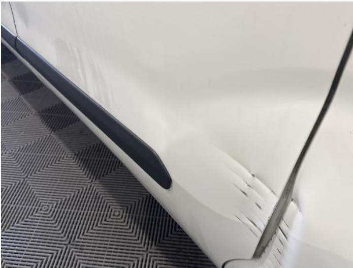
5: Door nsr Dented With Paint Damage