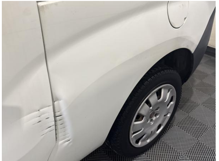
6: Qtr Panel nsr Dented Over 30mm