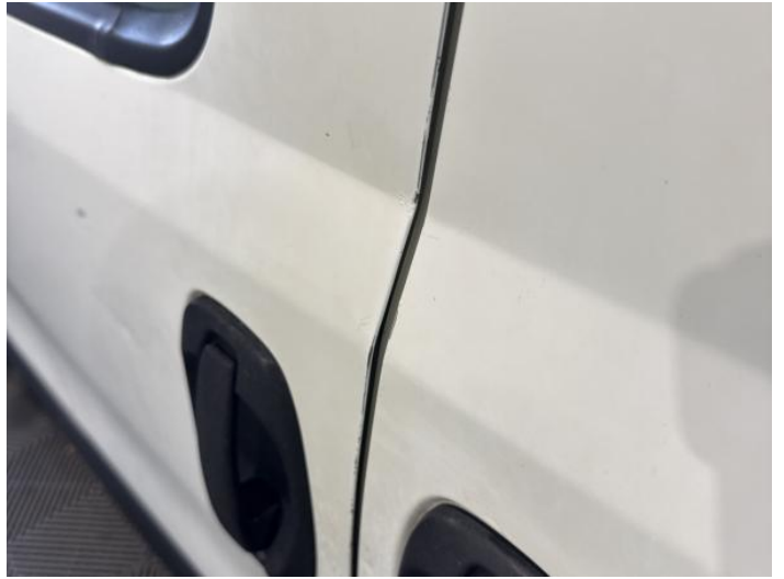
4: Door nsf Chipped Edge Chip