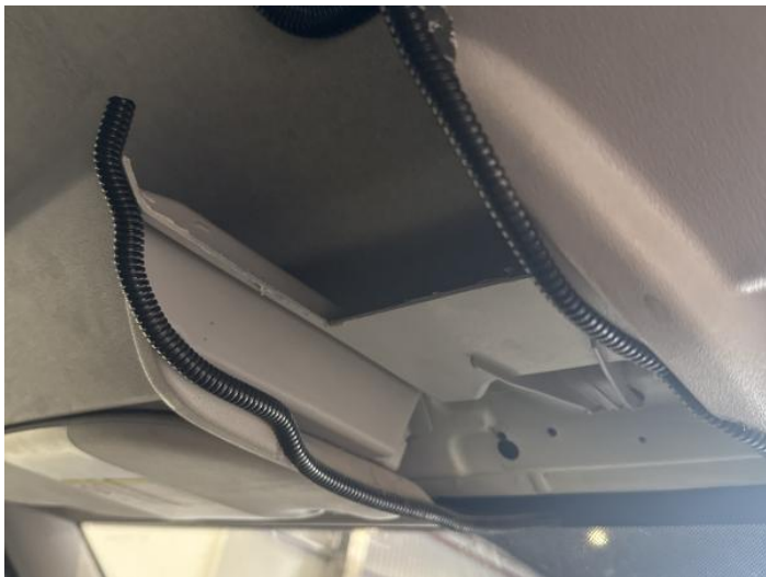
15: Fascia Panel Broken Replace