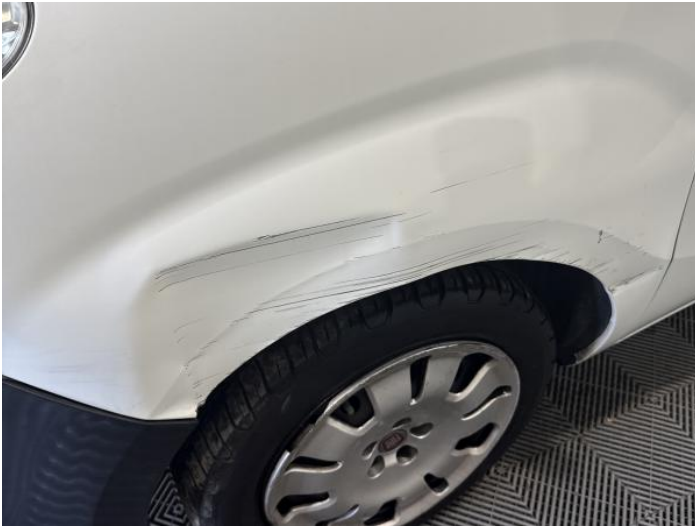
3: Wing nsf Dented Over 30mm