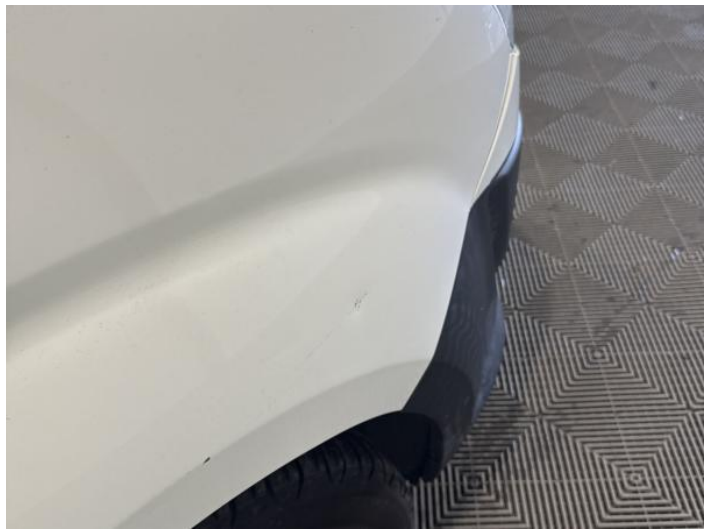
12: Wing osf Dented With Paint Damage