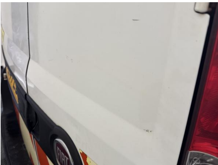
7: Tailgate Scratched Over 25mm Thru Paint