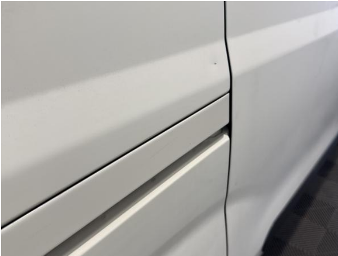
9: Qtr Panel osr Dented With Paint Damage