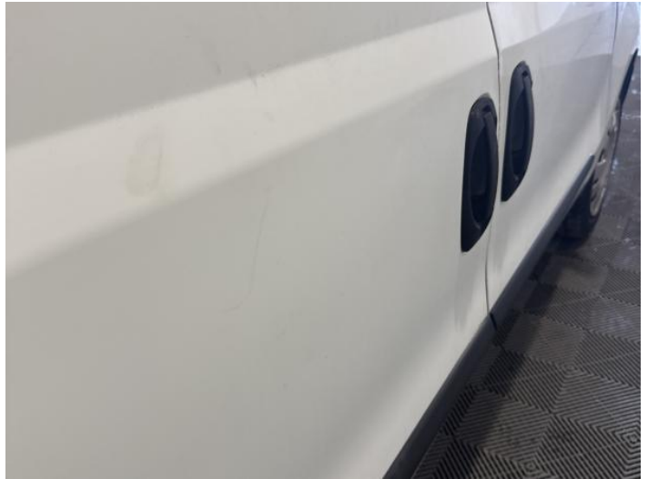
10: Door osr Dented Over 30mm