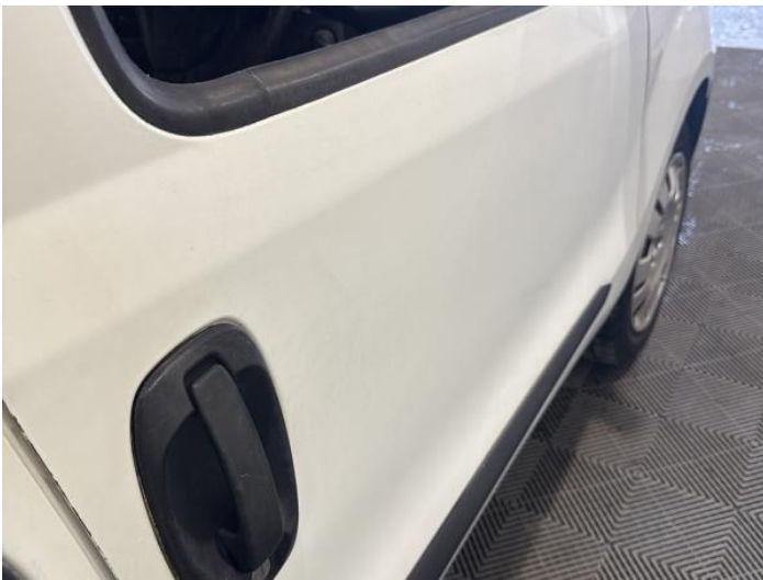
11: Door osf Dented Over 30mm