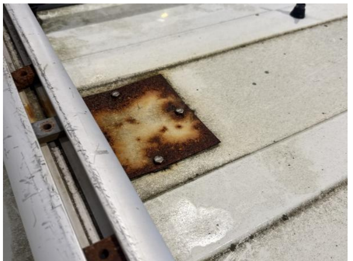
8: Roof Dented Over 30mm