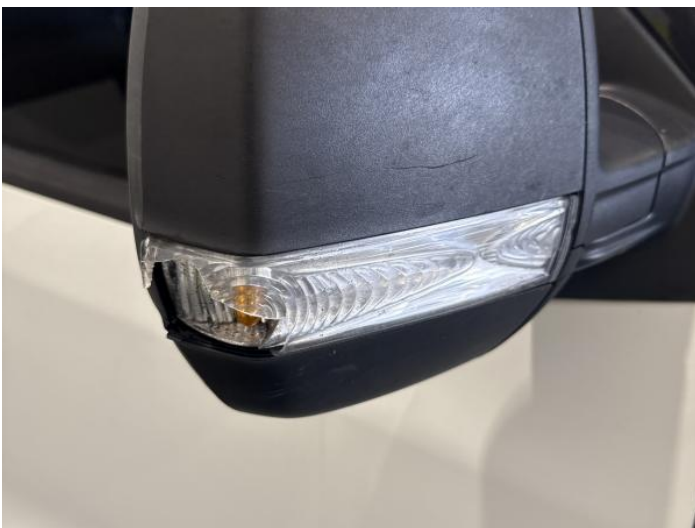
13: Flasher Side Repeater os Broken Replace