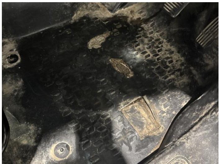
14: Carpets Front Holed Over 3mm