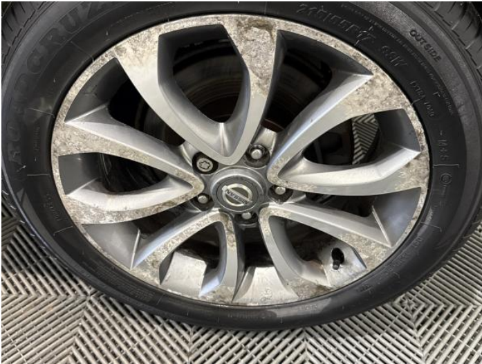
9: Wheel nsr Scratched Over 50mm