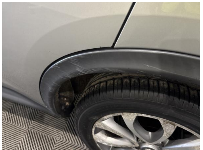
8: Qtr Panel Arch Extension ns Scuffed (Unpainted) Over 100mm