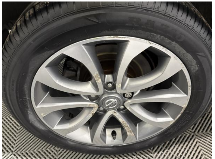
12: Wheel osr Scratched Over 50mm