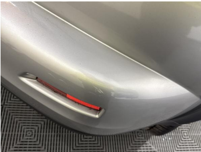
11: Bumper Rear Scratched 25 to 100mm Thru Paint