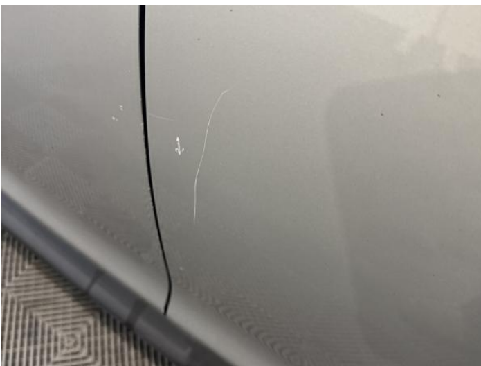
7: Door osr Scratched Over 25mm Thru Paint