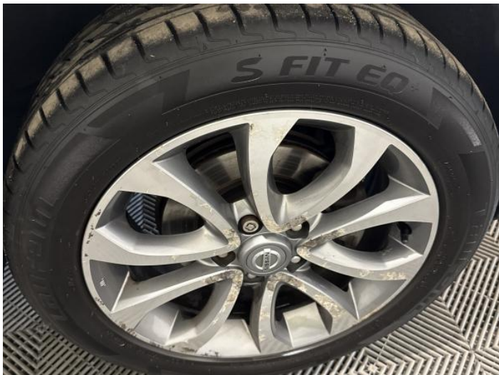
15: Wheel osf Scratched Over 50mm