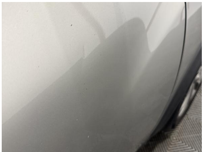
14: Door osf Dented With Paint Damage