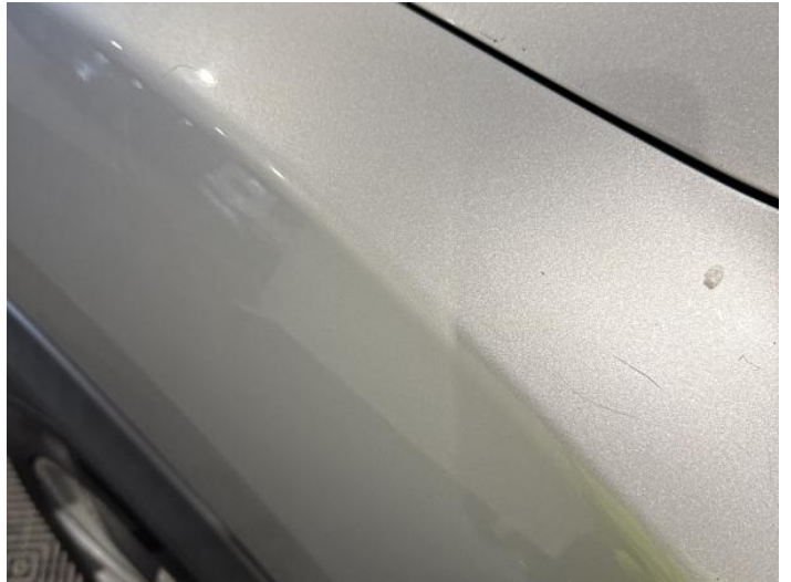
4: Wing nsf Scratched Over 25mm Thru Paint