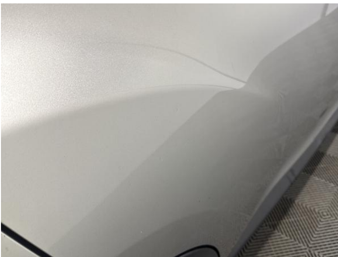
13: Door osr Dented 2 Or Less UpTo 10mm