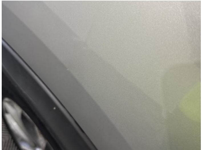
10: Qtr Panel nsr Dented Between 10mm + 30mm