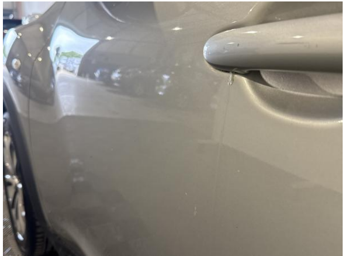
6: Door nsf Dented Over 30mm