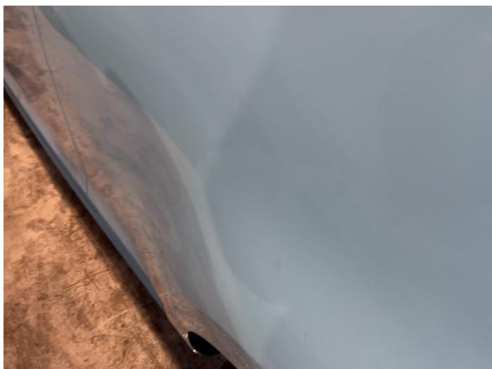
11: Qtr Panel nsr Dented Over 2 UpTo 10mm