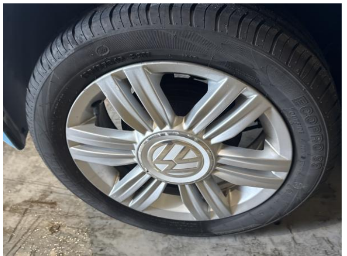
8: Wheel osr Scratched Over 50mm