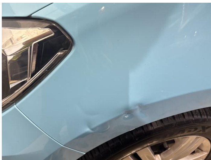
14: Wing nsf Dented With Paint Damage