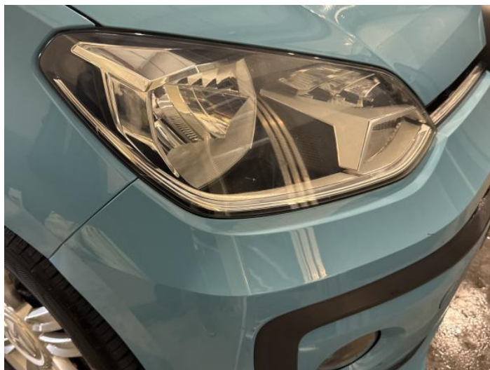
2: Bumper Front Chipped Multiple Chips