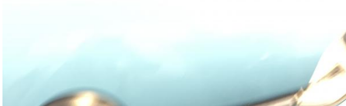
1: Bonnet Chipped 1 To 5