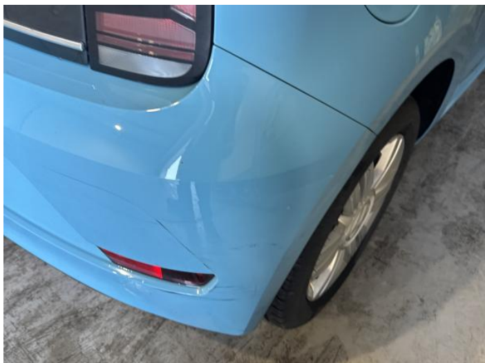
9: Bumper Rear Scratched 25 to 100mm Thru Paint