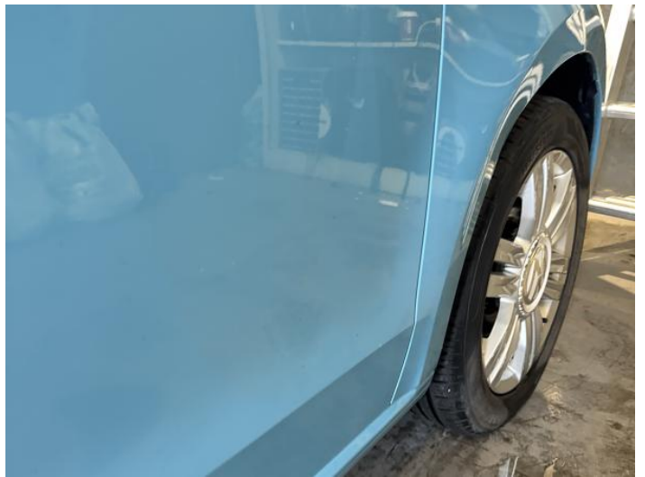
6: Door osf Chipped 1 To 5