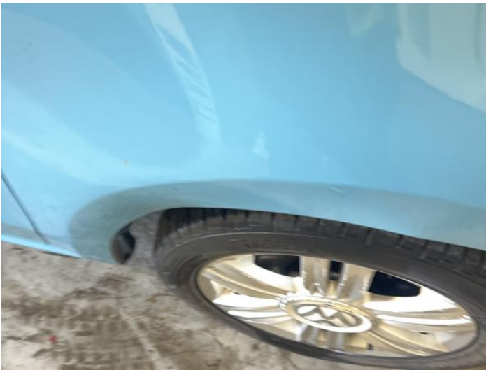
5: Wing osf Dented Over 30mm