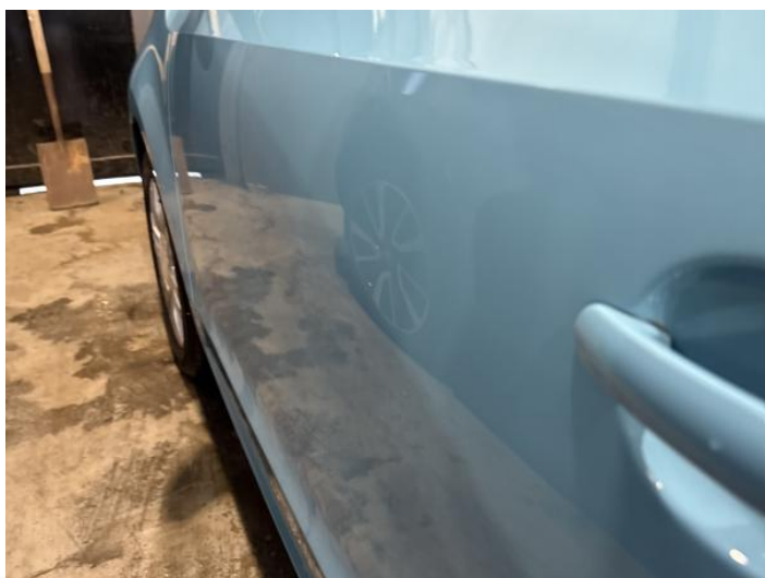
13: Door nsf Dented Over 2 UpTo 10mm