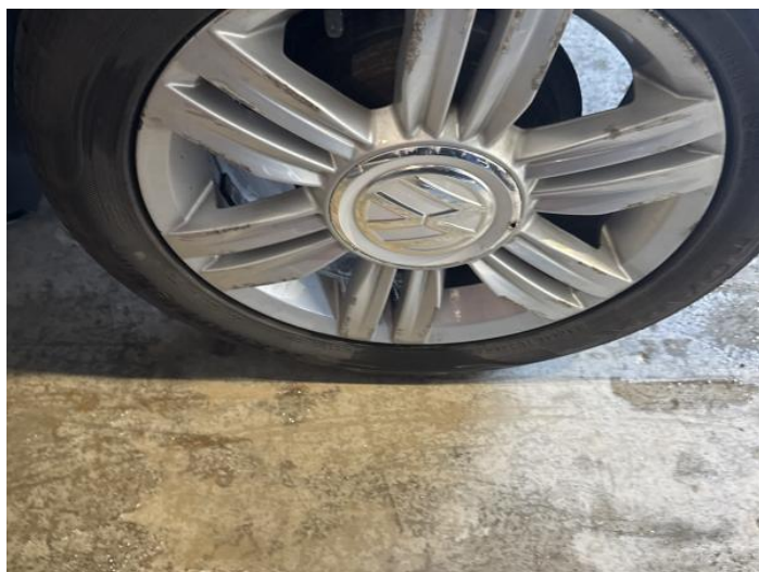
12: Wheel nsr Scratched Over 50mm