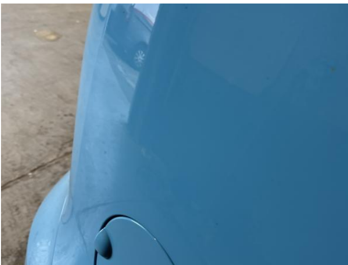
7: Qtr Panel osr Dented Between 10mm + 30mm