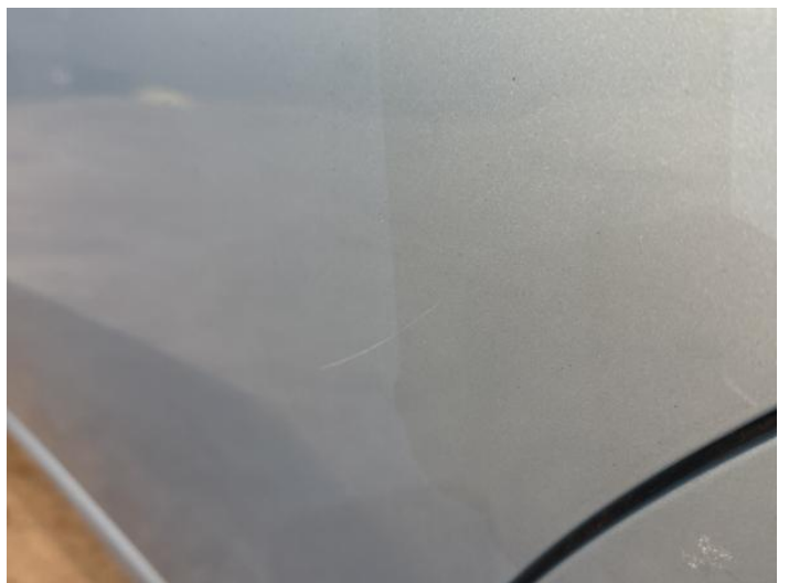
8: Door nsr Scratched Over 25mm Thru Paint