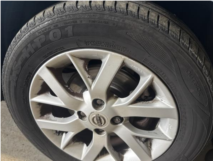
15: Wheel of Scratched Over 50mm