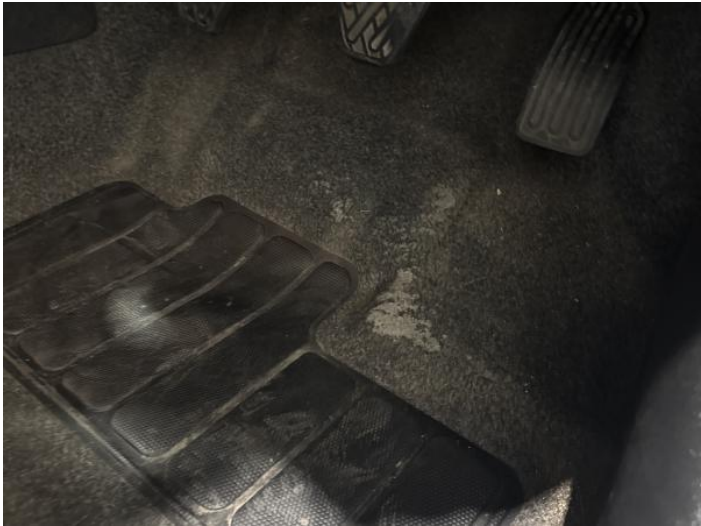
16: Carpets Front Scuffed Over 25mm