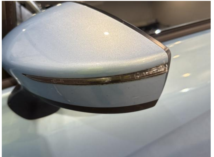
6: Door Mirror Assy nsf Scratched (Painted) UpTo 25mm Thru Paint