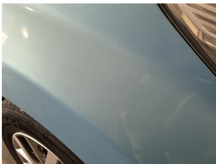
14: Wing osf Chipped 1 To 5