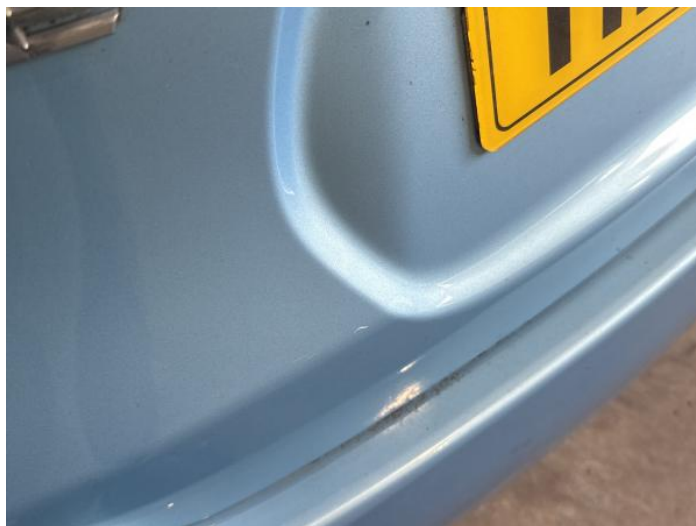
10: Tailgate Scratched UpTo 25mm Thru Paint