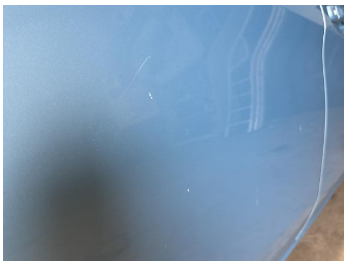
12: Door osr Scratched Over 25mm Thru Paint