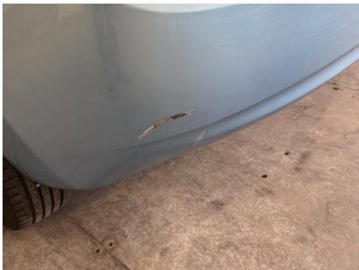
9: Bumper Rear Scratched Over 100mm Thru Paint