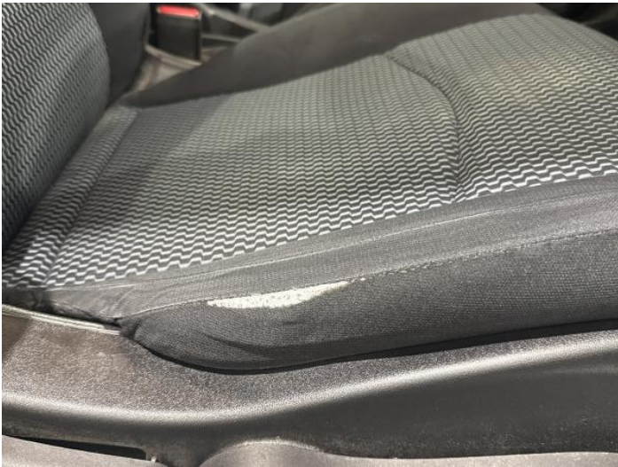
17: Seat Base Cover of Scuffed Over 25mm