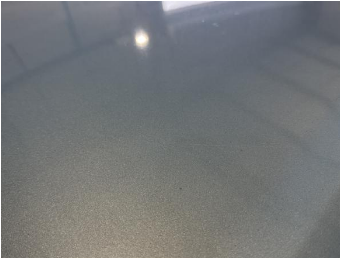
5: Roof Scratched Over 25mm Thru Paint