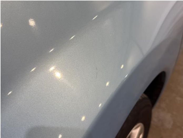
3: Wing nsf Scratched UpTo 25mm Thru Paint