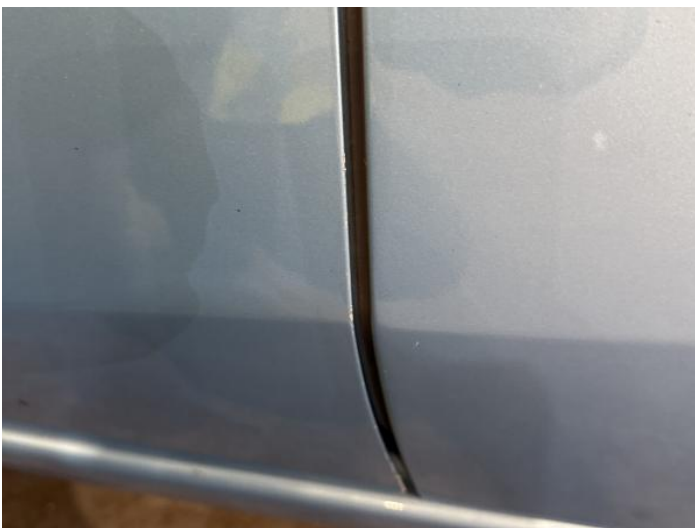
7: Door nsf Chipped Edge Chip