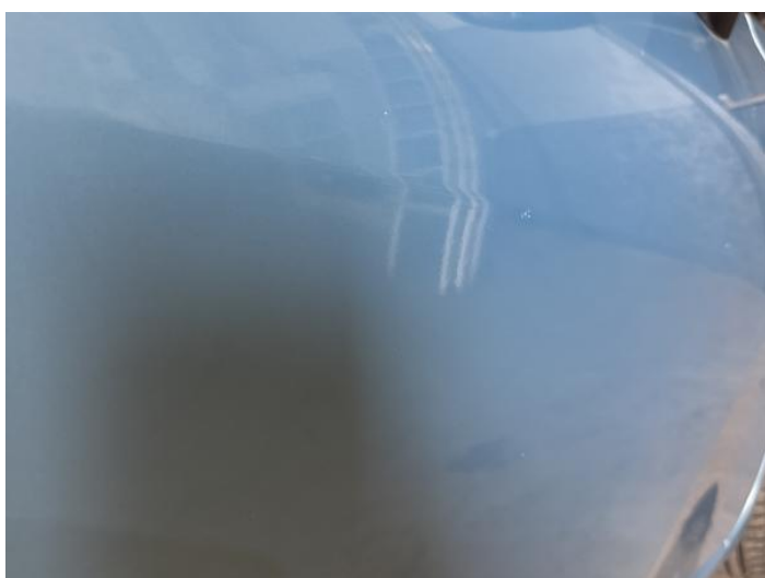
13: Door osf Dented With Paint Damage