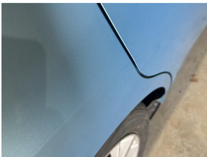
11: Qtr Panel osr Scratched Over 25mm Thru Paint