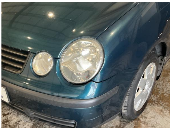
2: Bumper Front Scratched Over 100mm Thru Paint