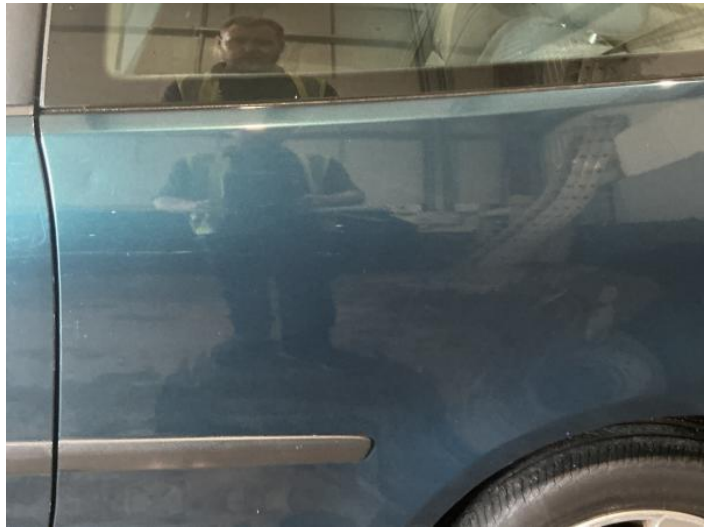
6: Qtr Panel nsr Dented With Paint Damage