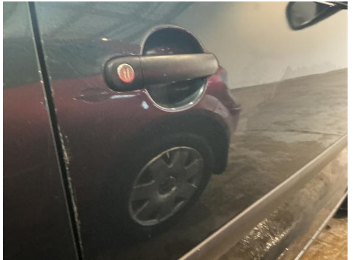
12: Door osf Dented With Paint Damage