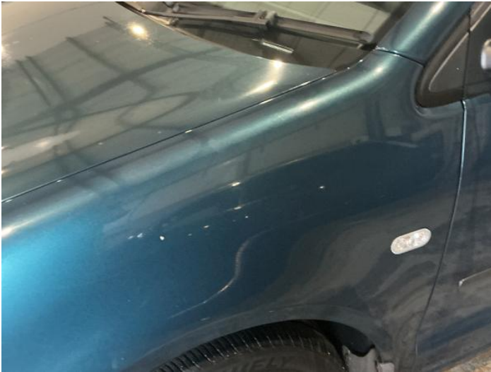
3: Wing nsf Chipped Multiple Chips