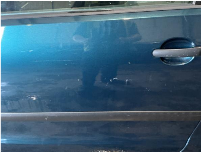
5: Door nsf Chipped Multiple Chips