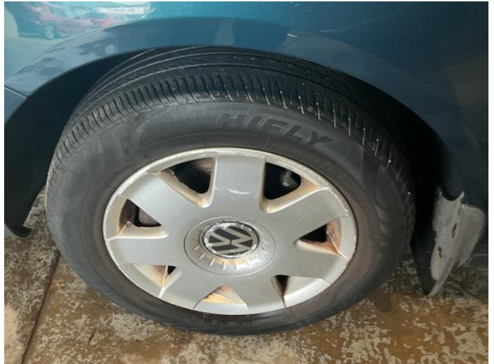
4: Wheel nsf Scratched Over 50mm