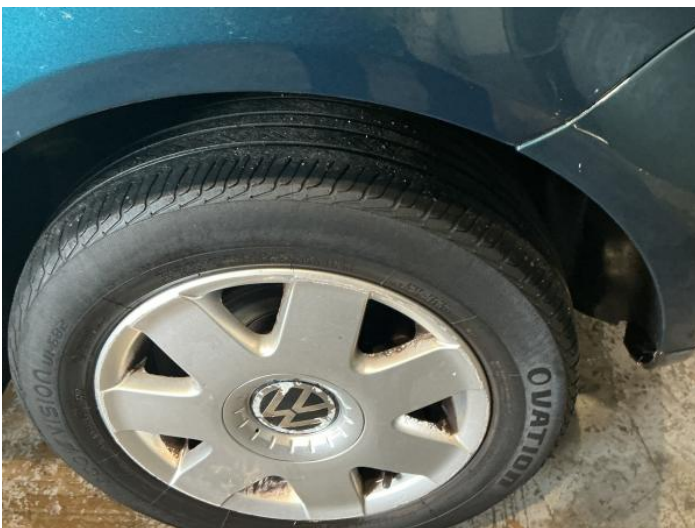
7: Wheel nsr Scratched Over 50mm