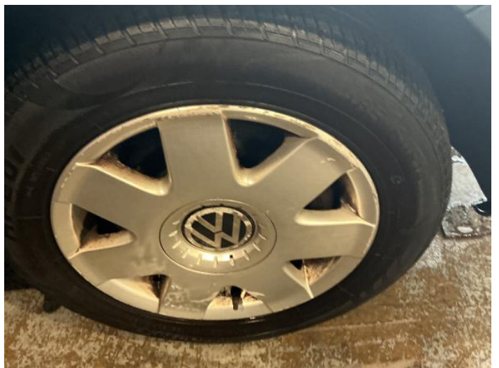
14: Wheel osf Scratched Over 50mm