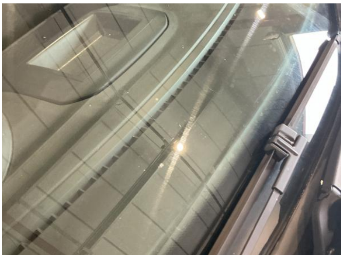
15: Screen Front Chipped UpTo 10mm