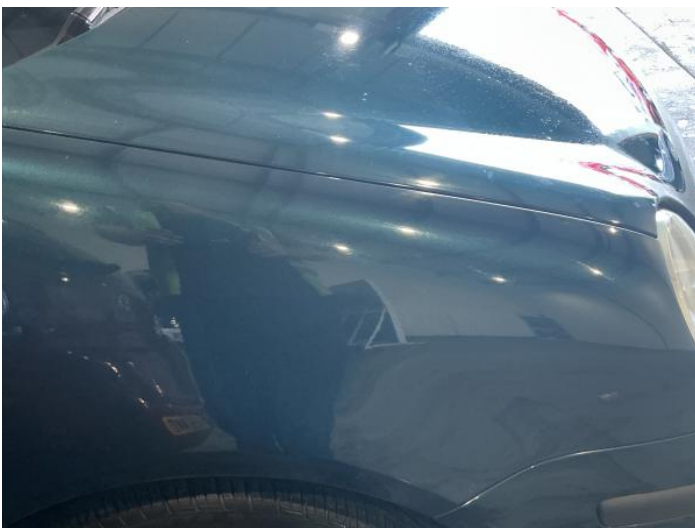
13: Wing osf Chipped 1 To 5