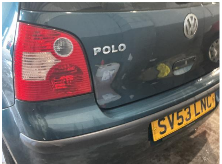
8: Bumper Rear Scratched Over 100mm Thru Paint