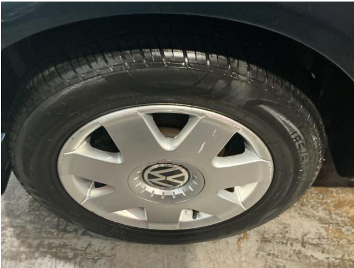
11: Wheel osr Scratched Over 50mm