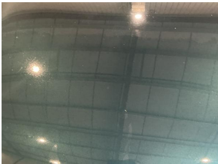
1: Bonnet Chipped 1 To 5