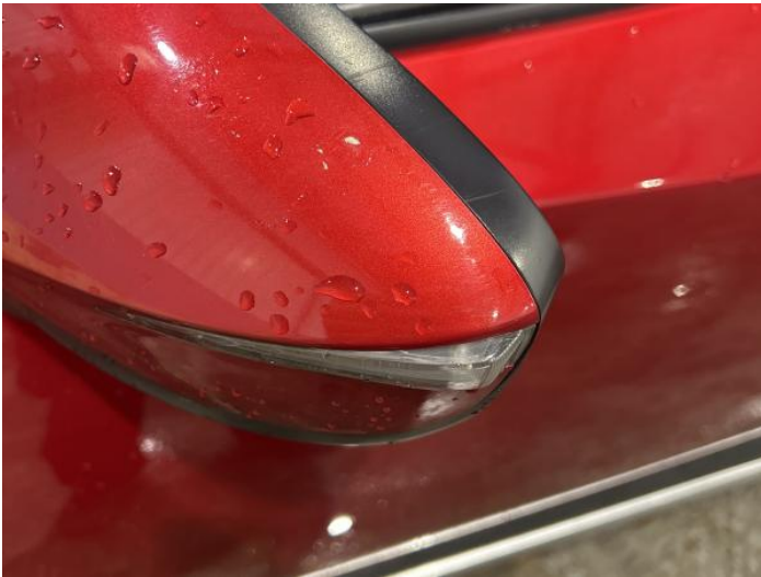
11: Door Mirror Assy nsf Scratched (Painted) UpTo 25mm Thru Paint