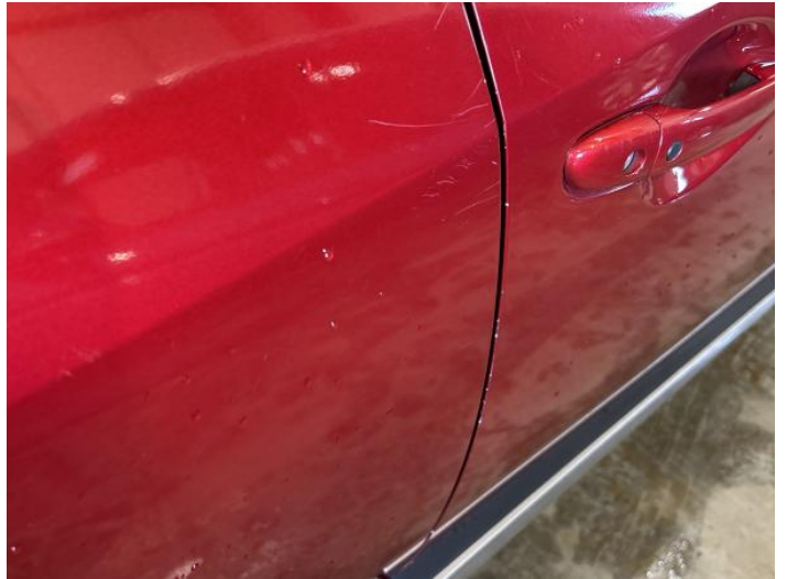
4: Door osr Scratched Over 25mm Not Thru Paint