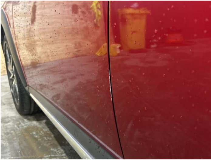
9: Door nsf Chipped Edge Chip