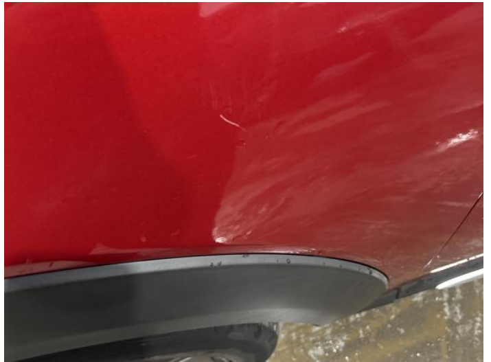
12: Wing nsf Scratched UpTo 25mm Thru Paint