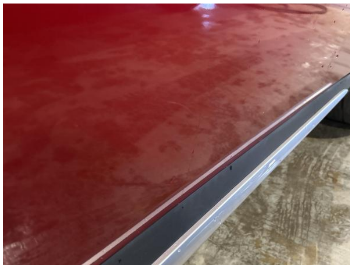
2: Door osf Scratched Over 25mm Not Thru Paint