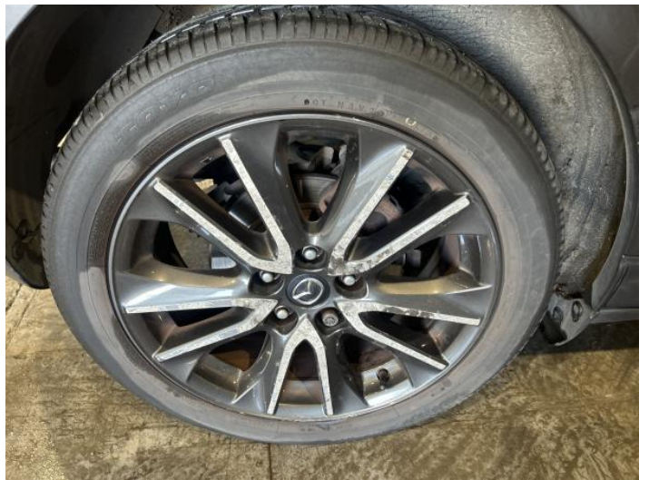
6: Wheel osr Scratched Over 50mm