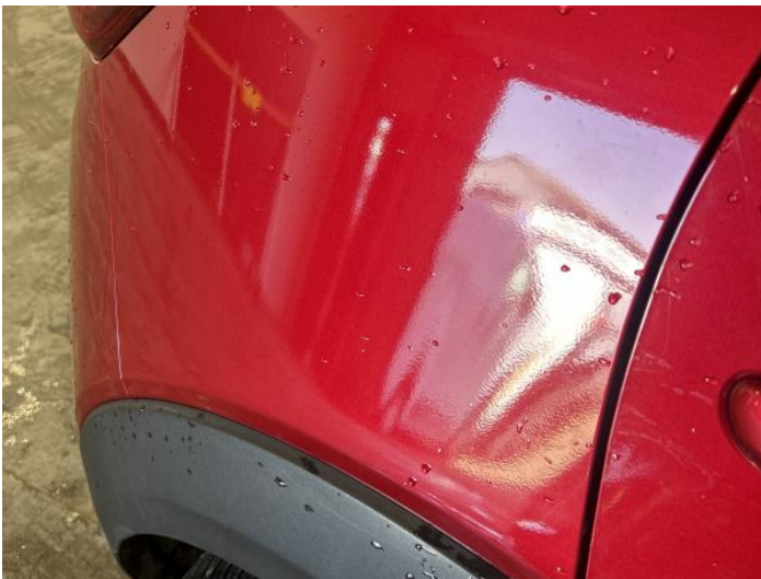
5: Qtr Panel osr Poor Previous Repair Poor Paint