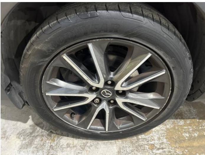
13: Wheel nsf Scratched Over 50mm