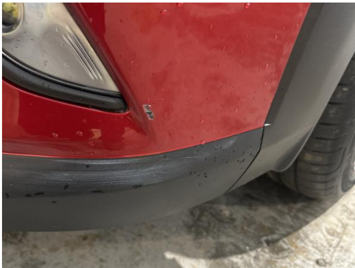
15: Bumper Front Chipped 1 To 5