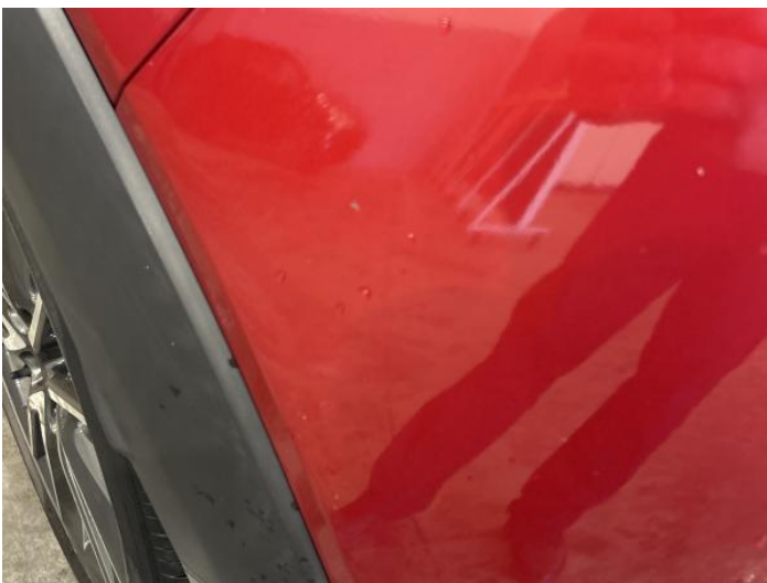
7: Bumper Rear Chipped 1 To 5