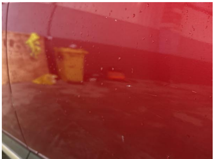
8: Door nsr Scratched Over 25mm Not Thru Paint