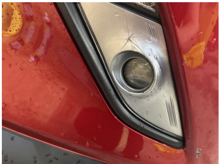
14: Flasher Side Repeater ns Broken Replace