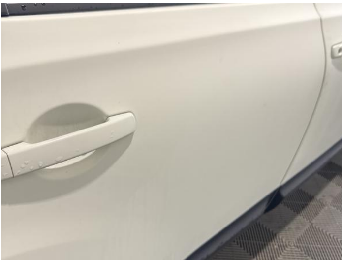
13: Door osr Poor Previous Repair Poor Paint