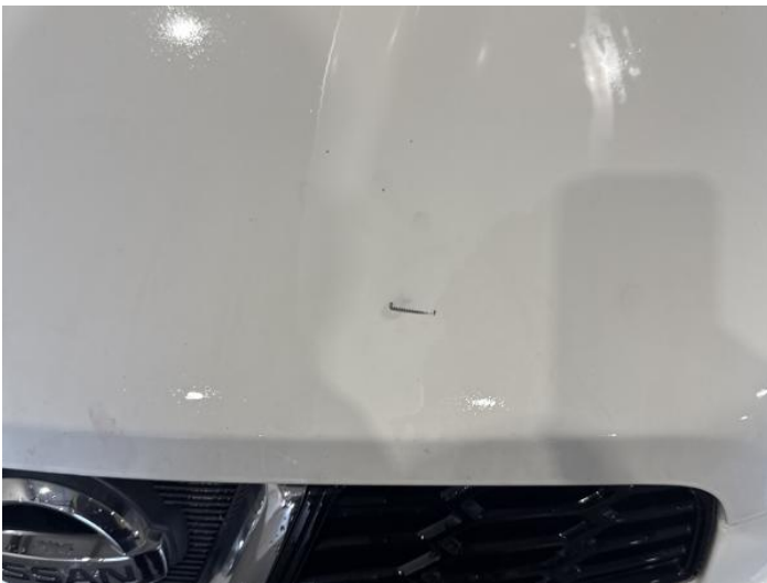
1: Bonnet Dented With Paint Damage