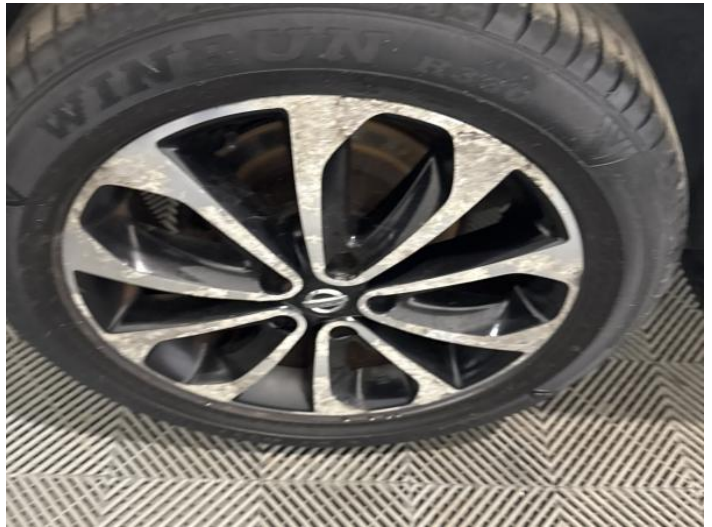
12: Wheel osr Scratched Over 50mm