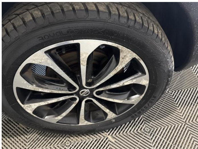
16: Wheel of Scratched Over 50mm