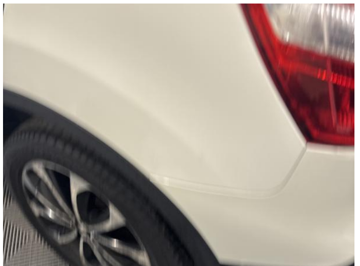
8: Qtr Panel nsr Poor Previous Repair Poor Paint