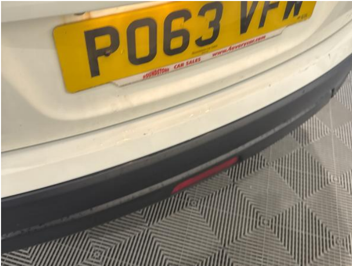
9: Bumper Rear Poor Previous Repair Poor Paint