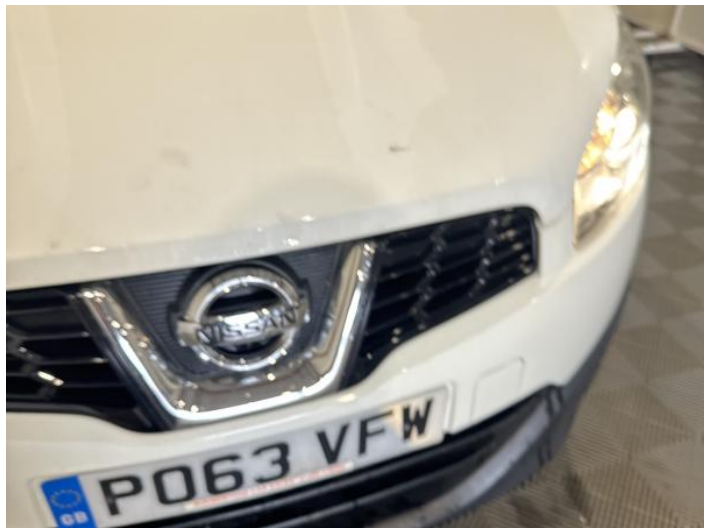
2: Bumper Front Poor Previous Repair Poor Colour