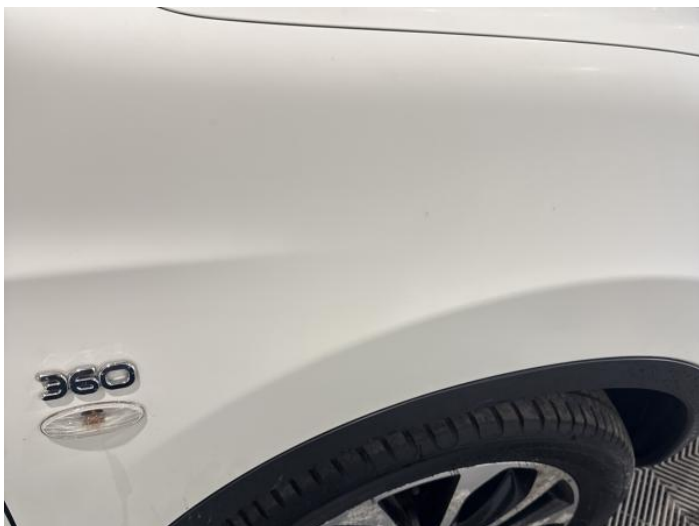
15: Wing of Poor Previous Repair Poor Paint