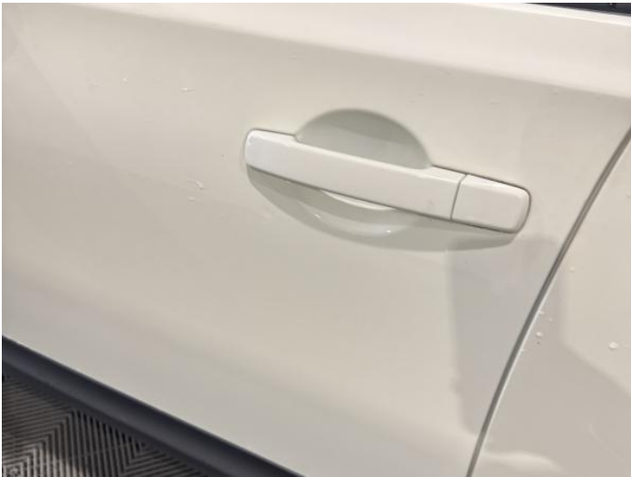
5: Door nsf Poor Previous Repair Poor Paint