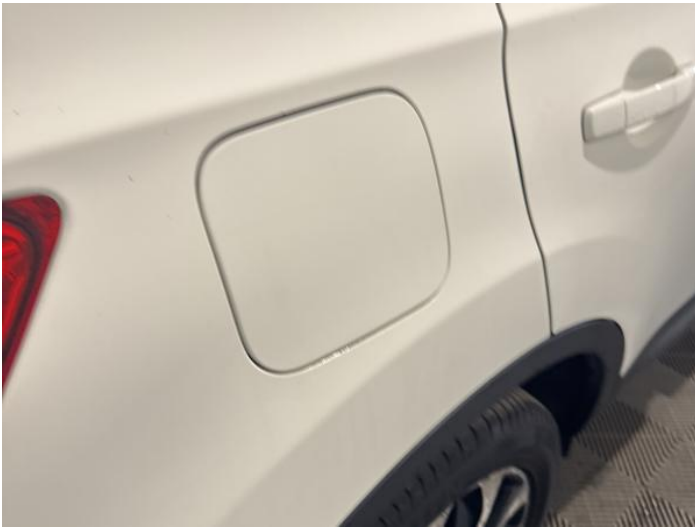
11: Qtr Panel osr Poor Previous Repair Poor Paint