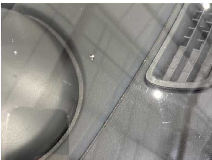
17: Screen Front Chipped Up To 10mm