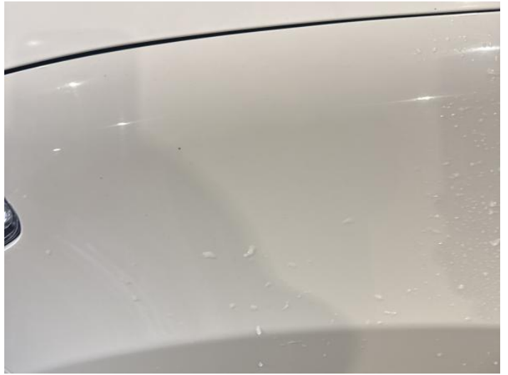
4: Wing nsf Chipped 1 To 5