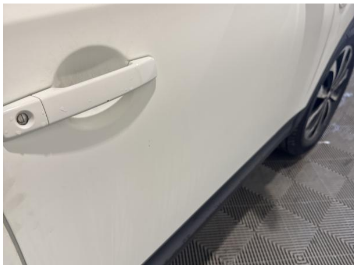
14: Door osf Poor Previous Repair Poor Paint