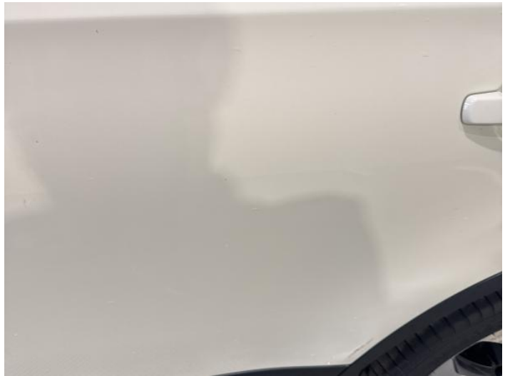
6: Door nsr Dented With Paint Damage