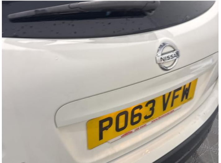
10: Boot Lid Poor Previous Repair Poor Paint