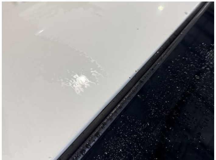
16: Roof Chipped Multiple Chips