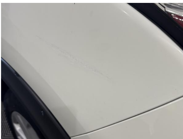
7: Qtr Panel nsr Dented With Paint Damage