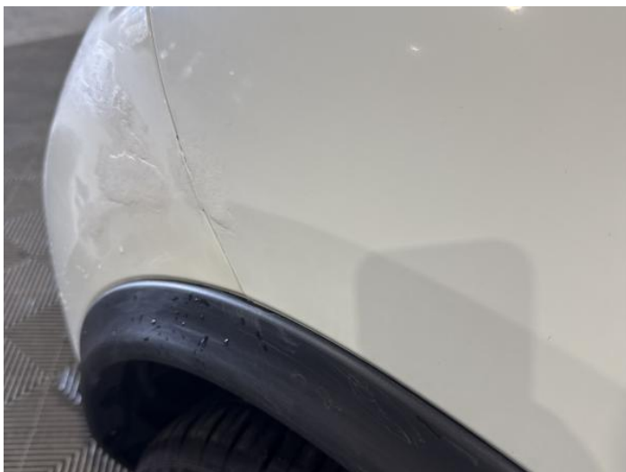
3: Wing nsf Scratched Over 25mm Thru Paint