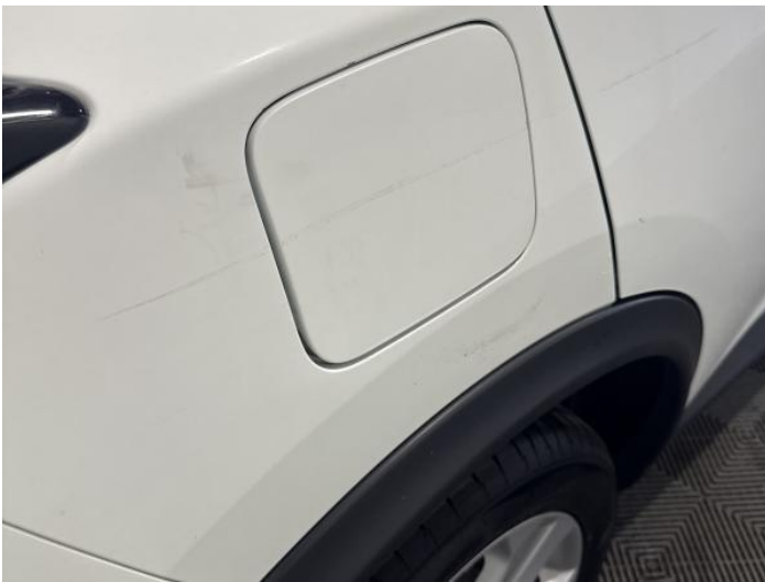
11: Qtr Panel osr Scratched Over 25mm Thru Paint