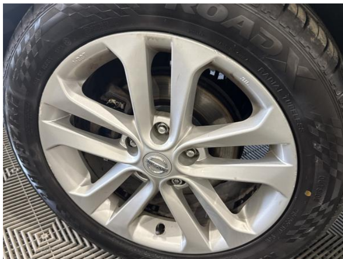
4: Wheel nsf Scratched Over 50mm