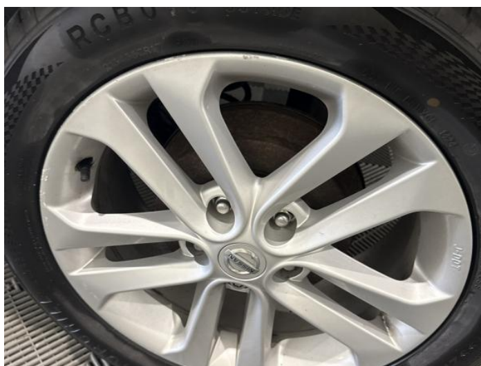
6: Wheel nsr Scratched Over 50mm