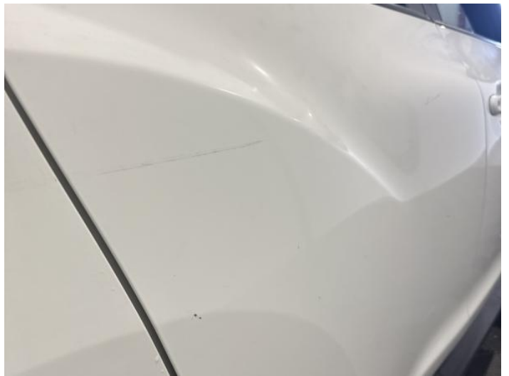
12: Door osr Scratched Over 25mm Thru Paint