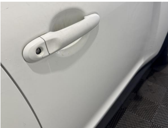
13: Door osf Dented Between 10mm + 30mm