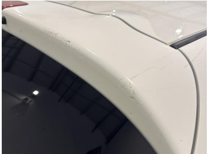
10: Tailgate Scratched Over 25mm Not Thru Paint