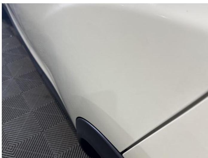
8: Door nsr Scratched Over 25mm Thru Paint