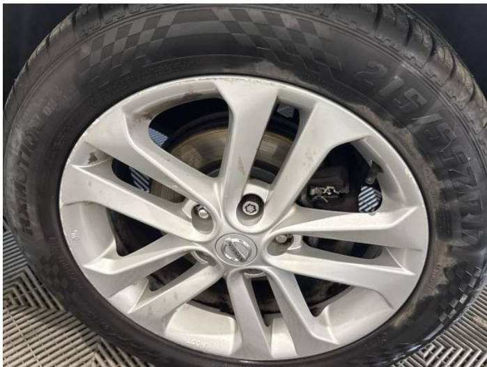
15: Wheel osf Scratched Over 50mm