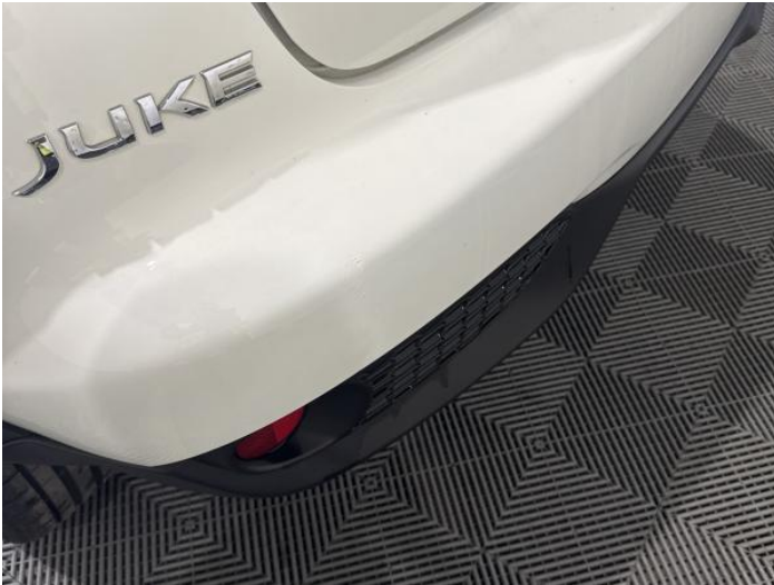
9: Bumper Rear Dented With Paint Damage