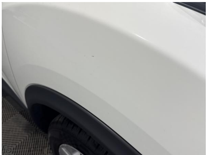
14: Wing osf Scratched Over 25mm Thru Paint