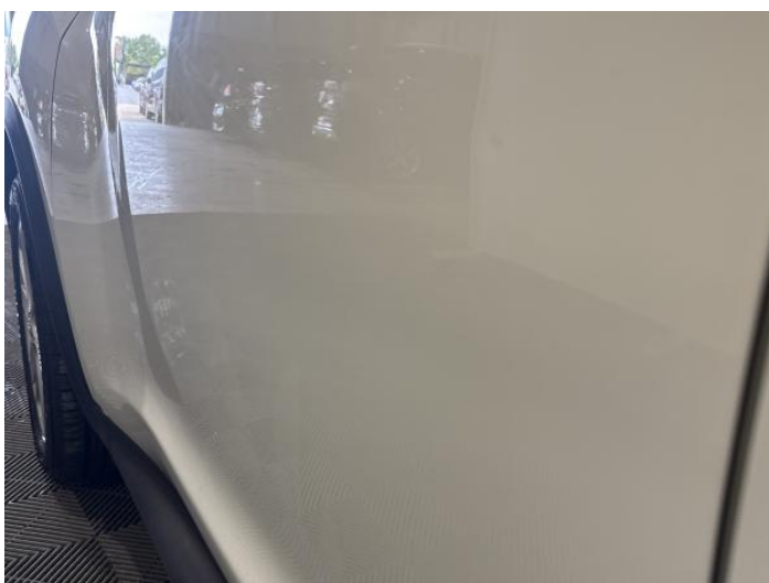
5: Door nsf Dented Between 10mm + 30mm