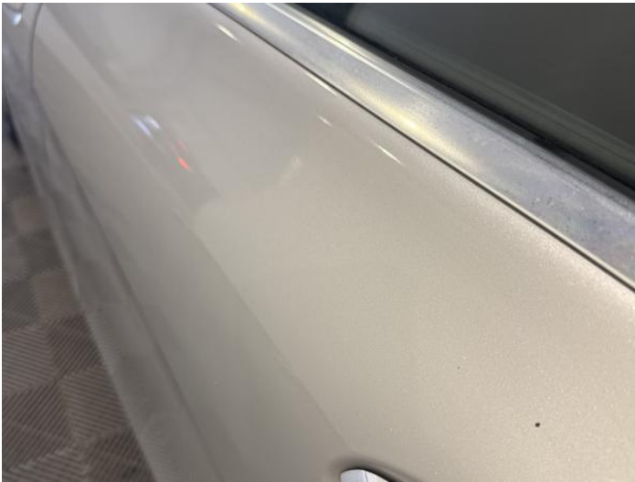
5: Door nsr Dented Between 10mm + 30mm