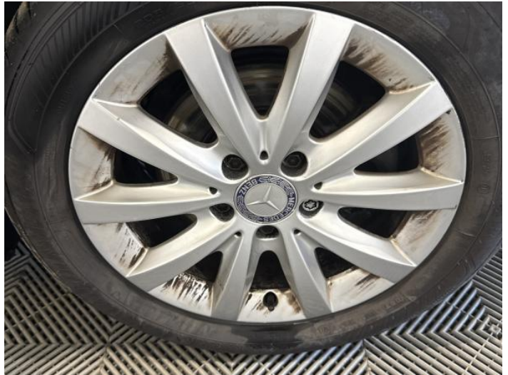
10: Wheel osf Scratched Up To 50mm