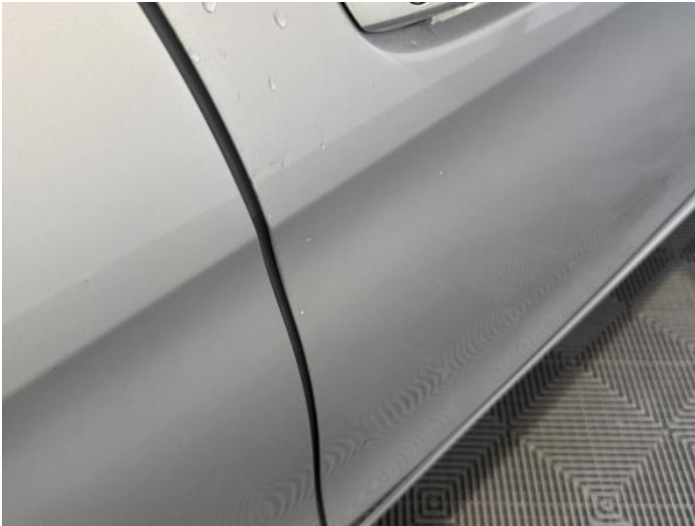
9: Door osf Chipped Edge Chip