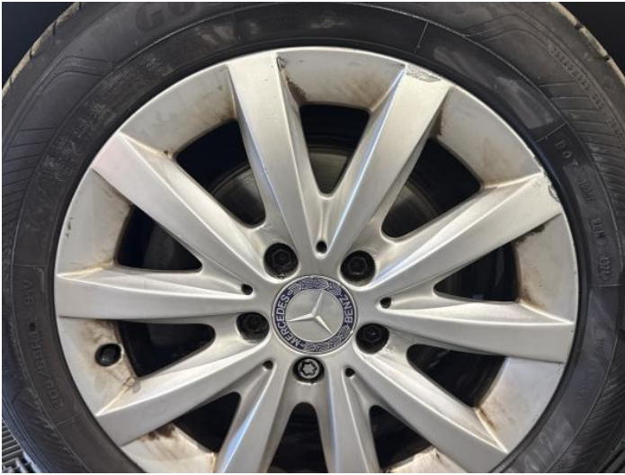
3: Wheel nsf Scratched Over 50mm