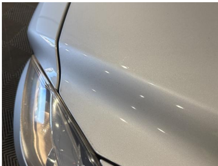
2: Bonnet Chipped 1 To 5