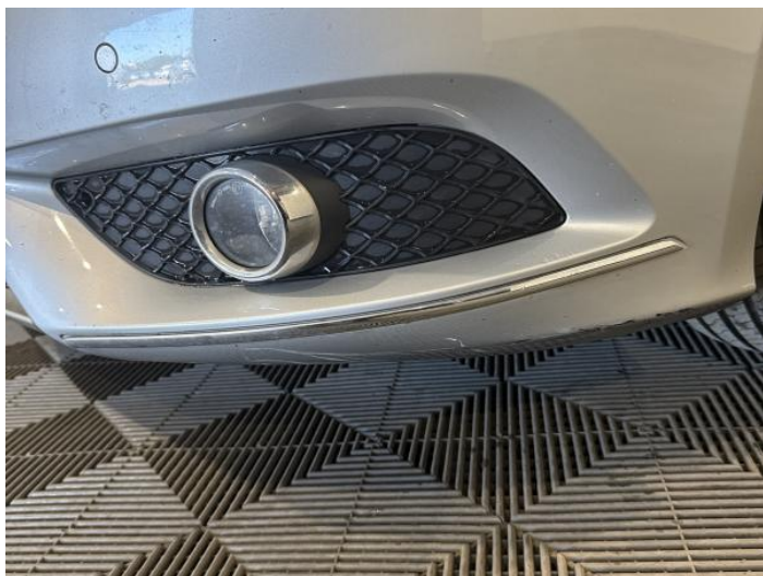
1: Bumper Front Scratched Over 100mm Thru Paint