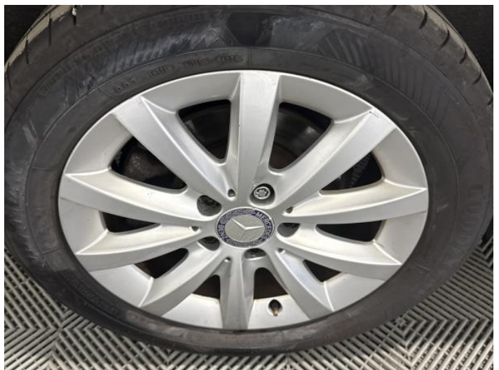
8: Wheel osr Scratched Up To 50mm