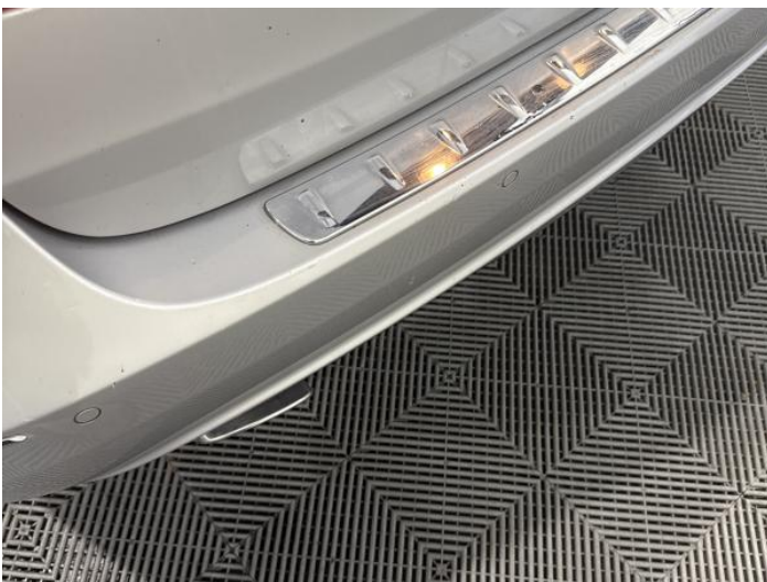
7: Bumper Rear Scratched 25 to 100mm Thru Paint