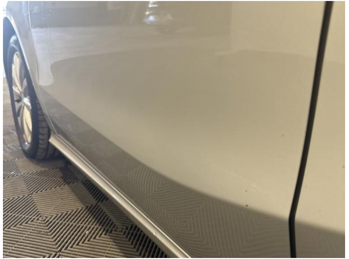
4: Door nsf Dented Between 10mm + 30mm