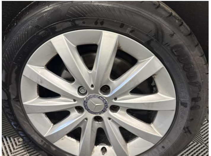
6: Wheel nsr Scratched Up To 50mm