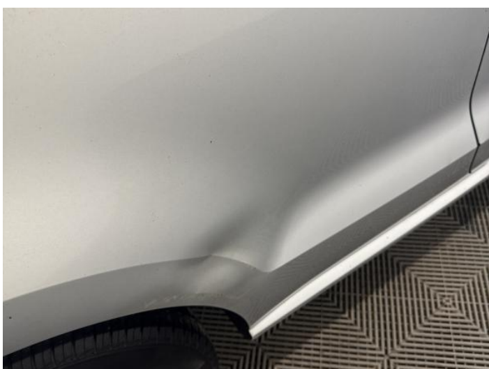
7: Qtr Panel osr Dented Over 30mm