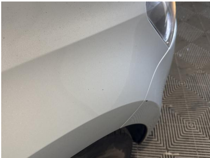
9: Wing of Chipped 1 To 5