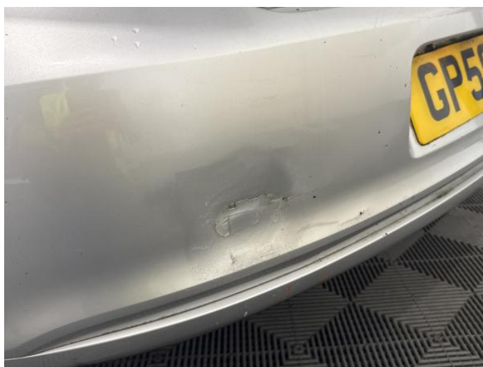
6: Bumper Rear Dented With Paint Damage