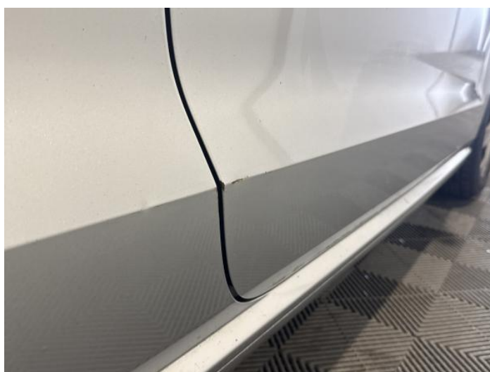
8: Door osf Dented With Paint Damage