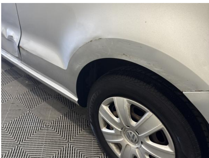
5: Qtr Panel nsr Dented With Paint Damage