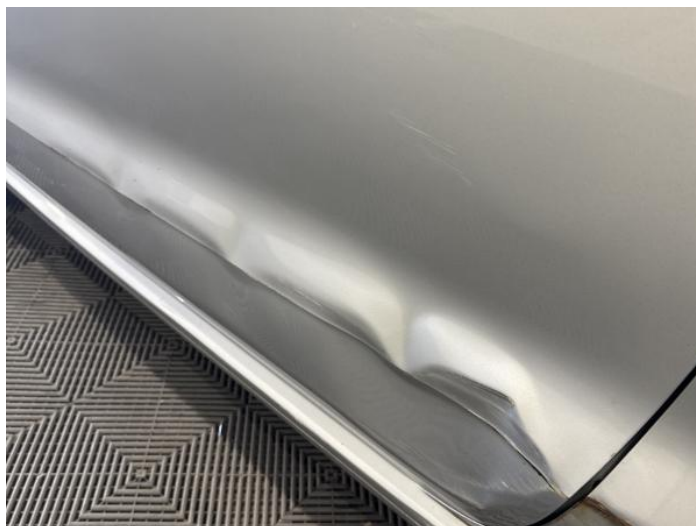
4: Door nsf Dented Over 30% Of Panel