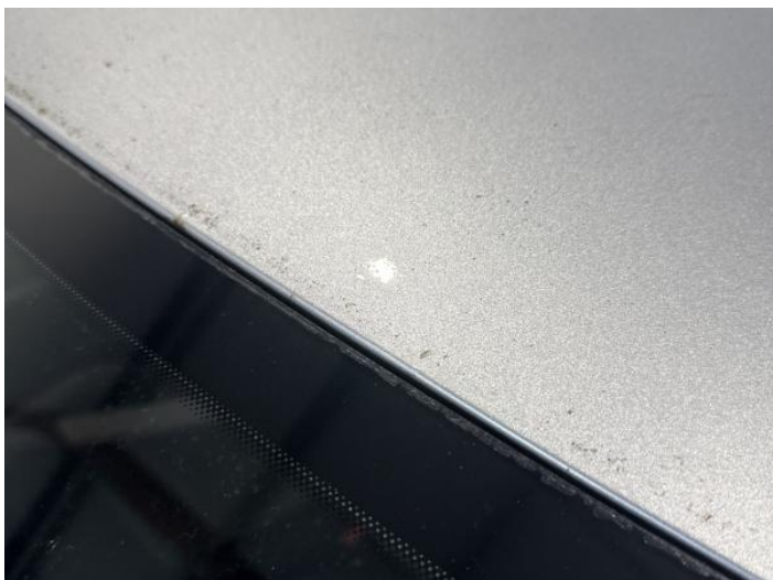
3: Roof Chipped Edge Chip