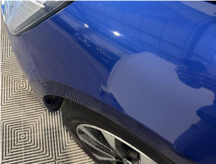
3: Wing nsf Chipped 1 To 5