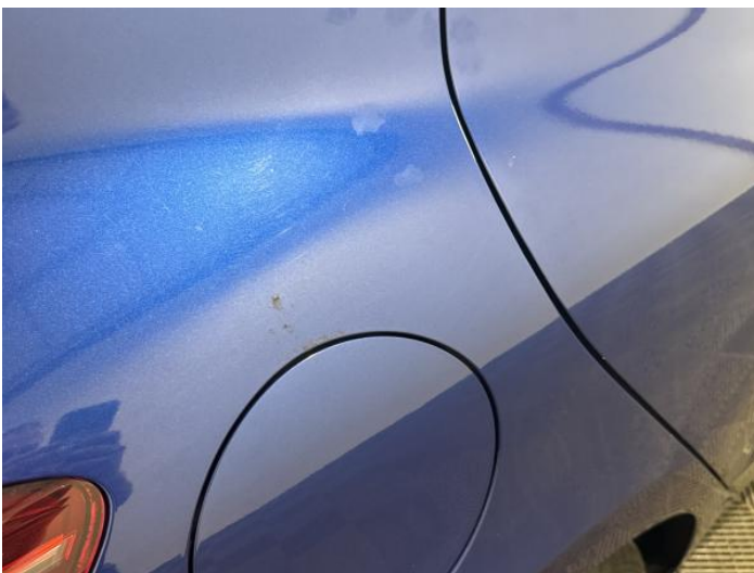
7: Qtr Panel osr Scratched Over 25mm Thru Paint