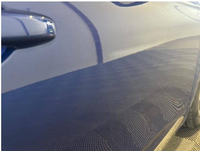
9: Door osf Chipped Multiple Chips