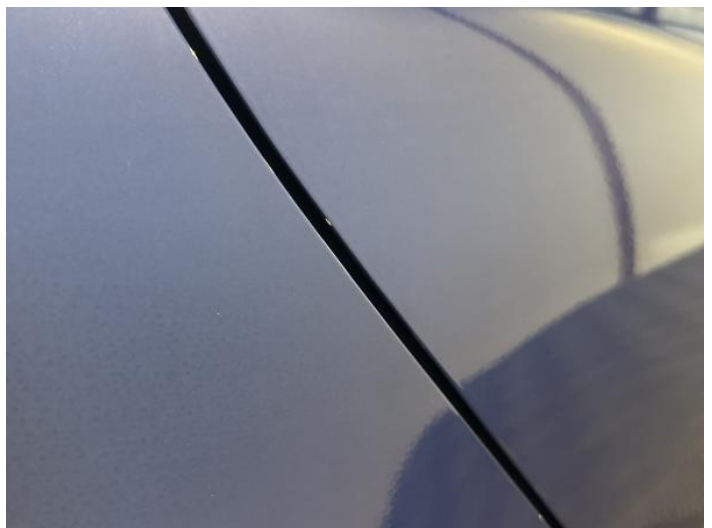
8: Door osr Scratched Over 25mm Thru Paint