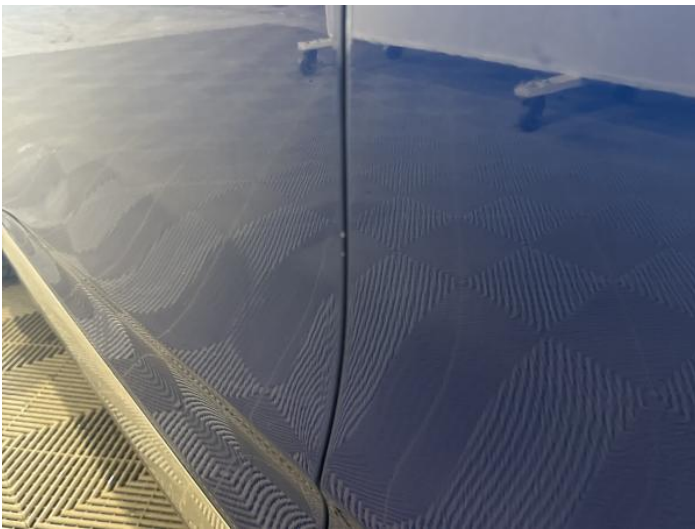
5: Door nsf Chipped Edge Chip