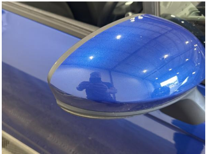
10: Door Mirror Assy osf Scratched (Painted) UpTo 25mm Thru Paint