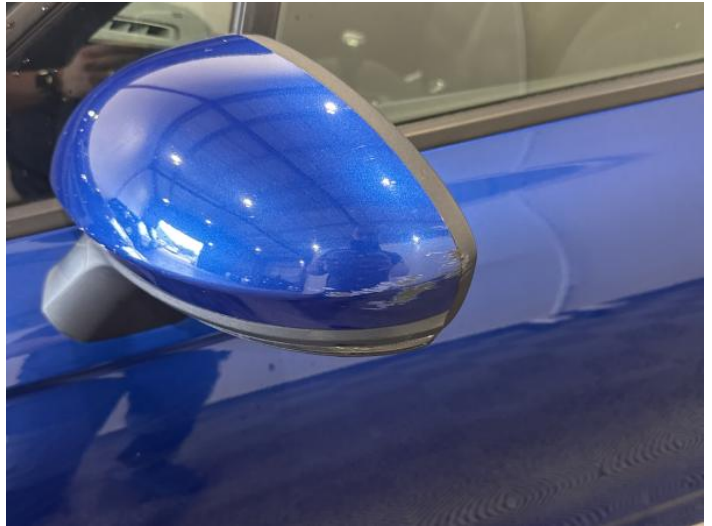
4: Door Mirror Assy nsf Scratched (Painted) Over 25mm Thru Paint