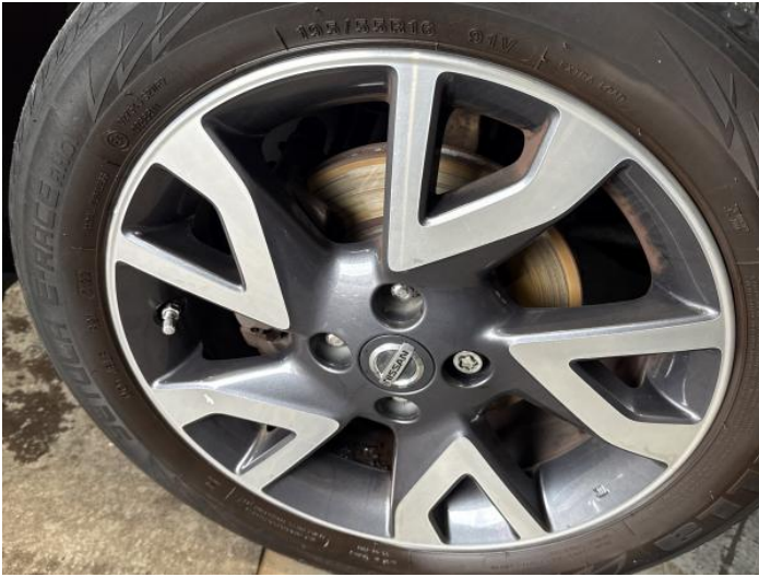
3: Wheel nsf Scratched Up To 50mm