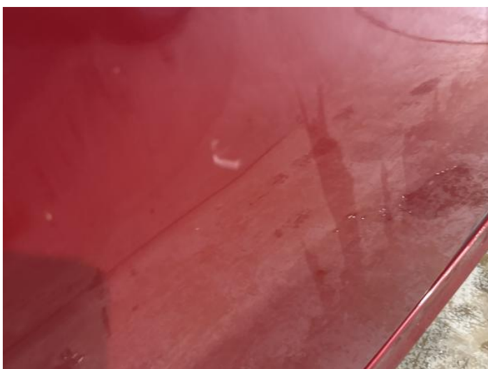
11: Door osf Dented With Paint Damage