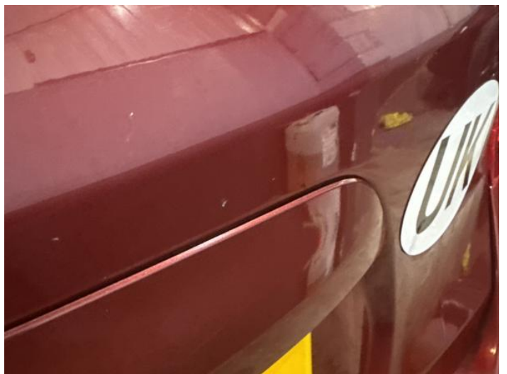
8: Tailgate Dented With Paint Damage