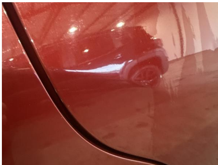
10: Door osr Scratched UpTo 25mm Thru Paint