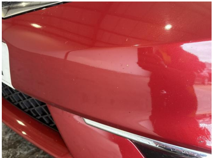
2: Bumper Front Poor Previous Repair Poor Colour