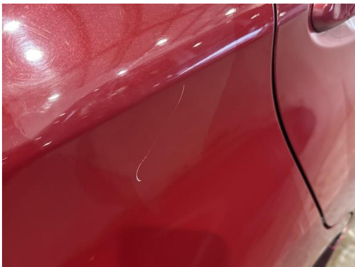
9: Qtr Panel osr Scratched Over 25mm Thru Paint