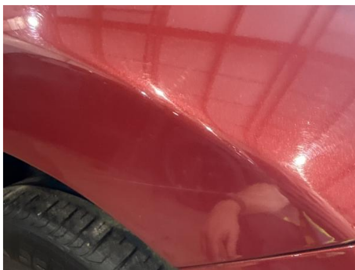
12: Wing osf Scratched Over 25mm Thru Paint