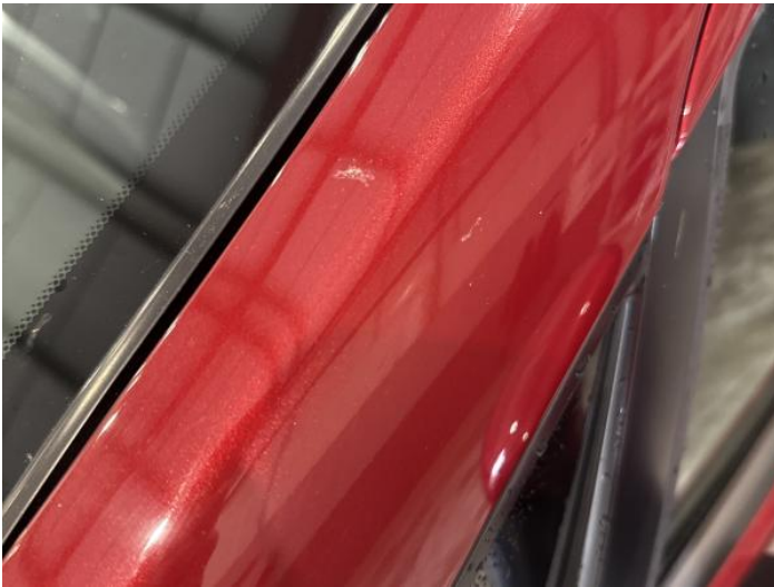
5: A Post ns Chipped 1 To 5