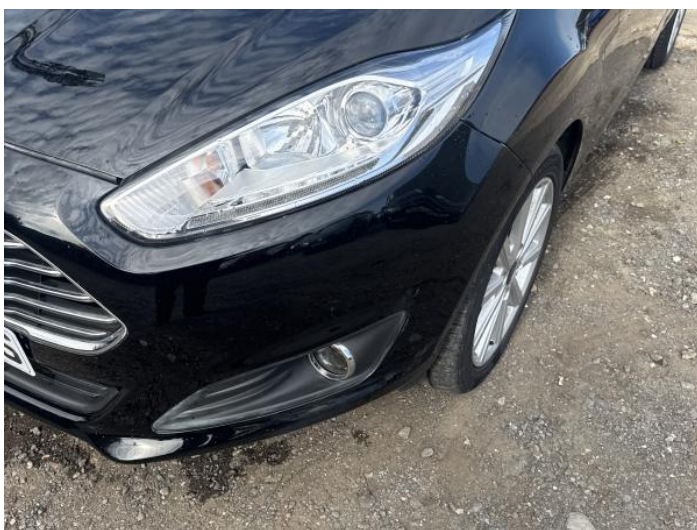
13: Bumper Front Scratched Over 100mm Thru Paint