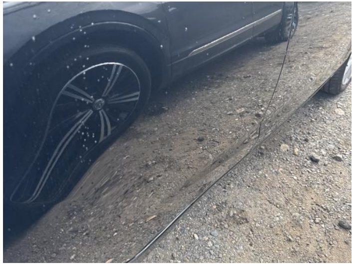
6: Door osr Chipped 1 To 5