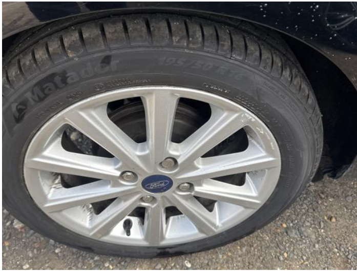
5: Wheel osr Scratched Over 50mm