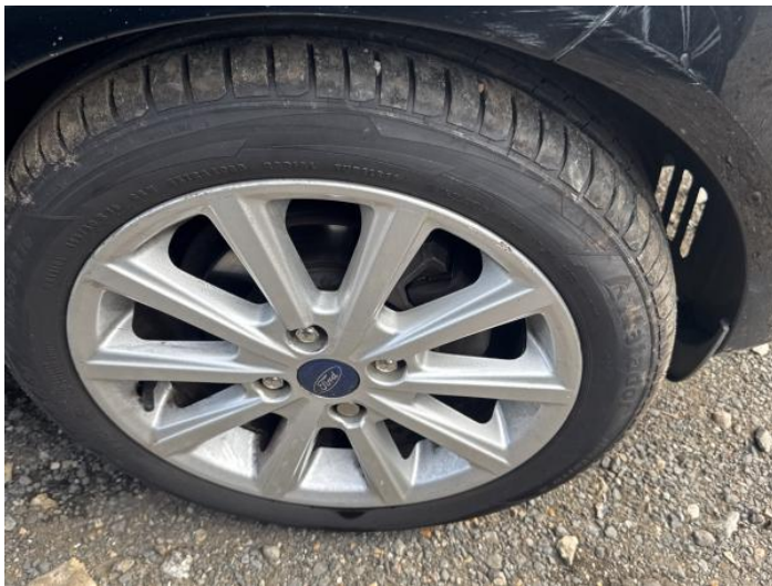
11: Wheel osf Scratched Over 50mm