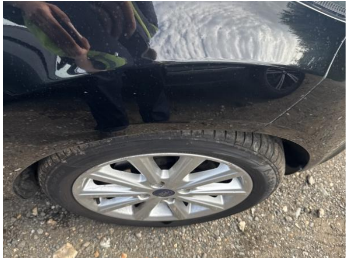
10: Wing osf Scratched Over 25mm Thru Paint