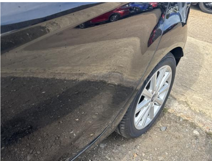
19: Door nsr Chipped 1 To 5