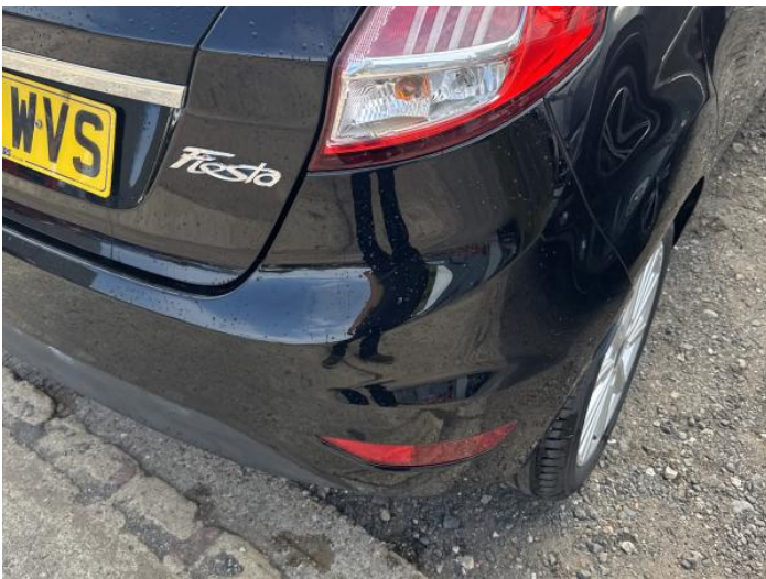
1: Bumper Rear Chipped Multiple Chips