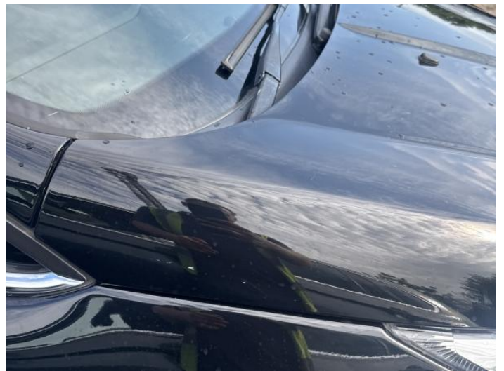
12: Bonnet Chipped Multiple Chips