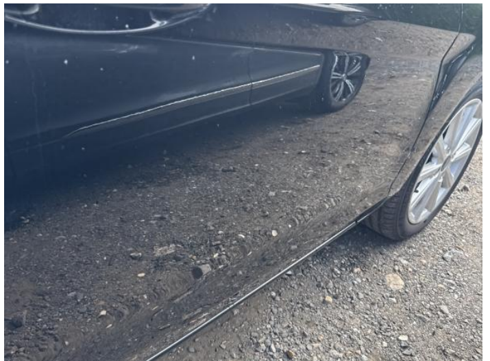
8: Door osf Chipped 1 To 5