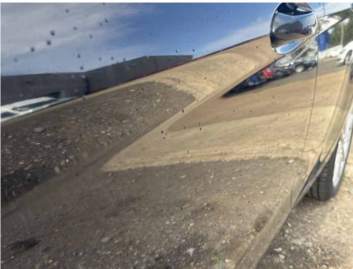
17: Door nsf Chipped 1 To 5