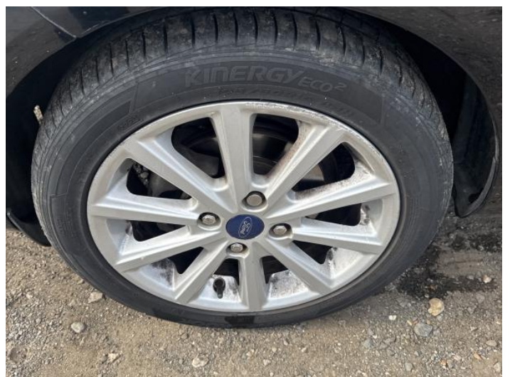
14: Wheel nsf Scratched Over 50mm