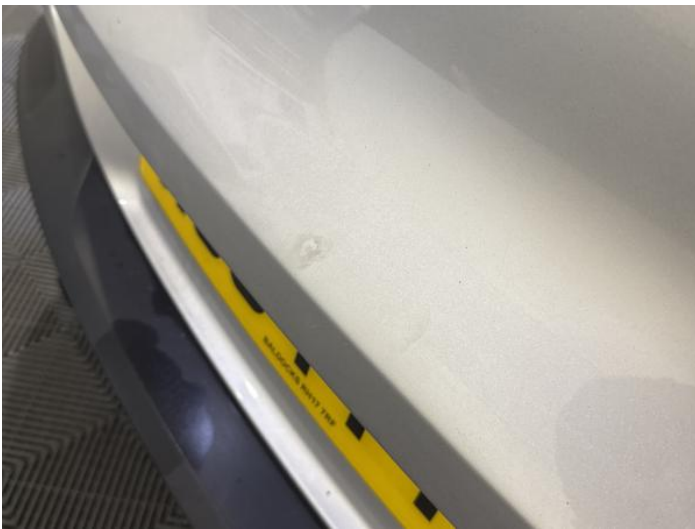
11: Tailgate Scratched Over 25mm Thru Paint