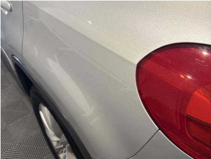
9: Qtr Panel nsr Scratched Over 25mm Thru Paint