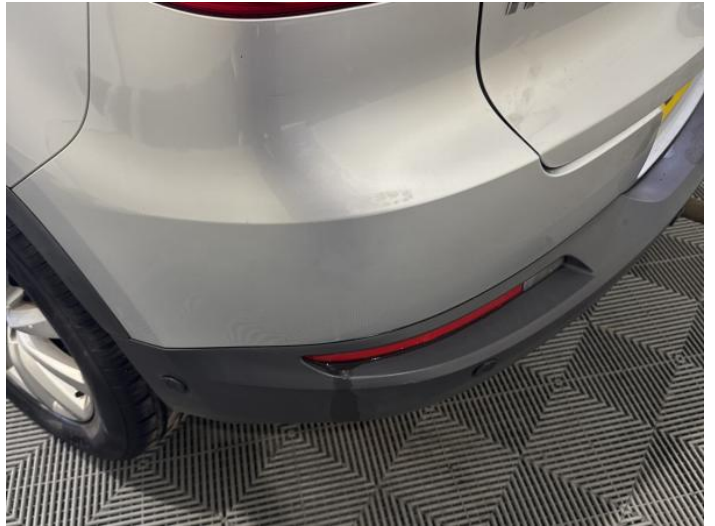
10: Bumper Rear Scratched 25 to 100mm Thru Paint