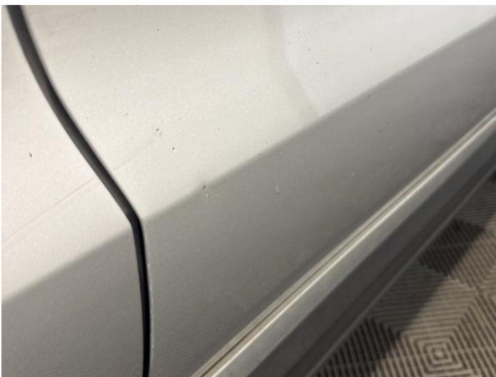
13: Door osf Dented Over 30mm