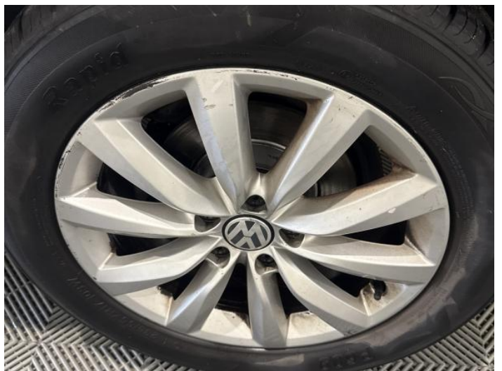
8: Wheel nsr Scratched Over 50mm