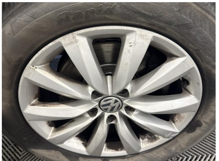
14: Wheel osf Scratched Over 50mm