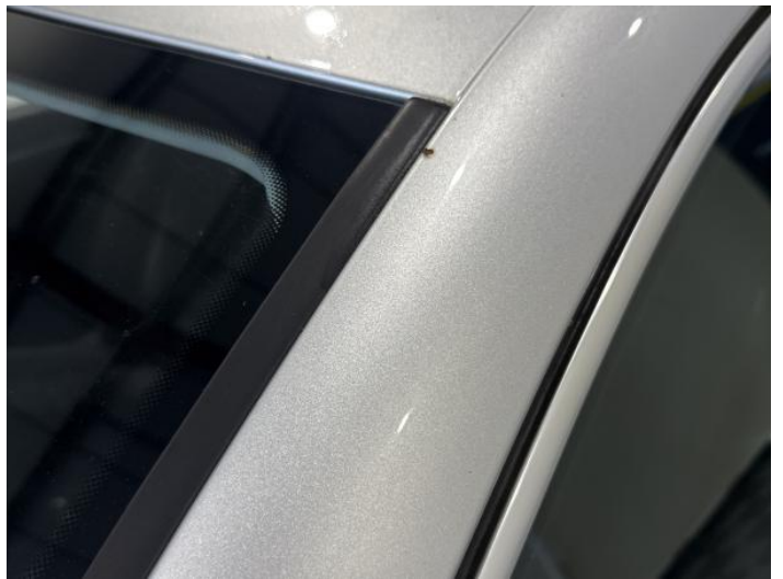
6: A Post ns Chipped Over 5mm