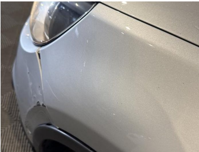
5: Wing nsf Scratched Over 25mm Thru Paint