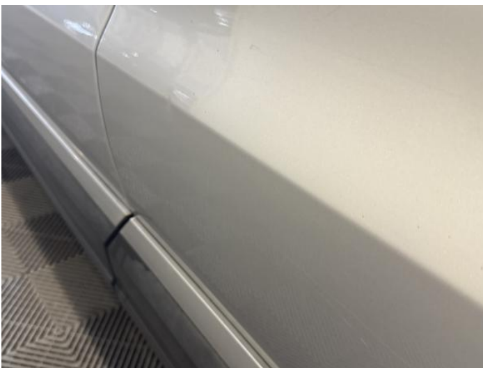
7: Door nsr Dented Between 10mm + 30mm