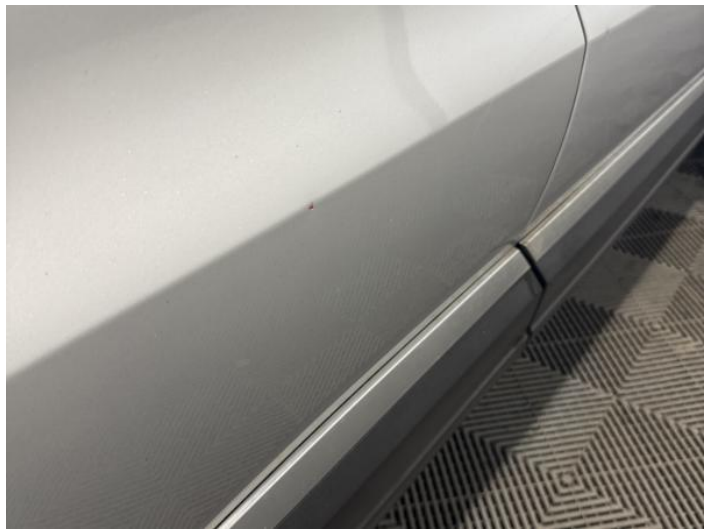
12: Door osr Dented Between 10mm + 30mm