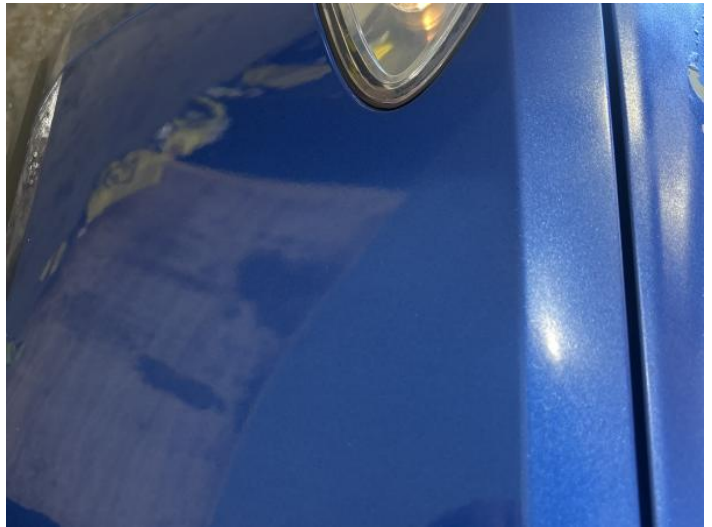
6: Wing nsf Poor Previous Repair Poor Paint