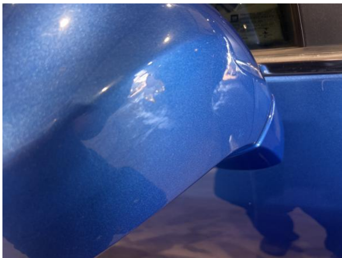
1: Door Mirror Assy osf Scratched (Painted) UpTo 25mm Thru Paint