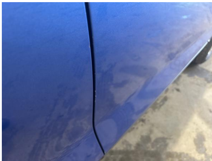
2: Door osf Chipped Edge Chip