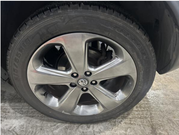
11: Wheel nsr Scratched Over 50mm