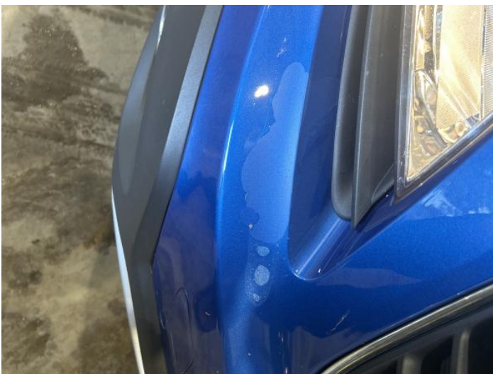
7: Bumper Front Poor Previous Repair Paint Flake