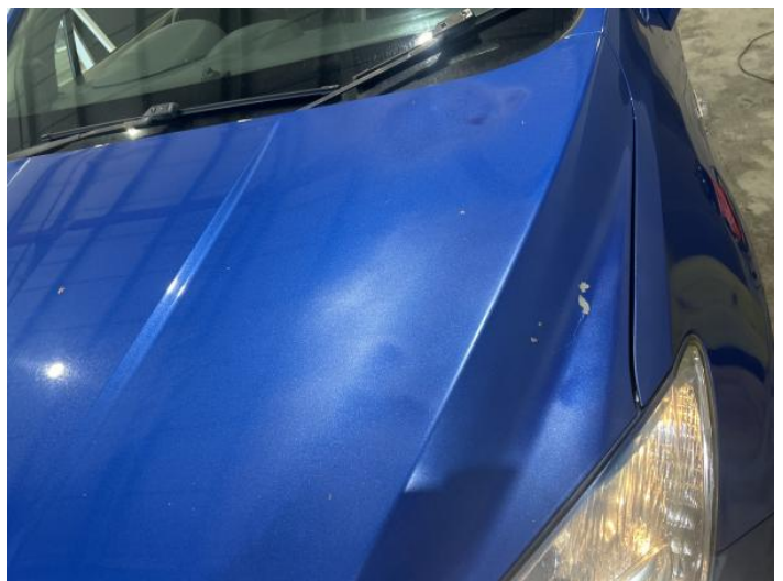
8: Bonnet Poor Previous Repair Poor Paint