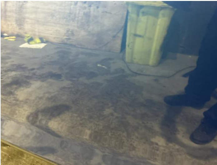
5: Door nsf Scratched UpTo 25mm Thru Paint