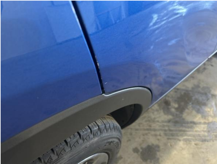
3: Door osr Chipped Edge Chip