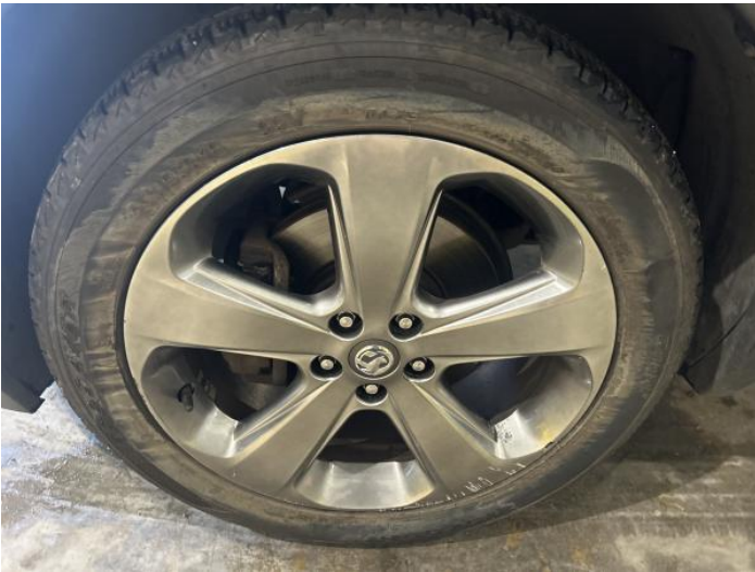
12: Wheel nsf Scratched Over 50mm