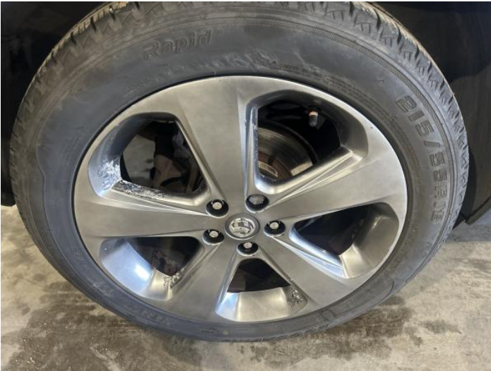
10: Wheel osr Scratched Over 50mm