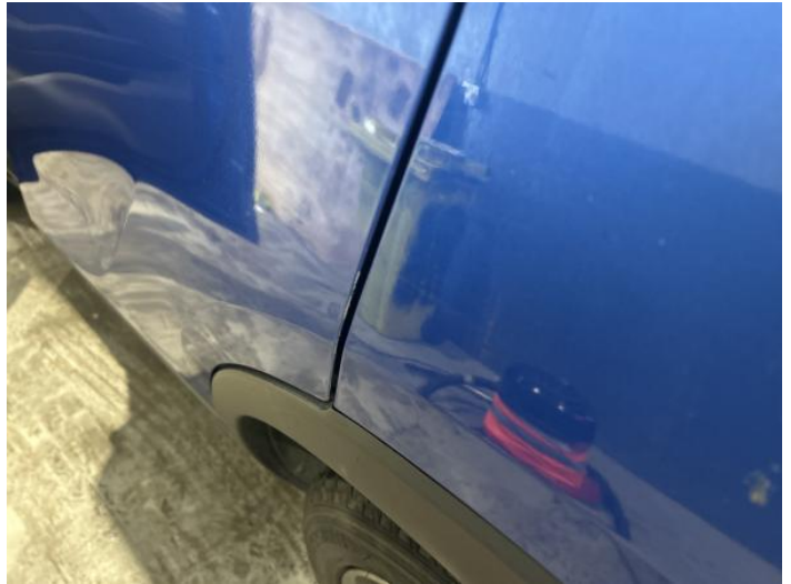
4: Door nsr Chipped Edge Chip