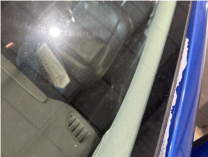
9: A Post ns Poor Previous Repair Paint Flake