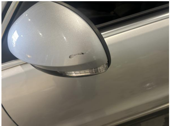
12: Door Mirror Assy nsf Scratched (Painted) Over 25mm Not Thru Paint