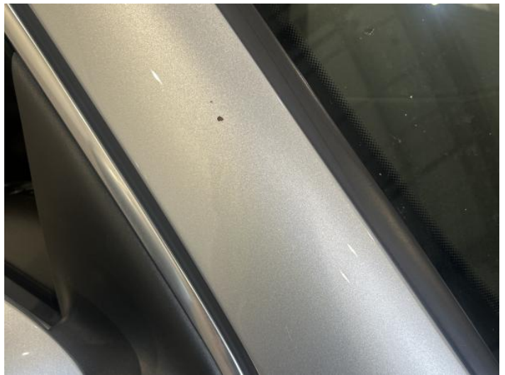
18: A Post os Chipped 1 To 5