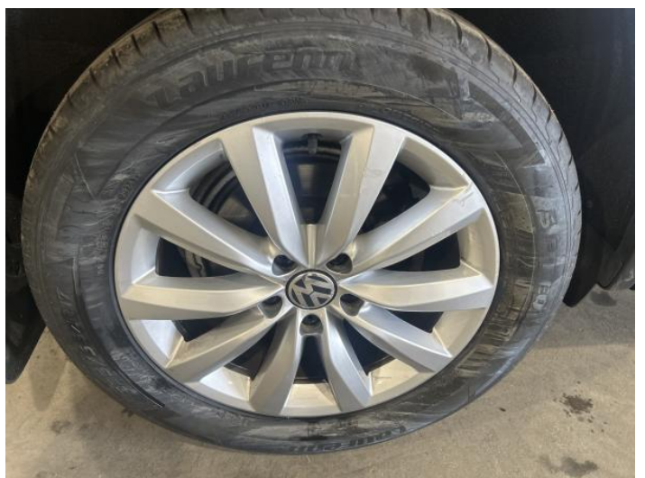
8: Wheel osr Scratched Over 50mm