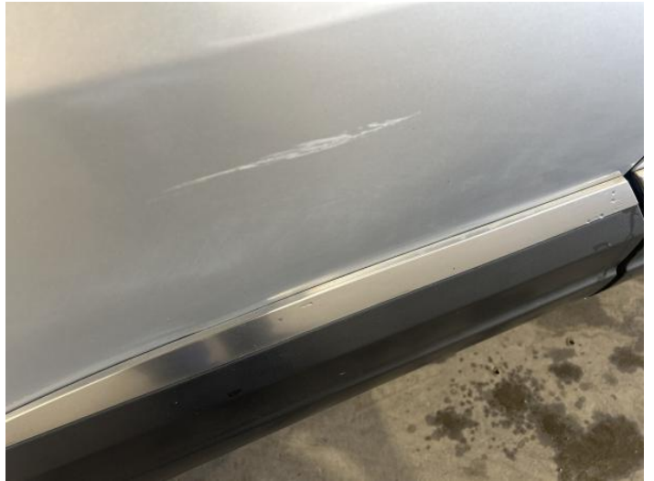
4: Door osr Scratched Over 25mm Thru Paint