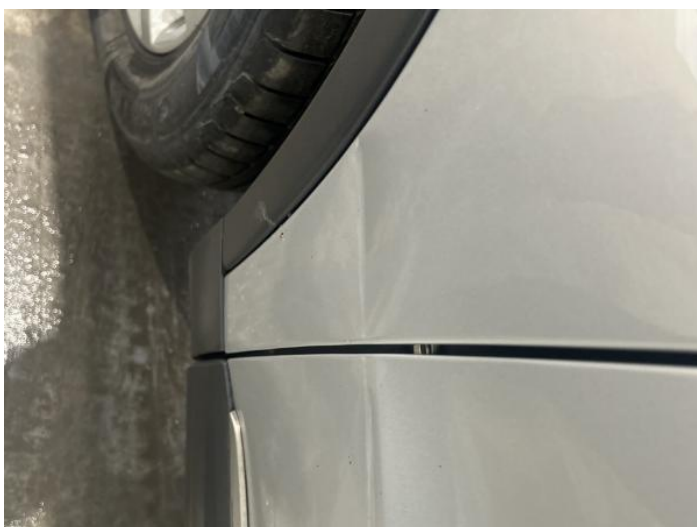
13: Wing nsf Dented Over 30mm