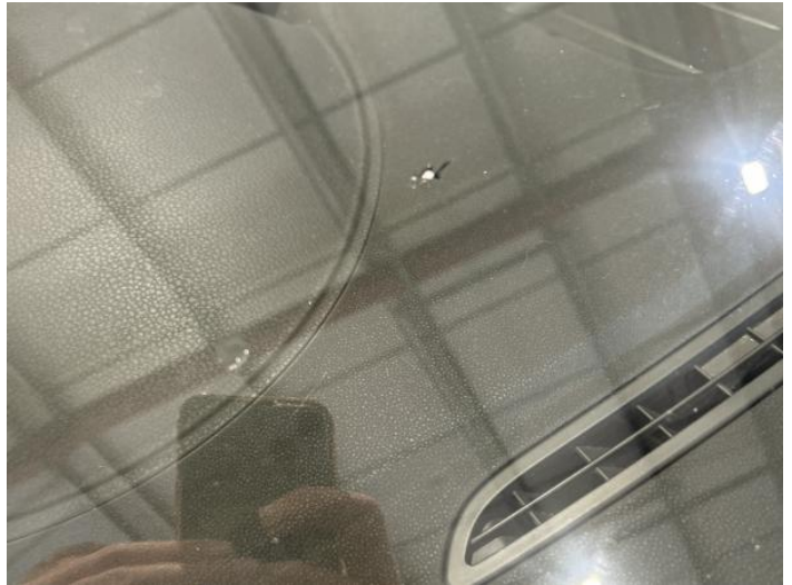
16: Screen Front Chipped UpTo 10mm