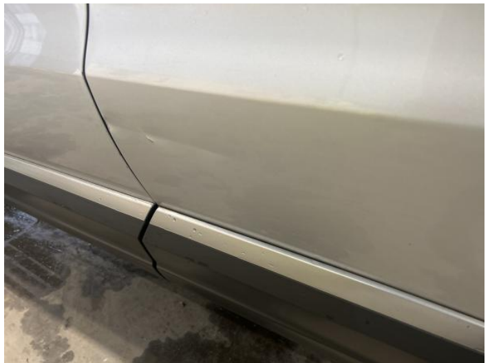
10: Door nsr Dented With Paint Damage