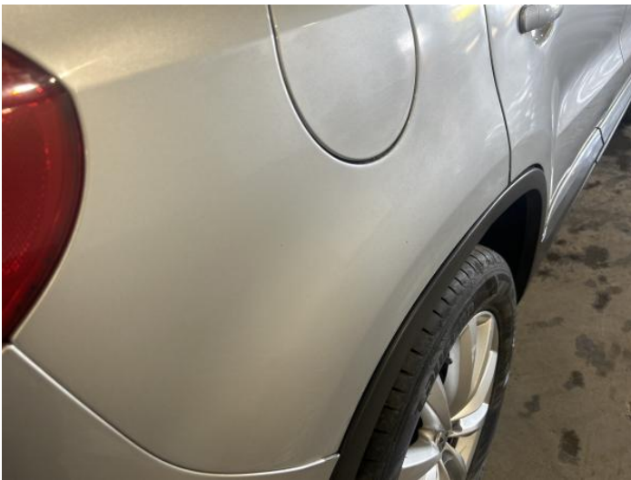
5: Qtr Panel osr Poor Previous Repair Poor Paint