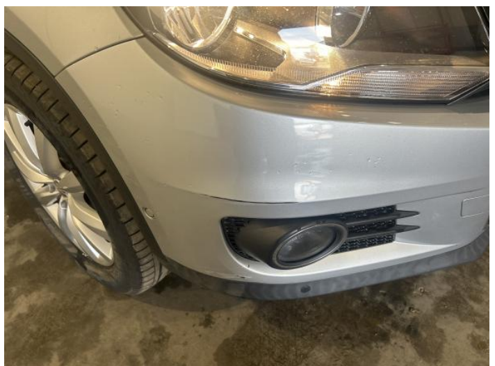
14: Bumper Front Scratched Over 100mm Thru Paint