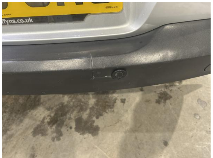
20: Bumper Rear Moulding Scuffed (Unpainted) UpTo 100mm