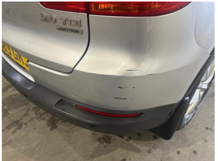
6: Bumper Rear Scratched Over 100mm Thru Paint