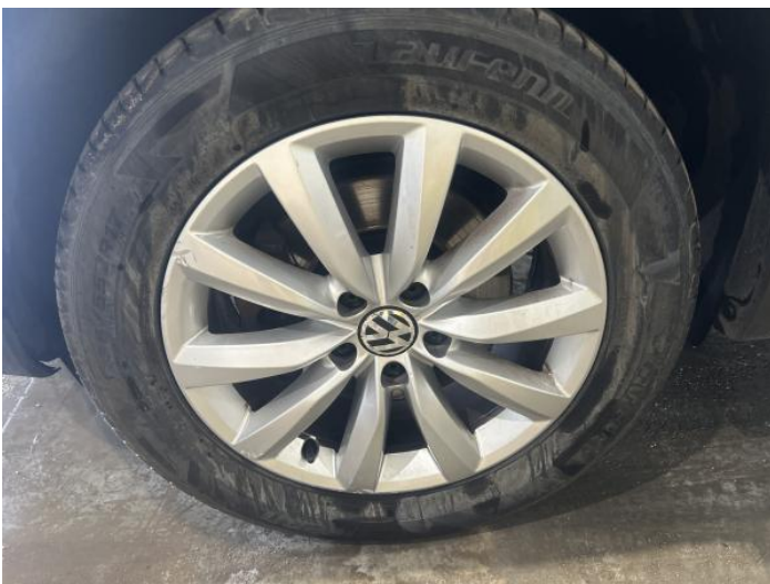
19: Wheel nsf Scratched Over 50mm