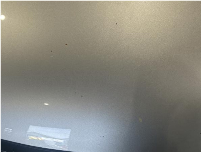
15: Bonnet Chipped 1 To 5