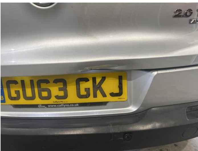
7: Tailgate Dented With Paint Damage