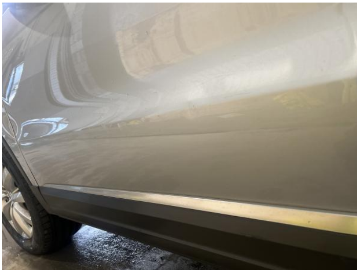
11: Door nsf Dented Over 30mm