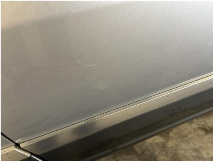
3: Door osf Scratched UpTo 25mm Thru Paint