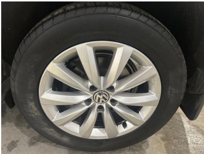
9: Wheel nsr Scratched Up To 50mm