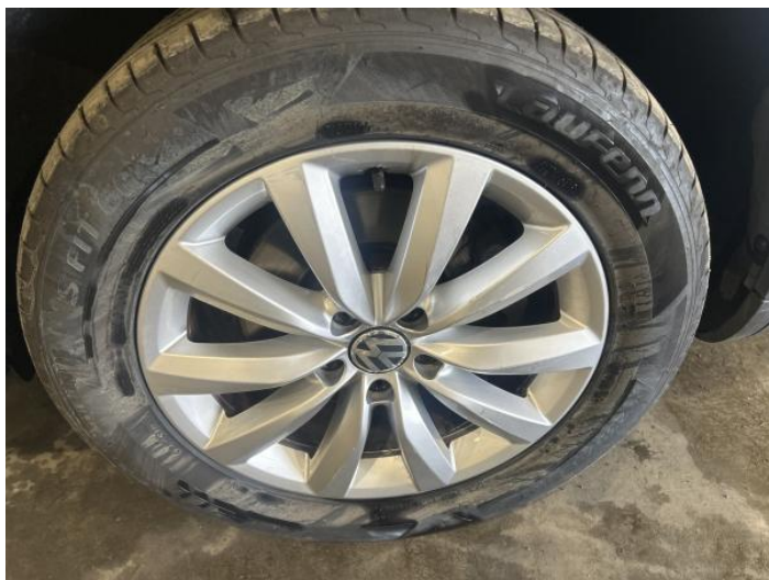
1: Wheel osf Scratched Up To 50mm