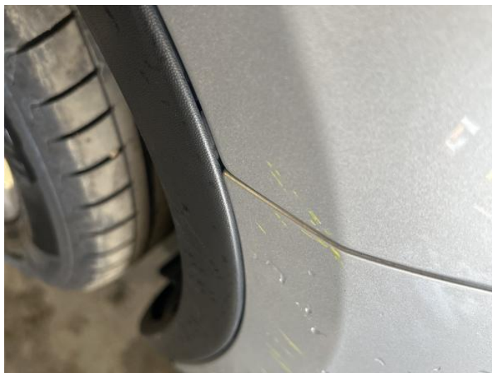
2: Wing osf Scratched UpTo 25mm Not Thru Paint