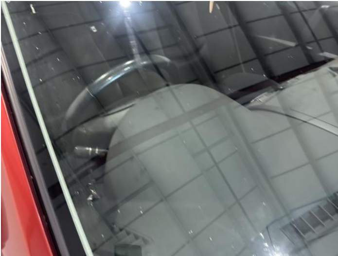
3: Screen Front Chipped UpTo 10mm