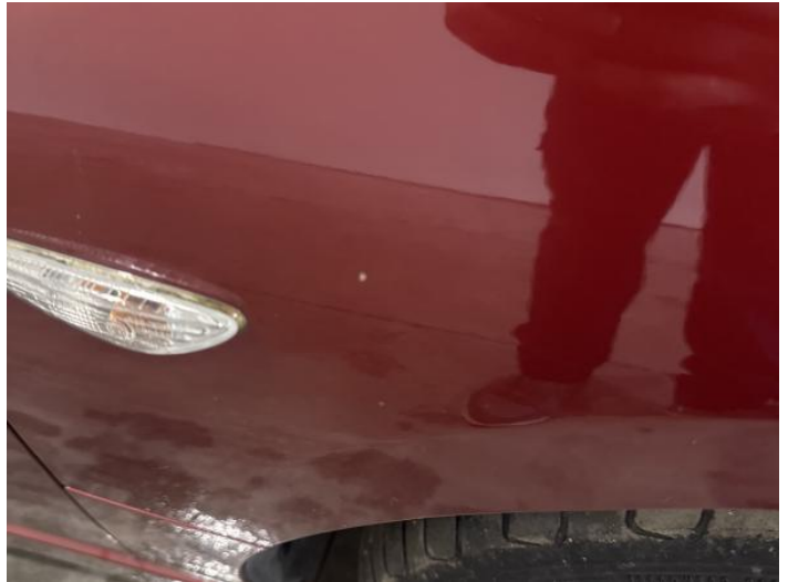
4: Wing osf Chipped 1 To 5