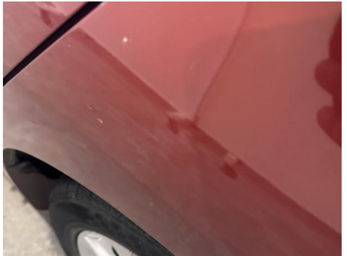
12: Qtr Panel nsr Chipped 1 To 5