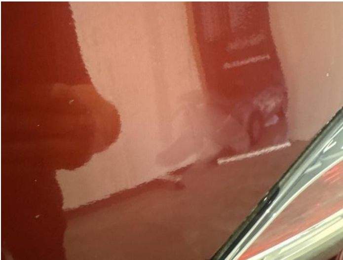
11: Boot Lid Chipped 1 To 5