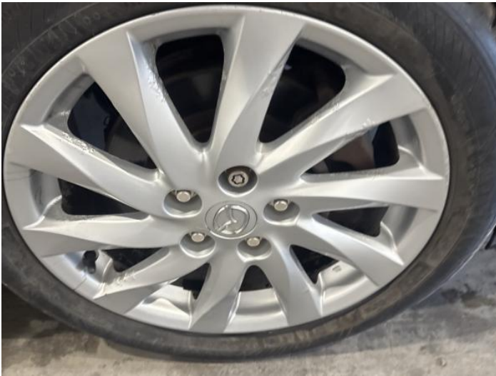
5: Wheel osf Corroded Light