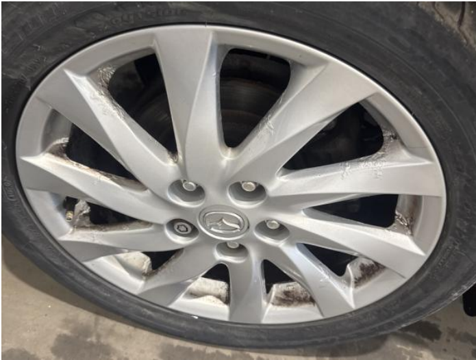
9: Wheel osr Corroded Light