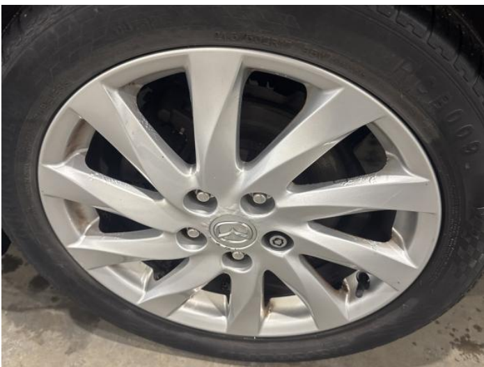
13: Wheel nsr Corroded Light