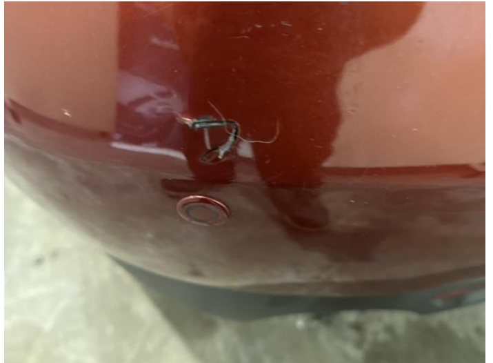
10: Bumper Rear Cracked UpTo 25mm