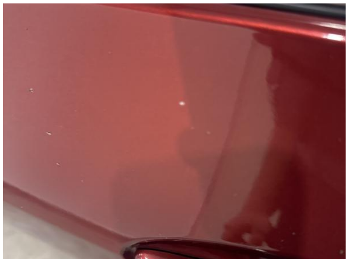
14: Door nsr Chipped 1 To 5