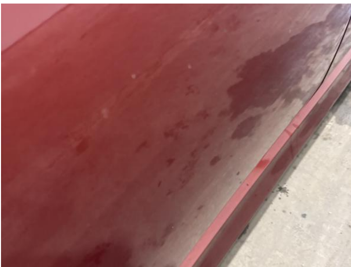
7: Door osr Chipped 1 To 5