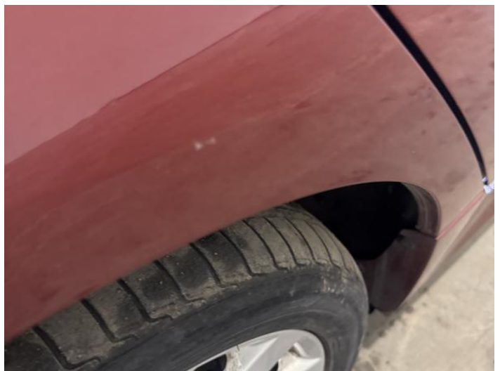
8: Qtr Panel osr Chipped 1 To 5