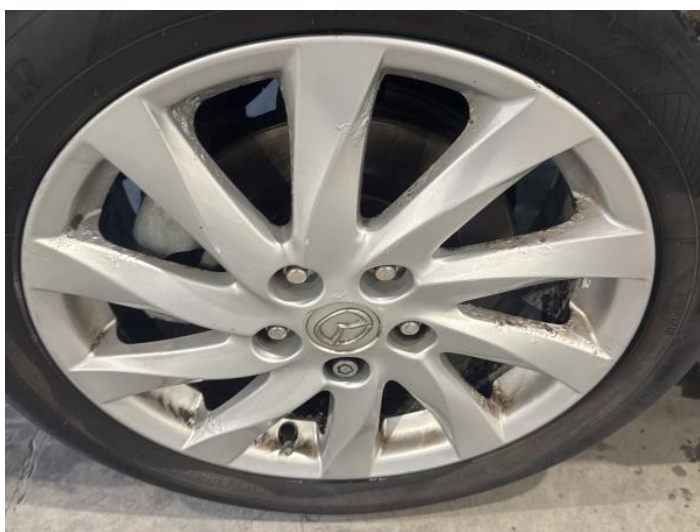
17: Wheel nsf Corroded Light