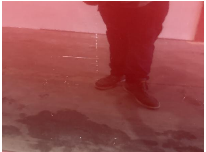
6: Door osf Scratched Over 25mm Thru Paint