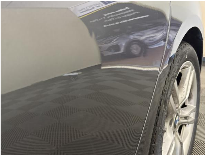
5: Door nsr Dented Over 30mm