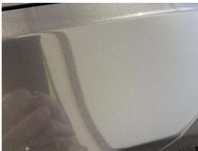
12: Wing osf Scratched Over 25mm Thru Paint