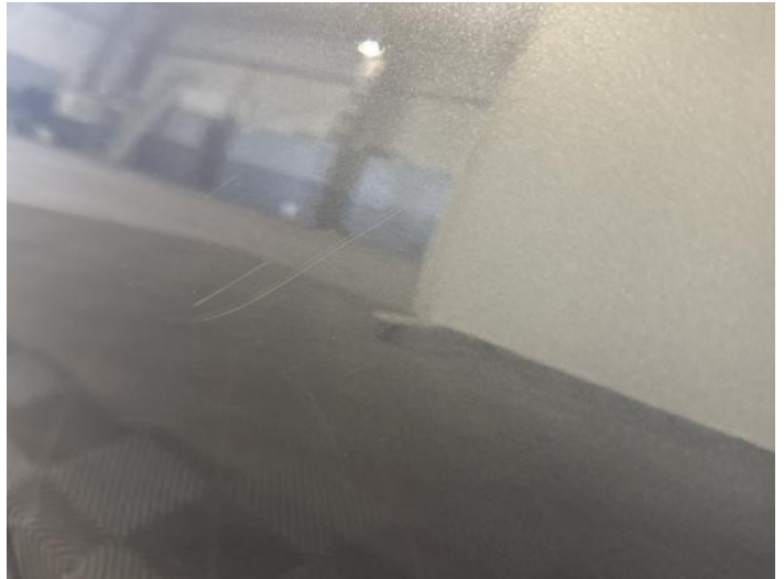
4: Door osf Scratched Over 25mm Thru Paint