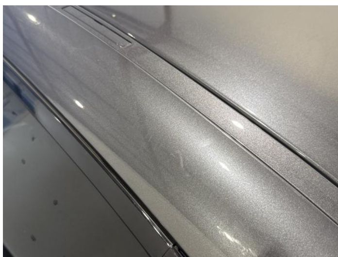
14: B Post ns Scratched UpTo 25mm Thru Paint