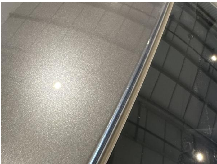
15: Roof Chipped Edge Chip