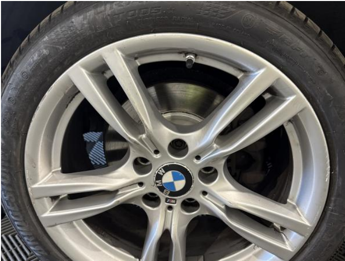
3: Wheel osf Scratched Over 50mm