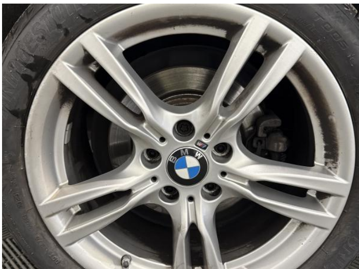
9: Wheel osr Scratched Up To 50mm