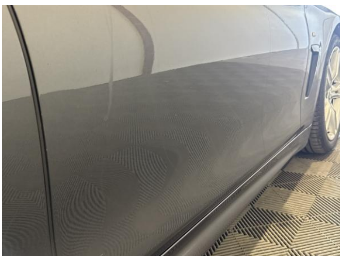
11: Door osf Dented With Paint Damage