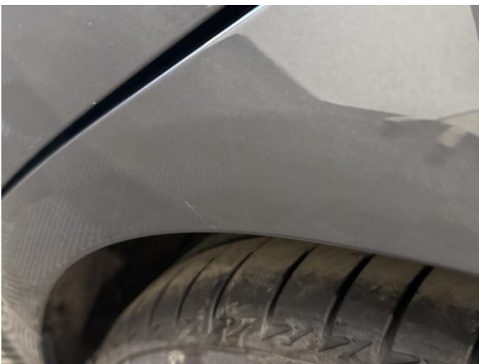
7: Qtr Panel nsr Scratched UpTo 25mm Thru Paint