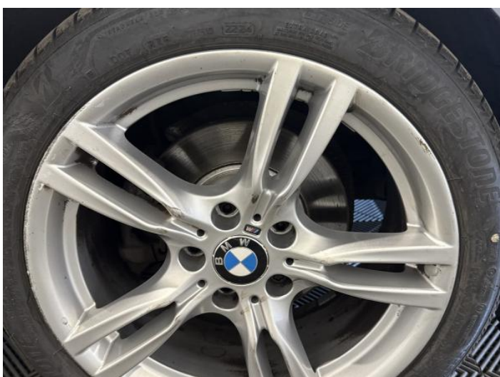
13: Wheel osf Scratched Over 50mm