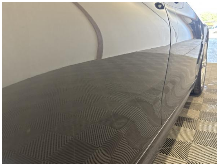
10: Door osr Dented Over 30mm