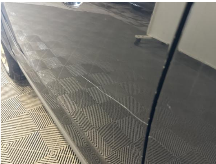
13: Door nsf Scratched Over 25mm Thru Paint