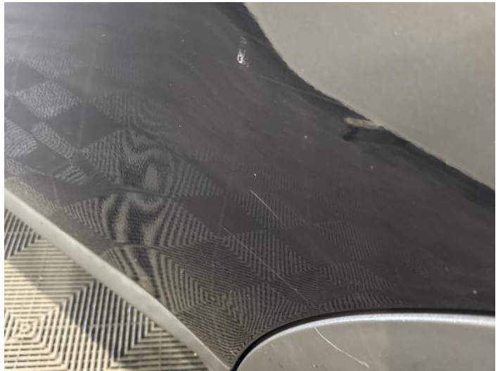
12: Door nsr Scratched Over 25mm Thru Paint