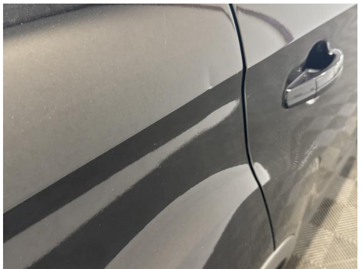
8: Qtr Panel osr Dented Over 30mm