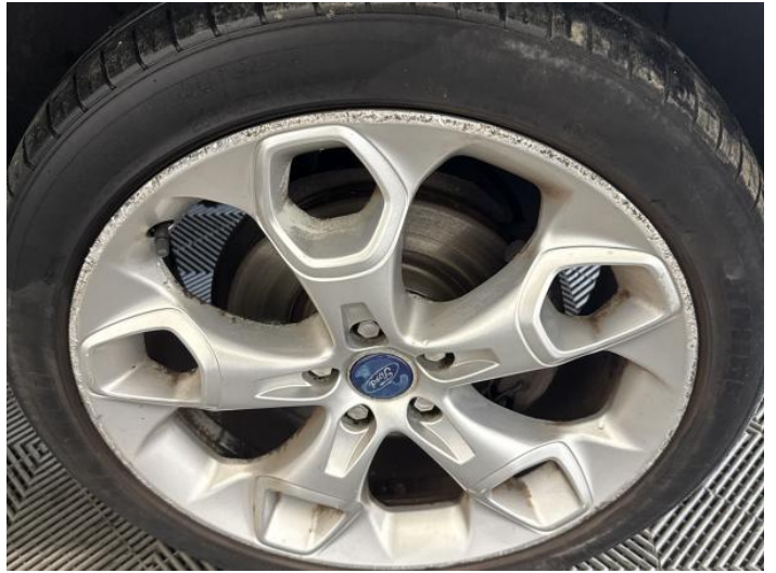
4: Wheel osf Scratched Over 50mm