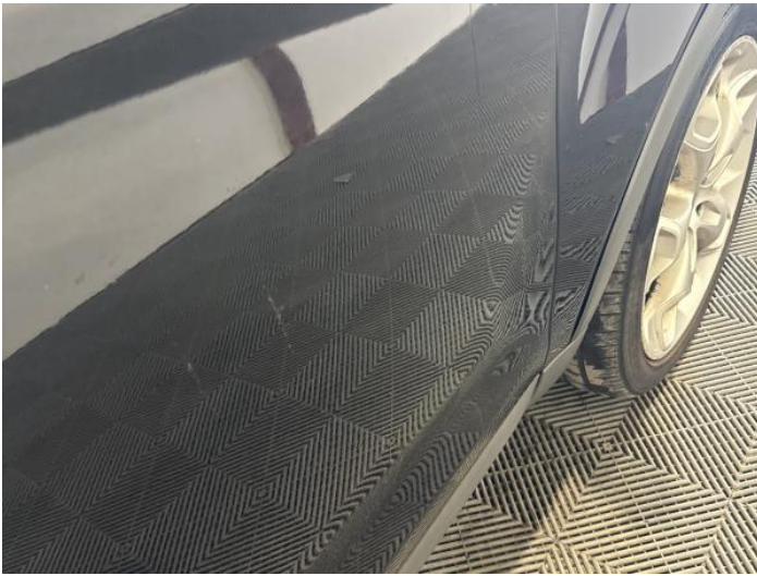
5: Door osf Scratched Over 25mm Thru Paint