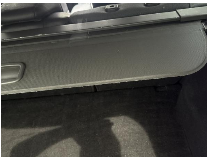
17: Headrest Assy Rear Seat os Missing Replace