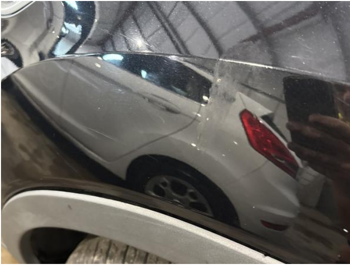
3: Wing osf Scratched Over 25mm Thru Paint