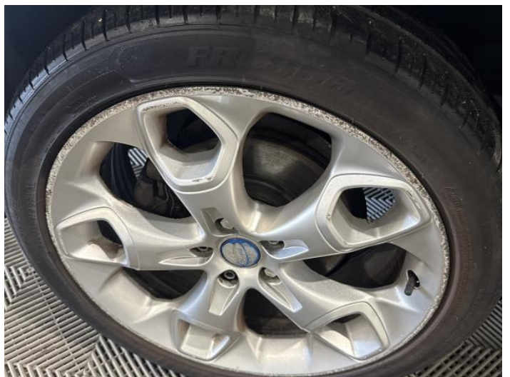
14: Wheel nsf Scratched Over 50mm