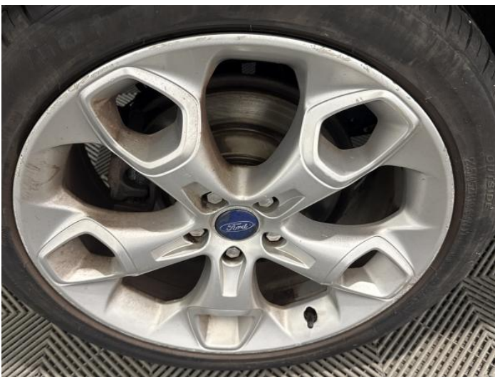
7: Wheel osr Scratched Over 50mm