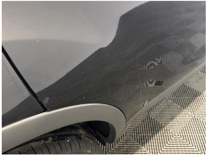
6: Door osr Scratched Over 25mm Thru Paint