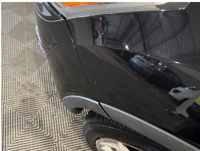
15: Wing nsf Scratched UpTo 25mm Thru Paint