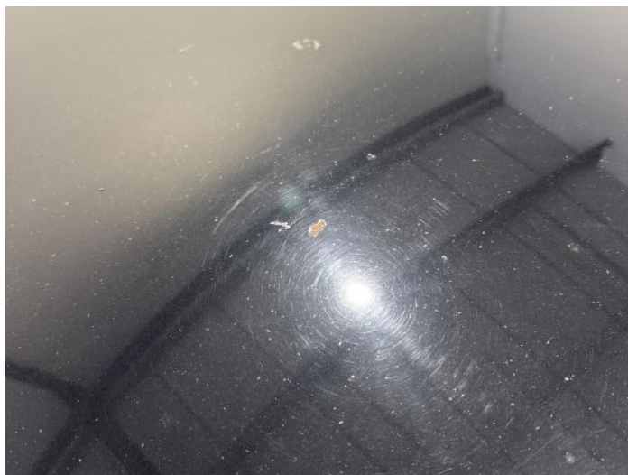
16: Roof Scratched Over 25mm Thru Paint