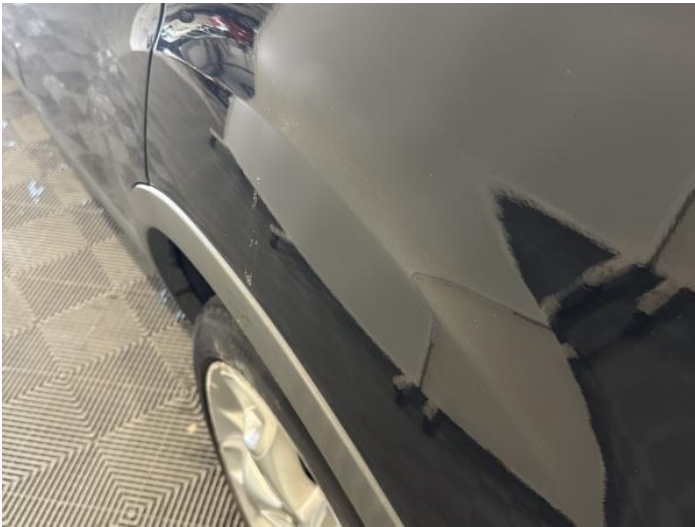
11: Qtr Panel nsr Scratched Over 25mm Thru Paint