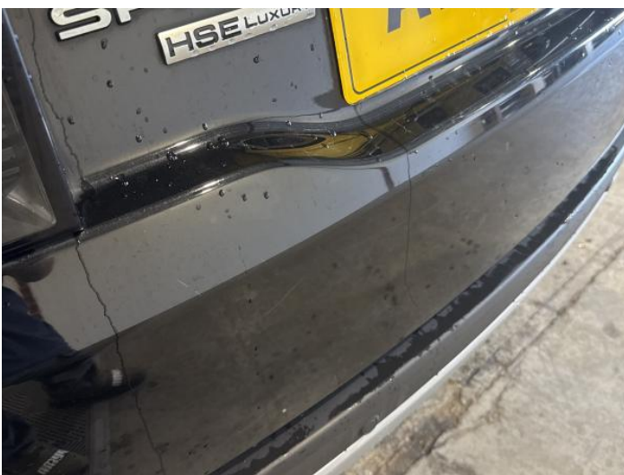
13: Tailgate Scratched Over 25mm Thru Paint