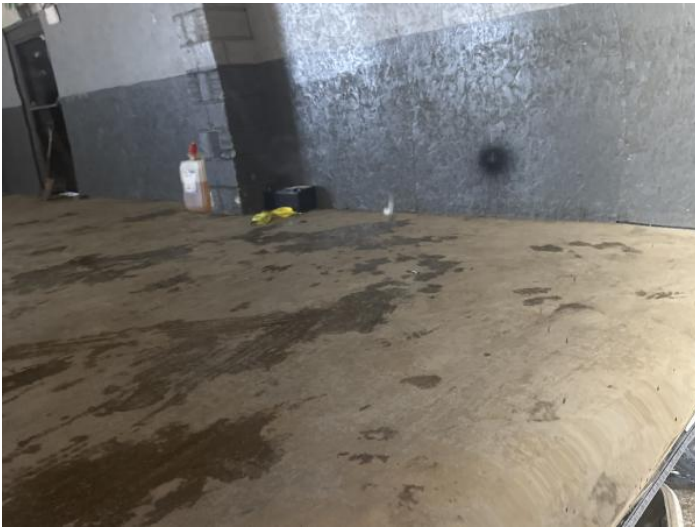
17: Door osf Scratched UpTo 25mm Thru Paint