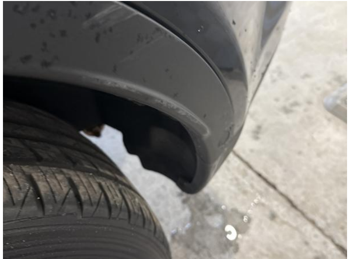
10: Qtr Panel Arch Extension ns Scuffed (Unpainted) Over 100mm