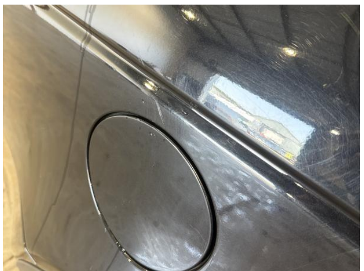
14: Qtr Panel osr Scratched Over 25mm Thru Paint