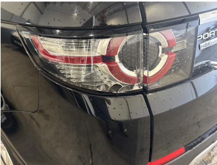
11: Lamp nsr Broken Replace