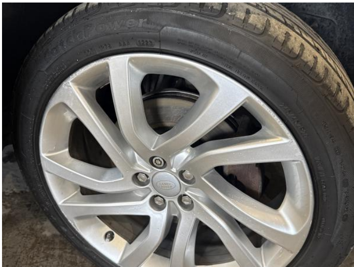
21: Wheel of Scratched Over 50mm