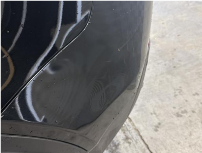
9: Bumper Rear Scratched Over 100mm Thru Paint