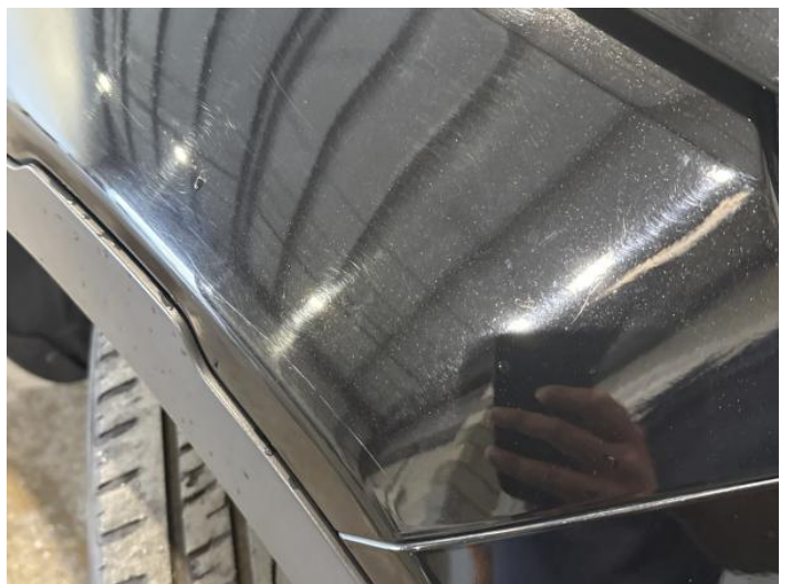
20: Wing osf Scratched Over 25mm Thru Paint