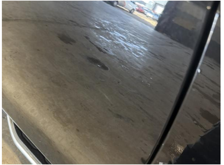
16: Door osr Scratched UpTo 25mm Thru Paint