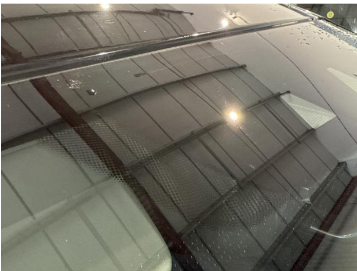
19: Roof Dented Over 30mm