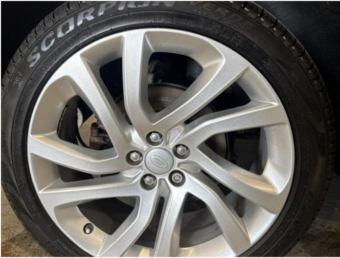
15: Wheel osr Scratched Up To 50mm