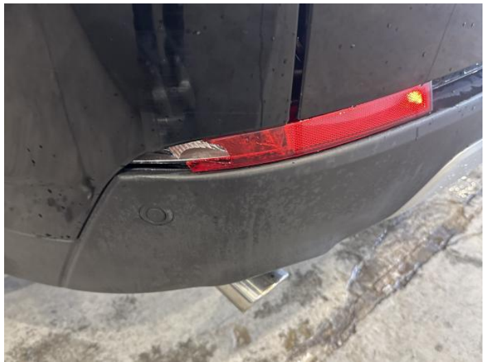
12: Bumper Reflector nsr Broken Replace