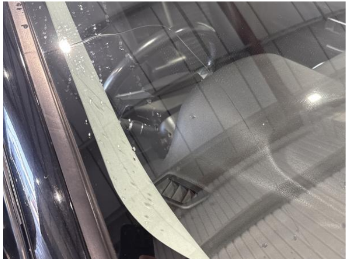
18: Screen Front Cracked Replace