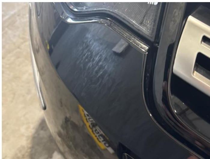
2: Bumper Front Scratched 25 to 100mm Thru Paint