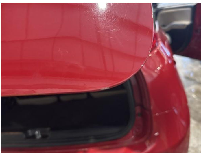
13: Tailgate Chipped Edge Chip