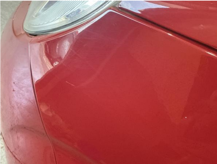
3: Wing nsf Chipped 1 To 5