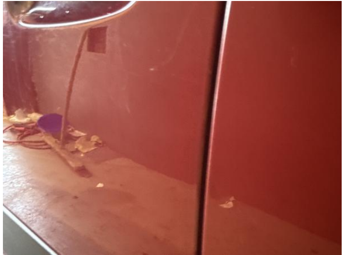
4: Door nsf Scratched Over 25mm Thru Paint