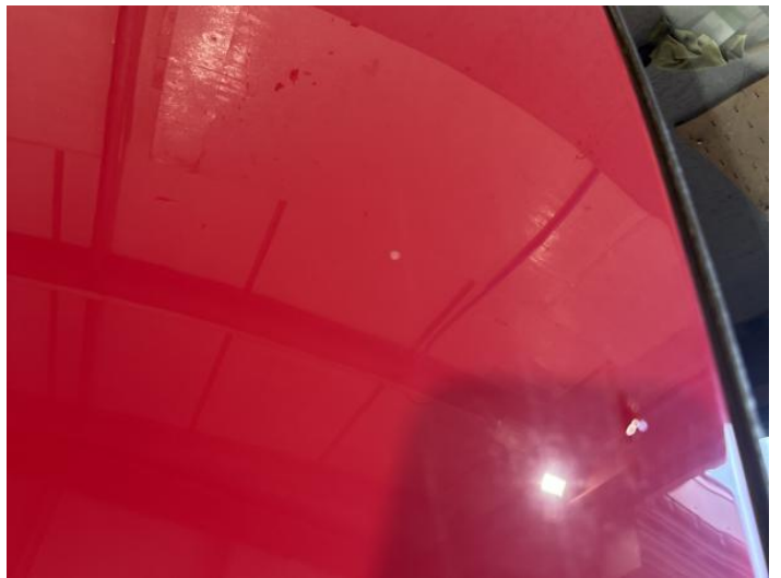
12: Roof Chipped 1 To 5