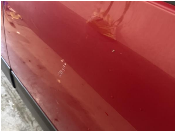
6: Door nsr Scratched Over 25mm Thru Paint