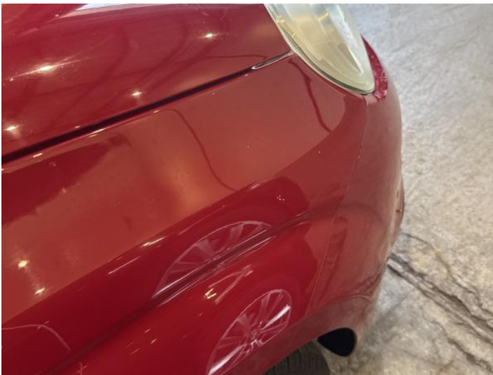
11: Wing osf Chipped Multiple Chips