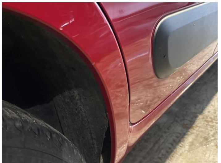
8: Qtr Panel osr Dented Between 10mm + 30mm