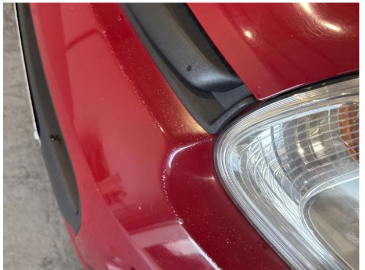
2: Bumper Front Poor Previous Repair Paint Flake