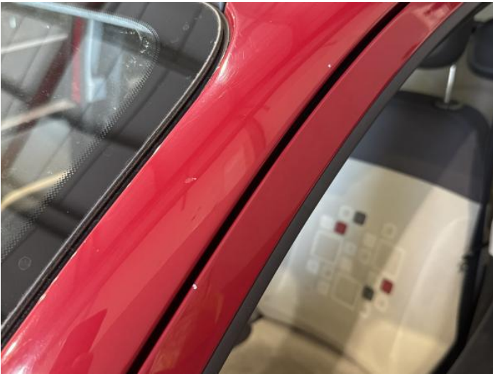
5: A Post ns Chipped 1 To 5