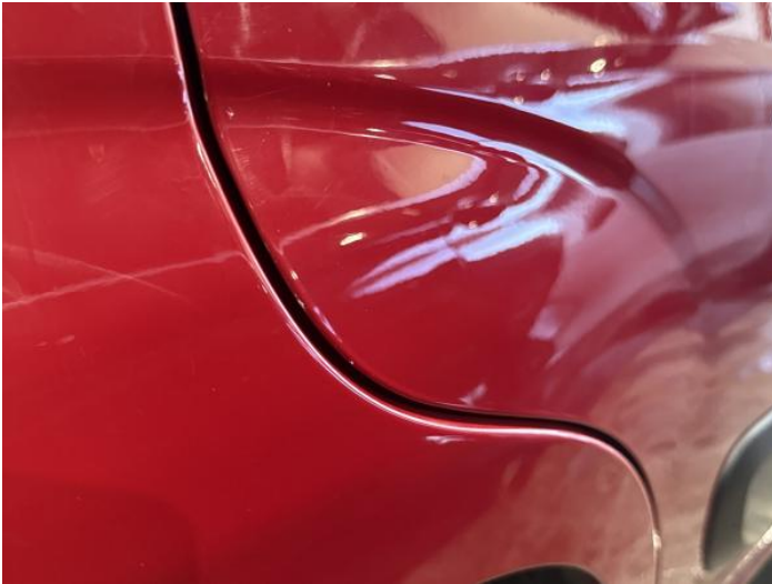
9: Door osr Dented Between 10mm + 30mm