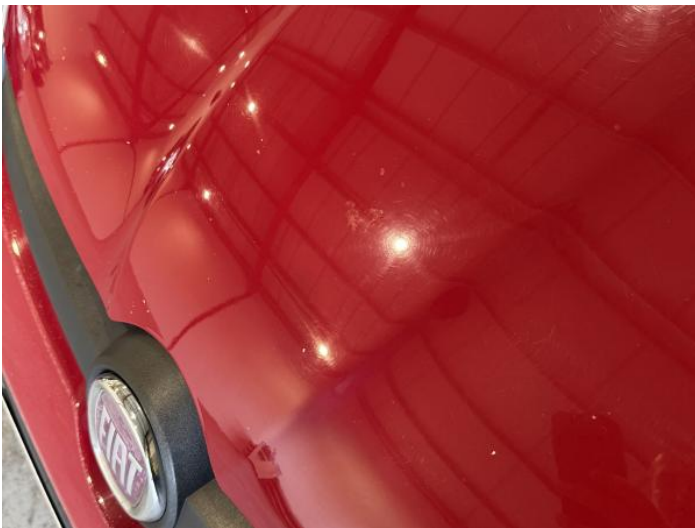
1: Bonnet Chipped Multiple Chips