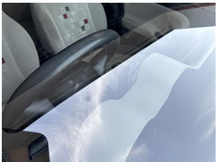
14: Screen Front Chipped UpTo 10mm