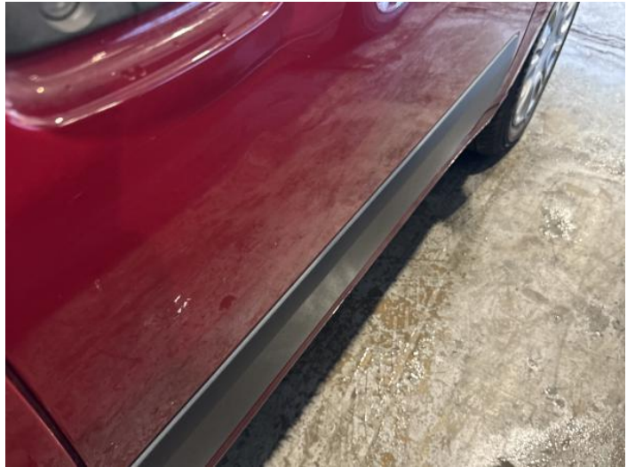
10: Door osf Dented Over 30mm