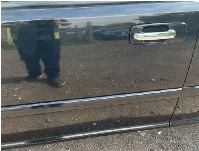
5: Door nsf Chipped 1 To 5