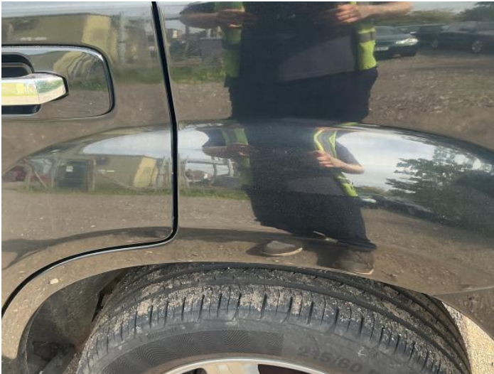
9: Qtr Panel nsr Dented With Paint Damage