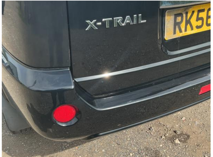
10: Bumper Rear Scratched Over 100mm Thru Paint