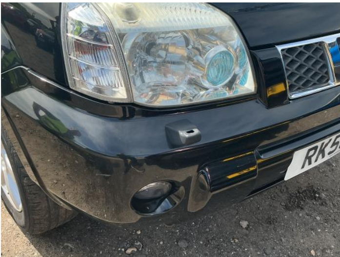
1: Bumper Front Scratched Over 100mm Thru Paint