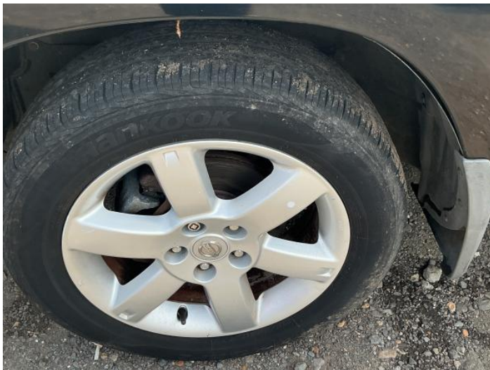
3: Wheel nsf Scratched Over 50mm