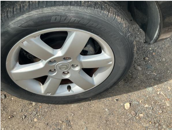
17: Wheel osf Scratched Over 50mm