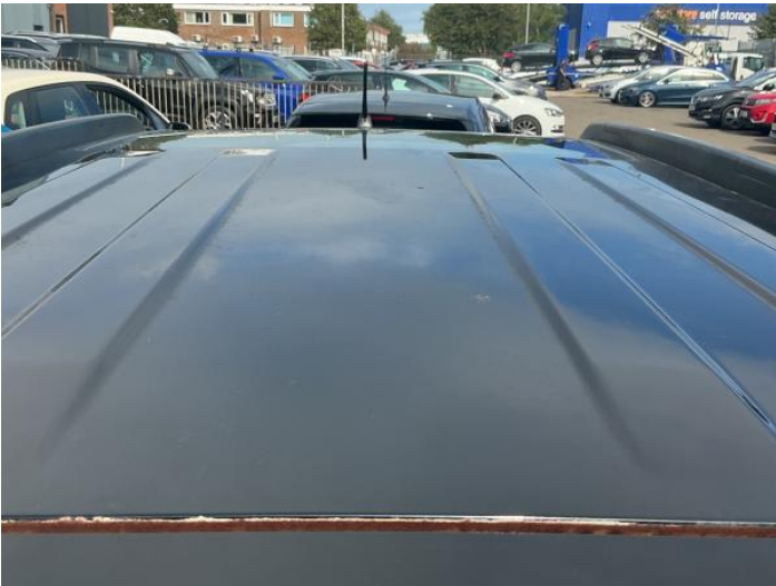
18: Roof Chipped Edge Chip

Carpet Condition Average Seat Condition Average