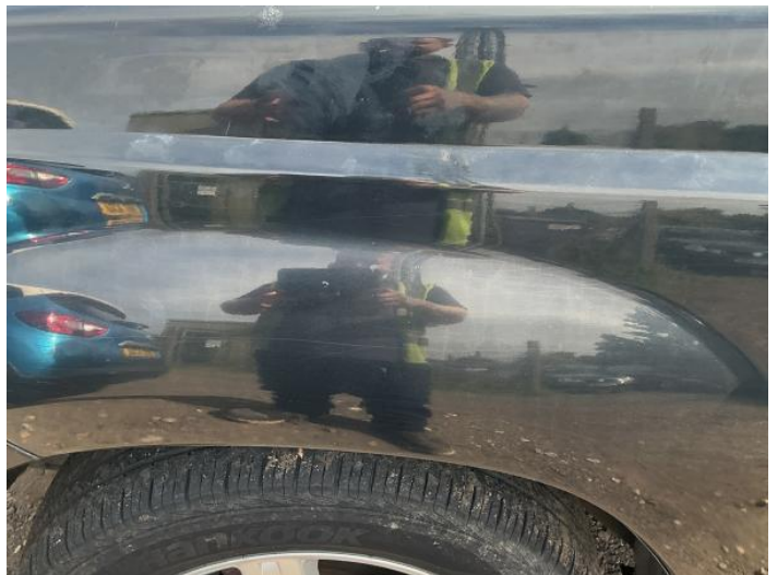
4: Wing nsf Poor Previous Repair Poor Paint