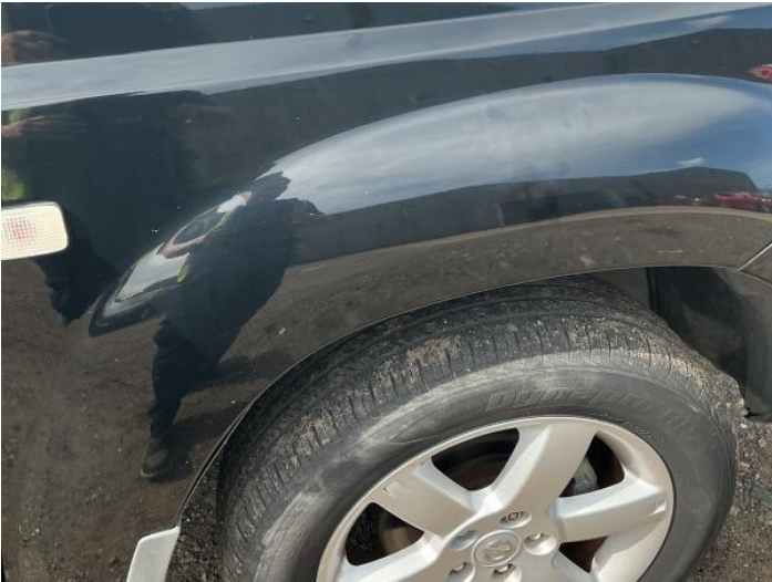
16: Wing osf Chipped 1 To 5