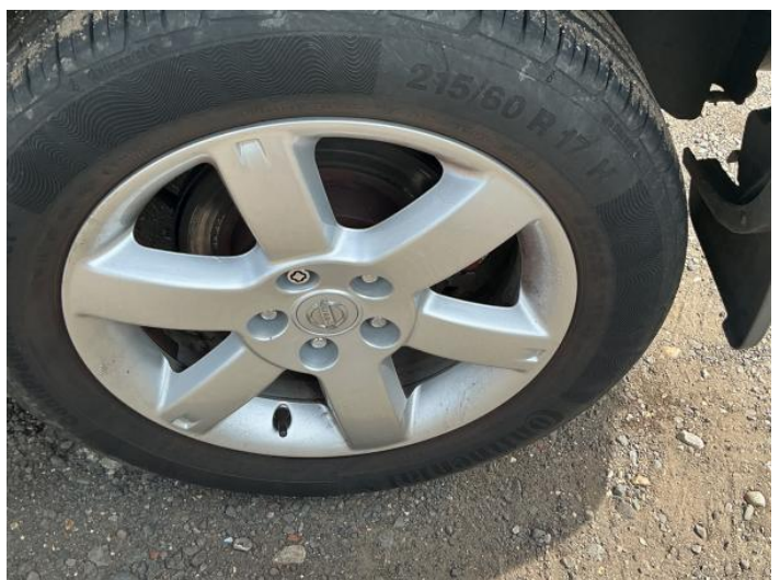
8: Wheel nsr Scratched Over 50mm