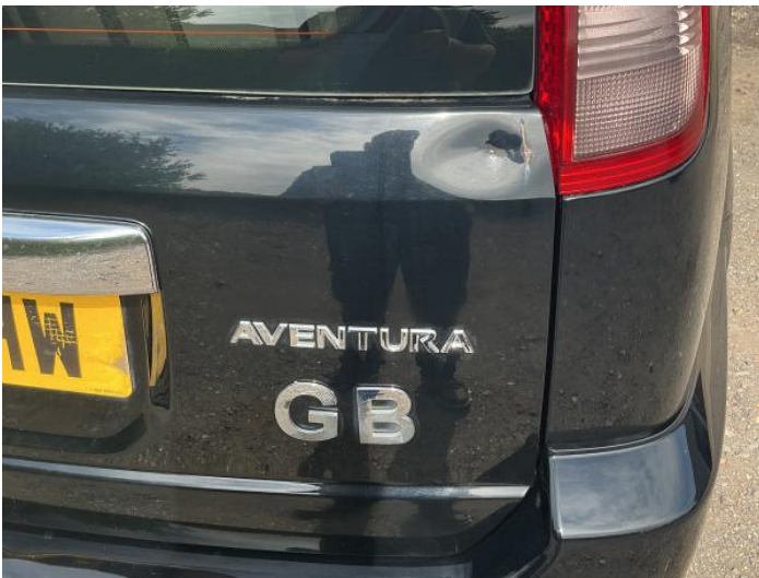
11: Boot Lid Dented With Paint Damage