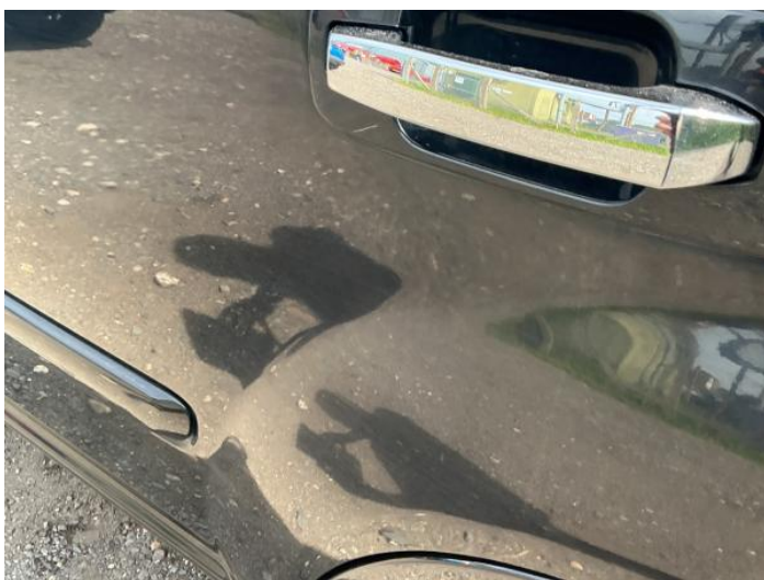
7: Door nsr Dented With Paint Damage