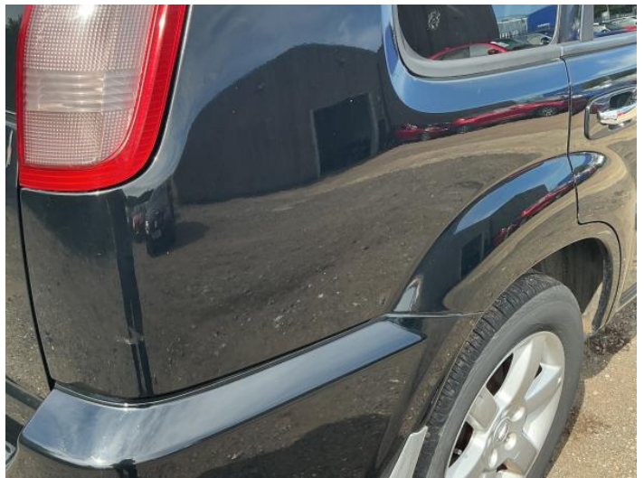
12: Qtr Panel osr Poor Previous Repair Poor Paint