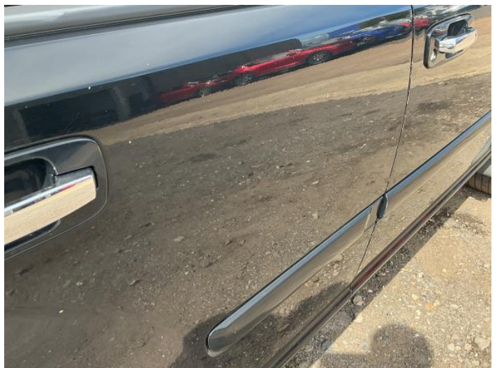
14: Door osr Chipped Multiple Chips