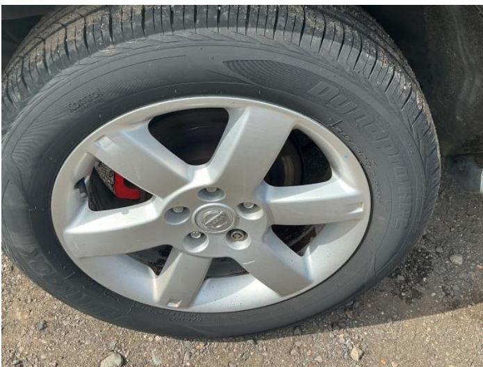
13: Wheel osr Scratched Over 50mm