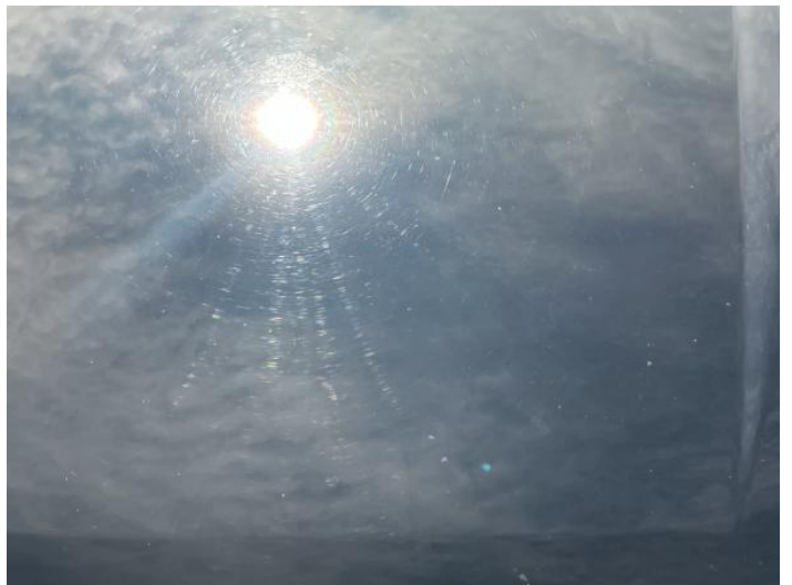
2: Bonnet Chipped Multiple Chips