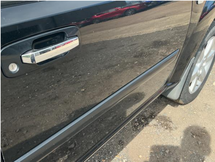
15: Door osf Dented With Paint Damage