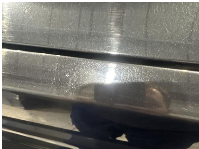
16: Wing nsf Chipped 1 To 5