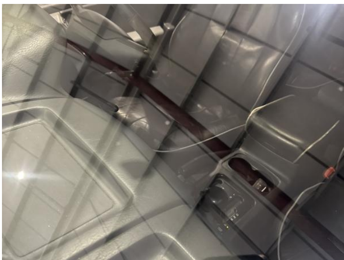
17: Screen Front Chipped UpTo 10mm