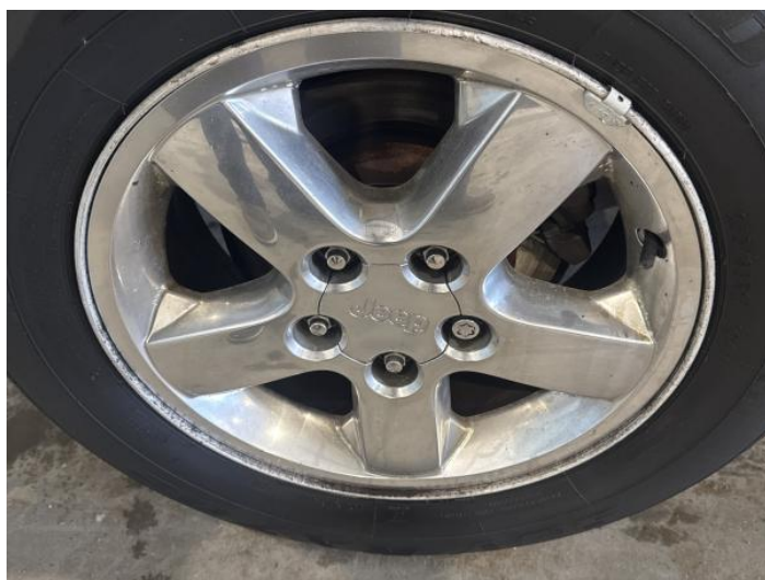
20: Wheel osr Scratched Over 50mm