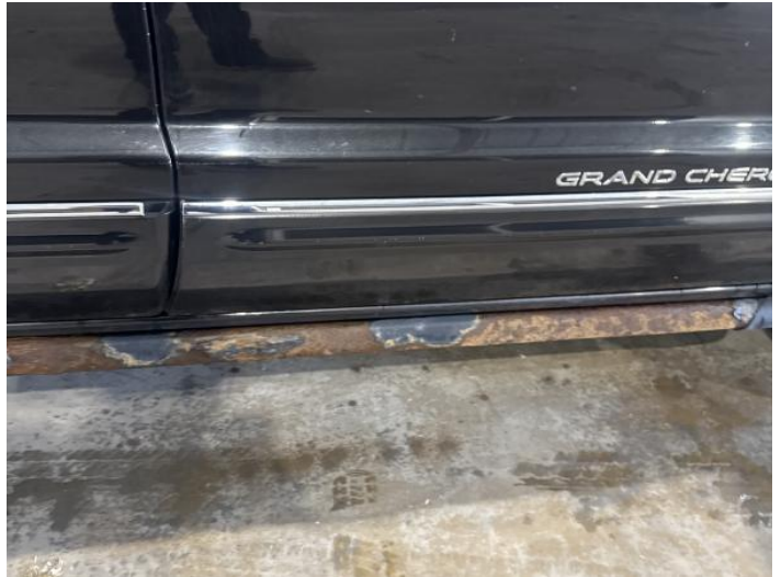
4: Sill os Rusted Over 5mm