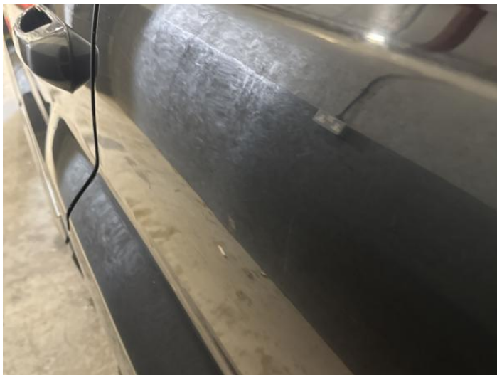
11: Qtr Panel nsr Dented Over 30mm