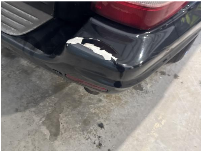
9: Bumper Rear Poor Previous Repair Paint Flake