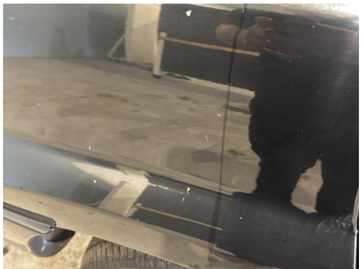
8: Qtr Panel osr Chipped Multiple Chips