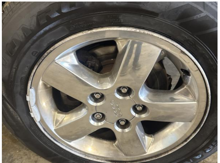
6: Wheel osf Scratched Over 50mm