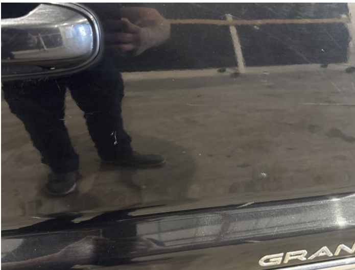
5: Door osf Chipped Multiple Chips