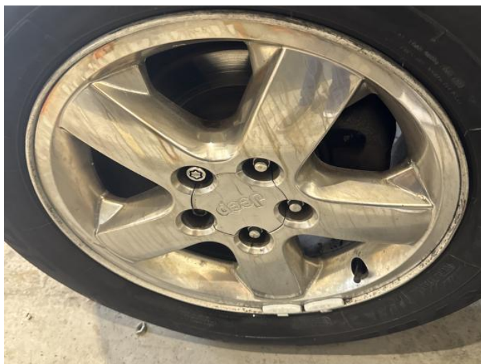
18: Wheel nsf Scratched Over 50mm