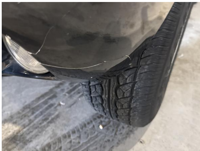
2: Bumper Front Cracked Over 25mm