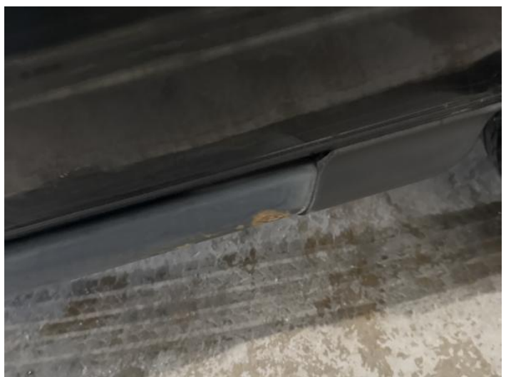
14: Sill ns Rusted Over 5mm