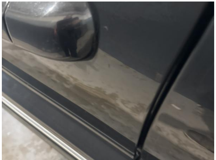
12: Door nsf Dented Over 2 UpTo 10mm