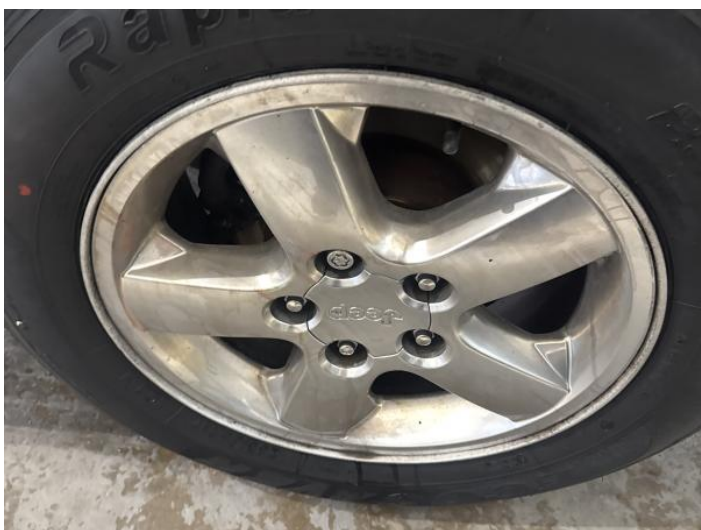
19: Wheel nsr Scratched Over 50mm