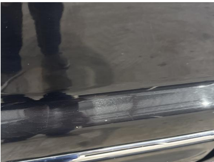
7: Door osr Chipped 1 To 5