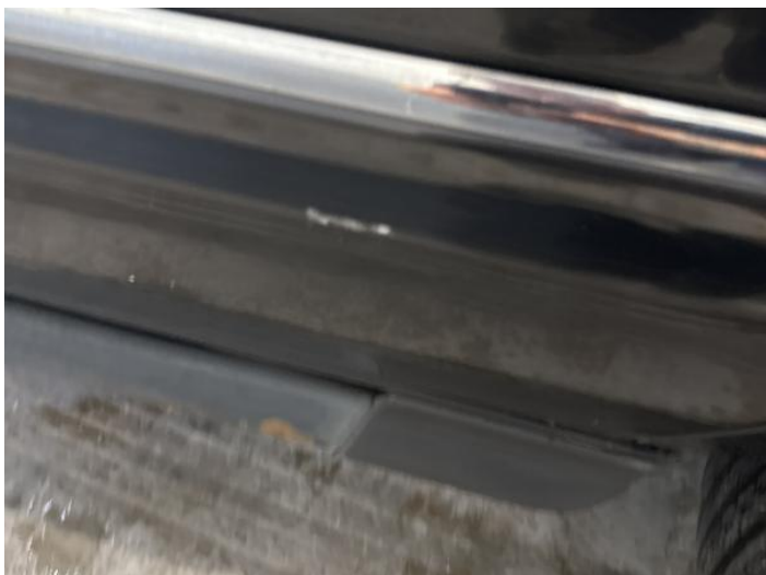
15: Door nsr Scratched UpTo 25mm Thru Paint