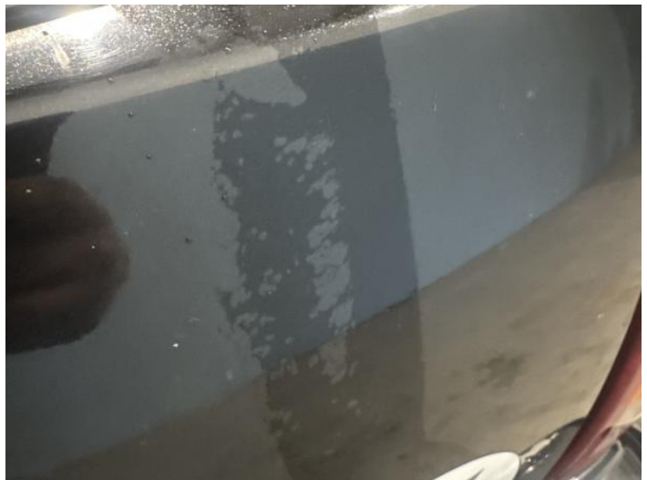
10: Boot Lid Chipped 1 To 5