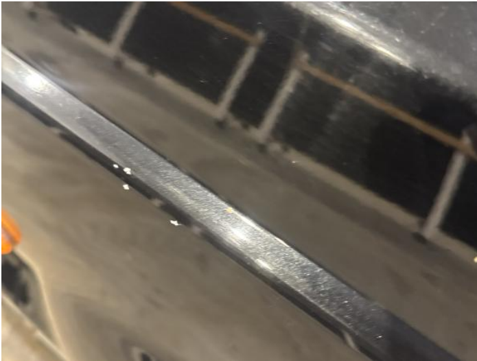
3: Wing osf Chipped Multiple Chips