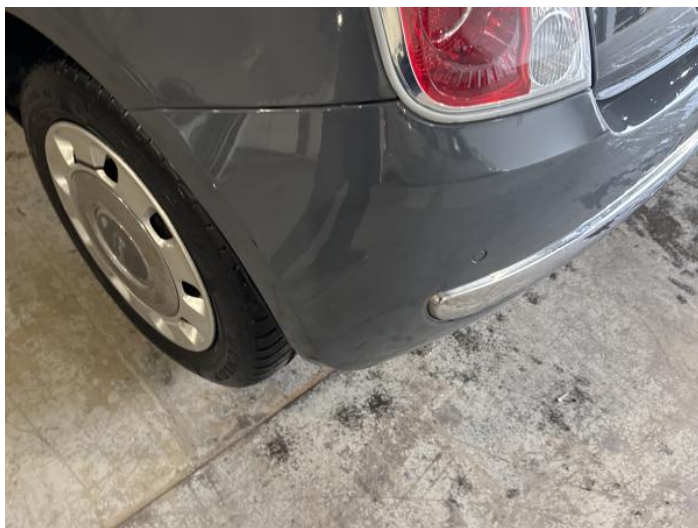
1: Bumper Rear Scratched Up To 25mm Thru Paint