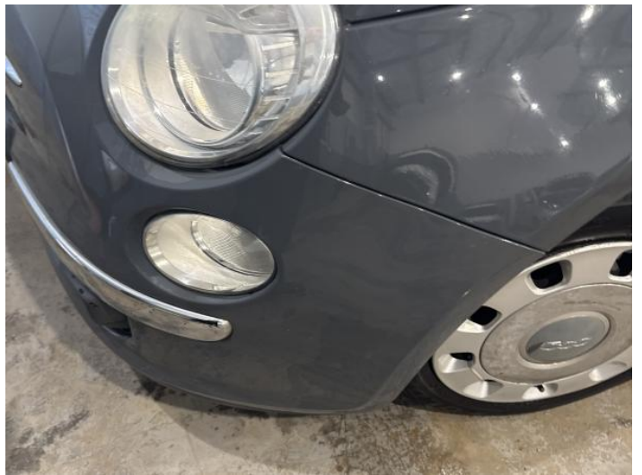
12: Bumper Front Scratched UpTo 25mm Thru Paint