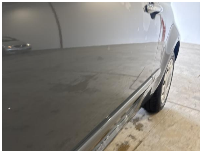
14: Door nsf Dented Over 2 UpTo 10mm