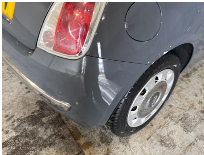
2: Bumper Rear Scratched 25 to 100mm Thru Paint