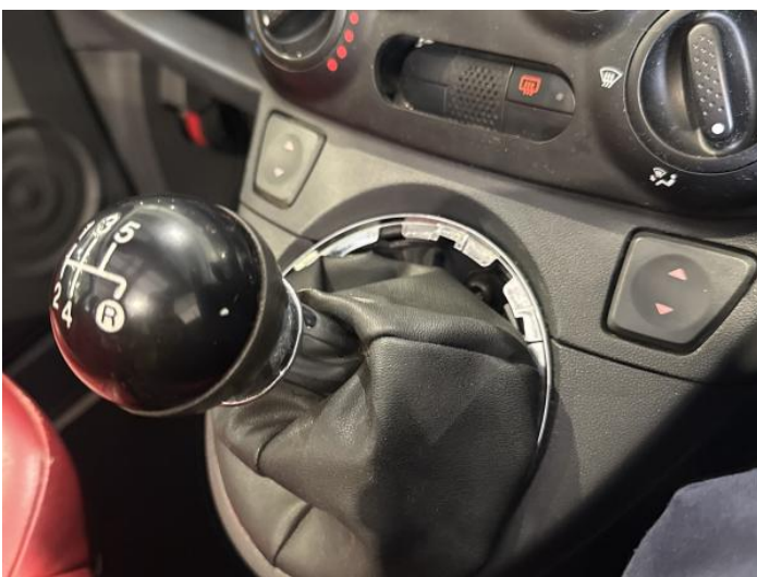
19: Other N/A N/A