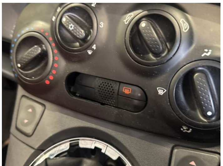
20: Switches And Controls Broken Replace