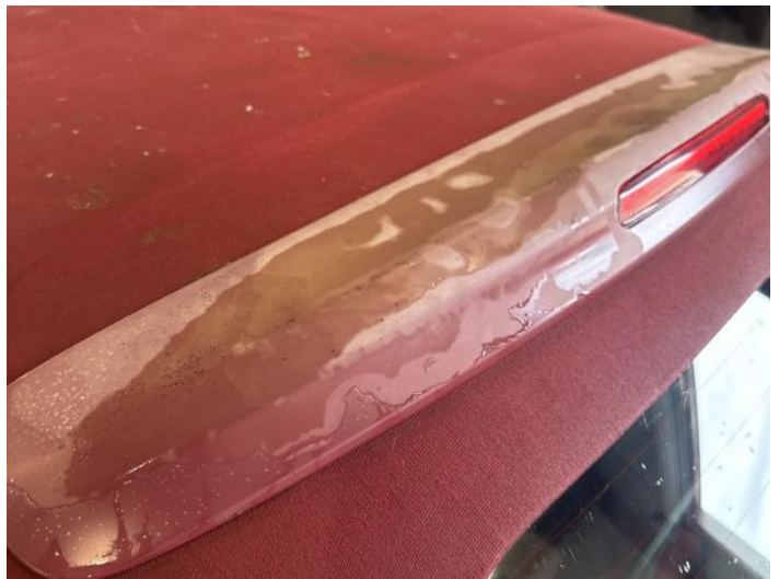
18: Other N/A N/A