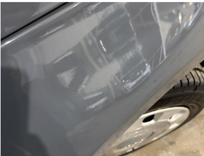
13: Wing nsf Chipped 1 To 5