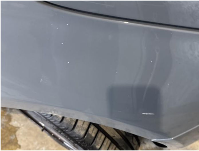
9: Wing osf Dented With Paint Damage