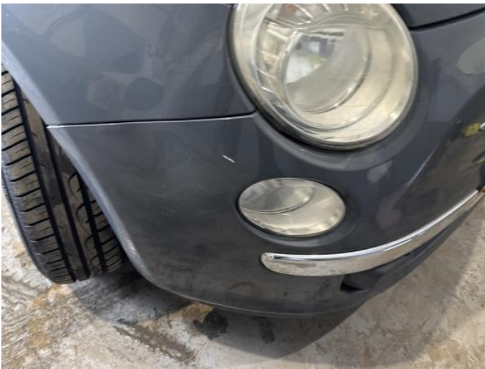
11: Bumper Front Scratched 25 to 100mm Thru Paint