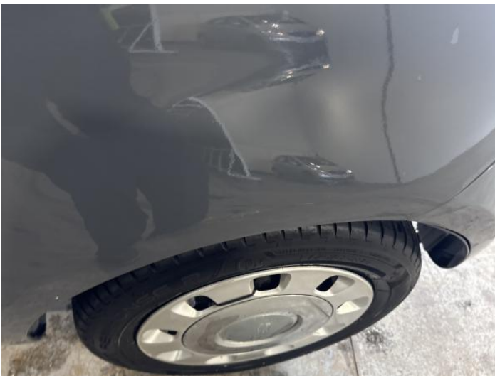
17: Qtr Panel nsr Dented With Paint Damage