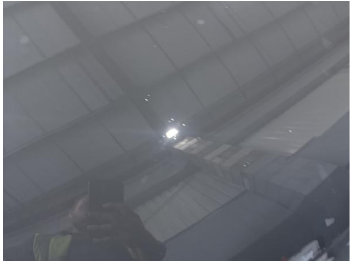
10: Bonnet Chipped Multiple Chips