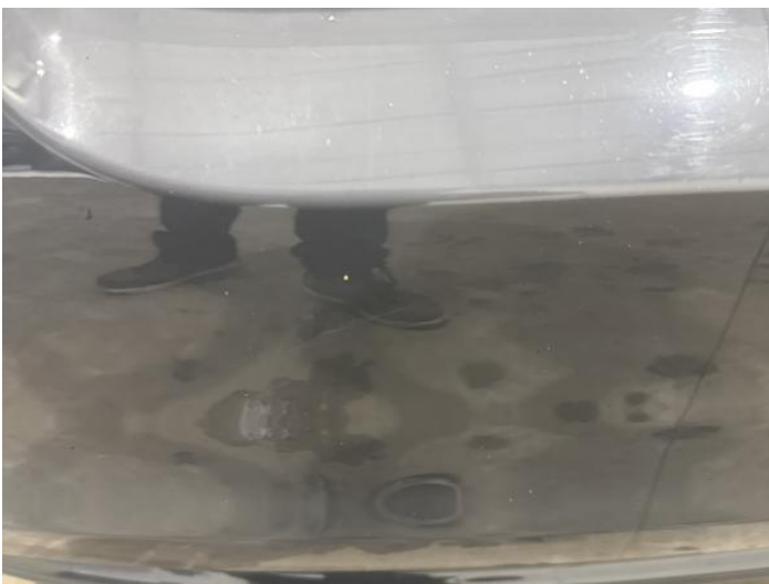
7: Bumper Rear Chipped 1 To 5