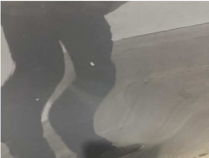
5: Qtr Panel osr Chipped 1 To 5