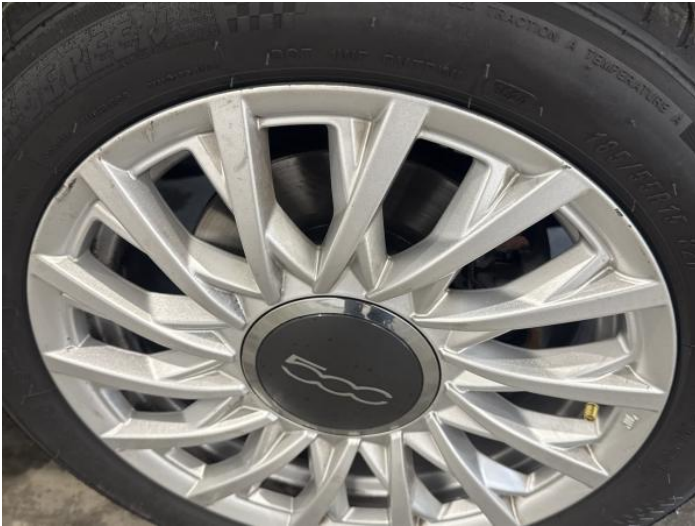
3: Wheel osf Scratched Up To 50mm