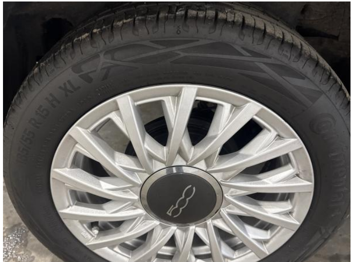
6: Wheel osr Scratched Up To 50mm