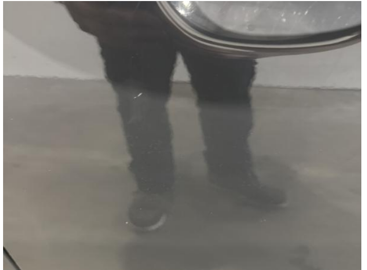
4: Door osf Chipped 1 To 5