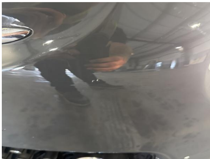
2: Bumper Front Chipped 1 To 5