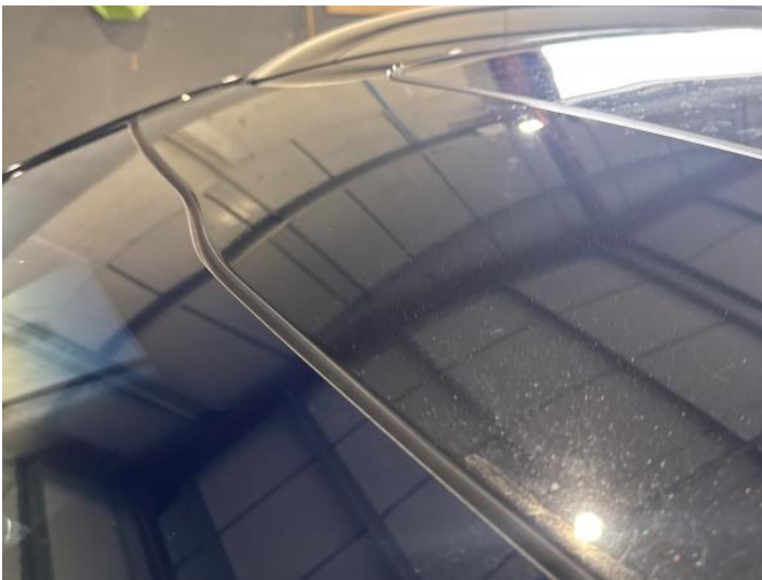
23: Roof Dented Between 10mm + 30mm