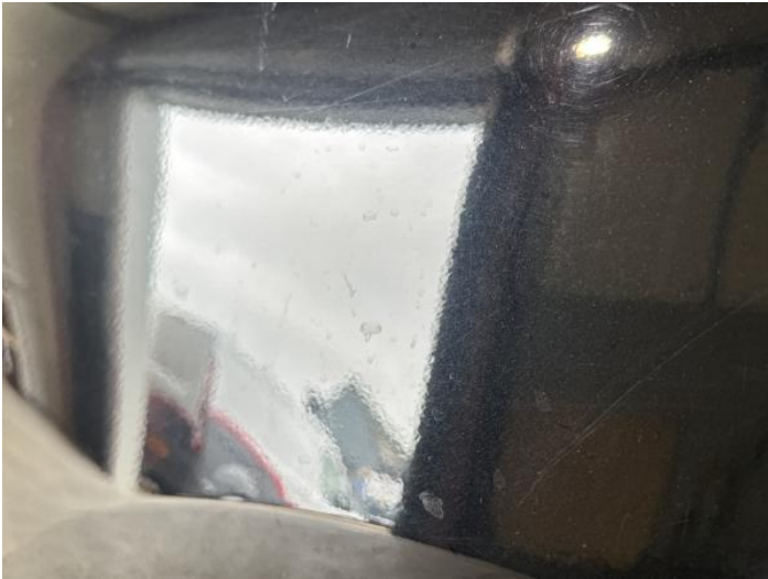
9: Qtr Panel osr Chipped 1 To 5