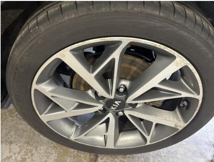
17: Wheel nsr Scratched Over 50mm