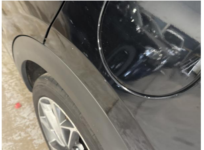
16: Qtr Panel nsr Dented With Paint Damage