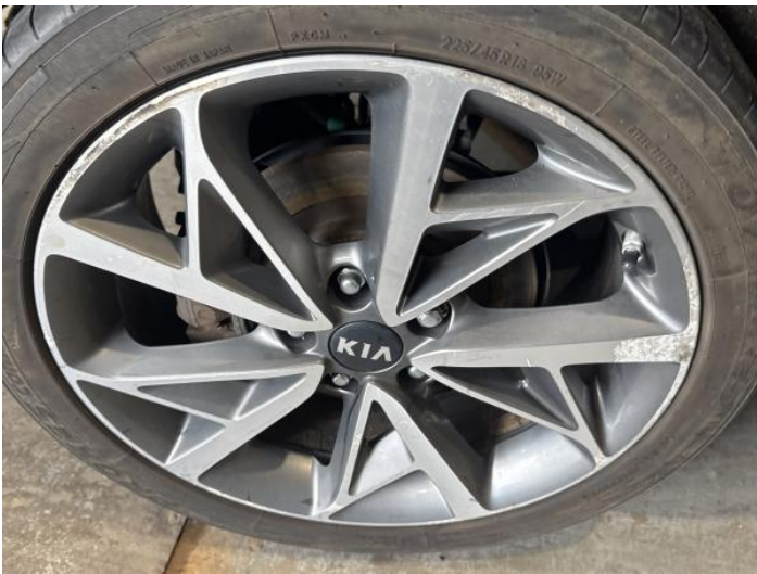
11: Wheel osr Scratched Over 50mm