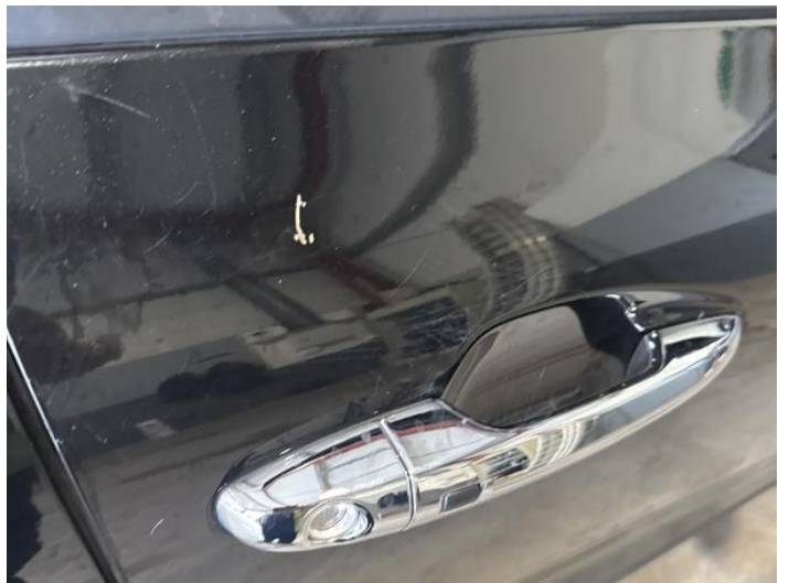
6: Door osf Scratched Over 25mm Thru Paint