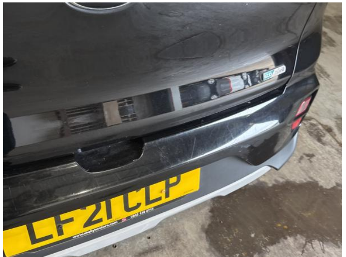
12: Bumper Rear Scratched 25 to 100mm Thru Paint