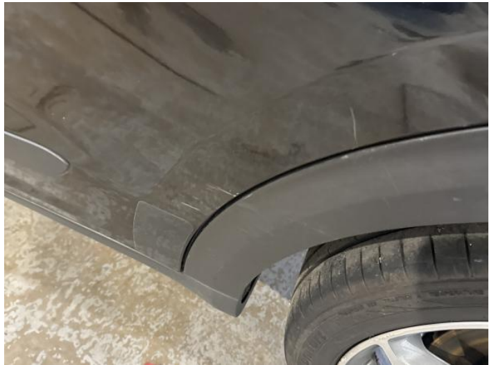
18: Door nsr Scratched Over 25mm Thru Paint