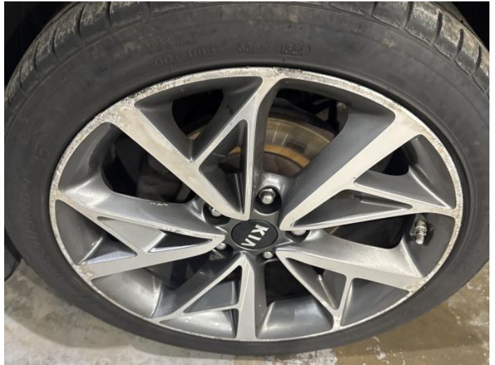
22: Wheel nsf Scratched Over 50mm