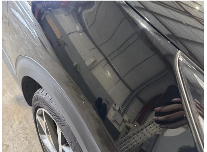
4: Wing osf Chipped 1 To 5