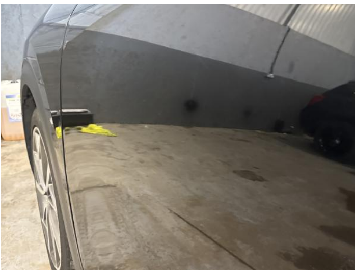
19: Door nsf Chipped 1 To 5