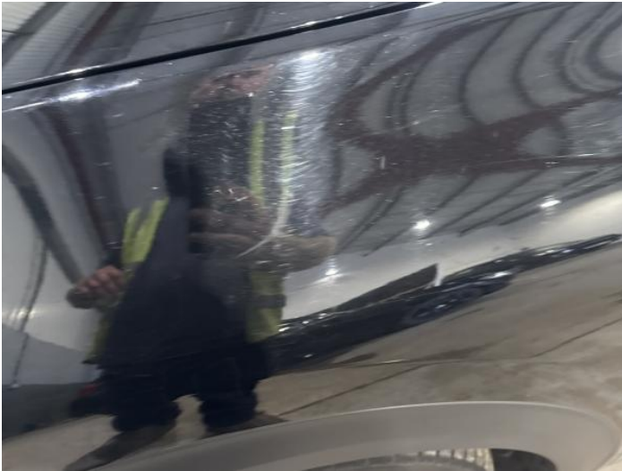
21: Wing nsf Chipped 1 To 5