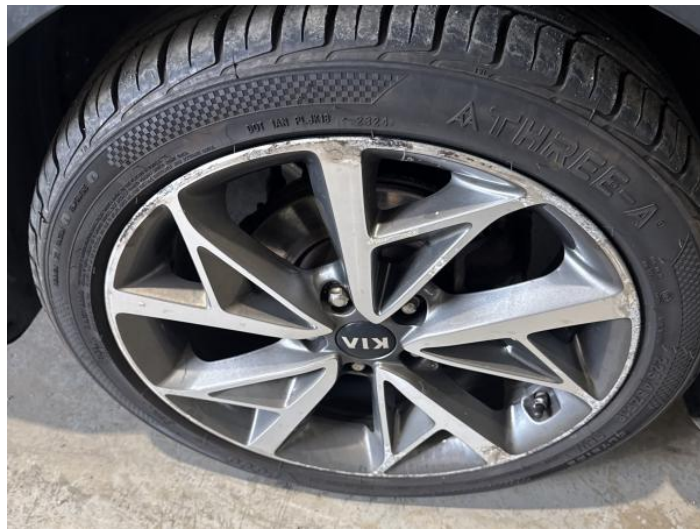
5: Wheel osf Scratched Over 50mm