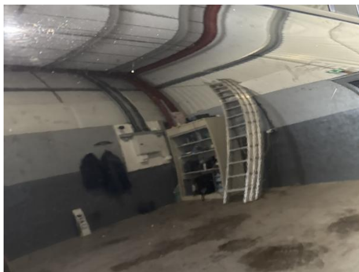
7: Door osr Chipped 1 To 5