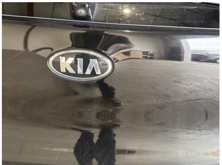
14: Boot Lid Chipped 1 To 5