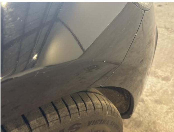
13: Wing osf Scratched Over 25mm Thru Paint