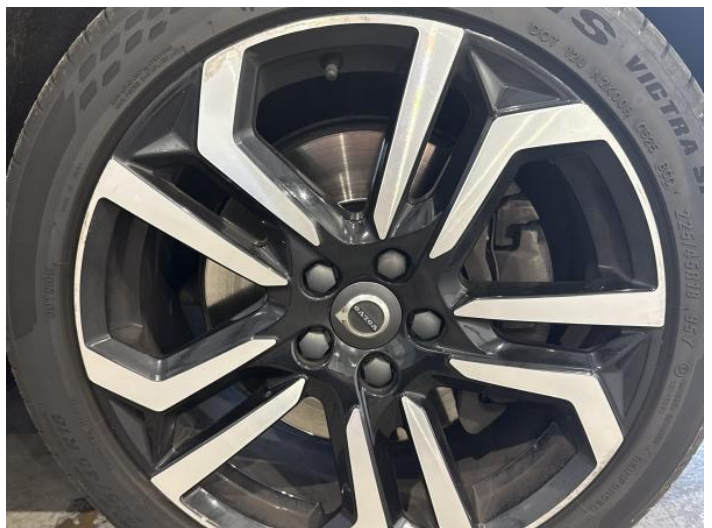
14: Wheel osf Scratched Up To 50mm