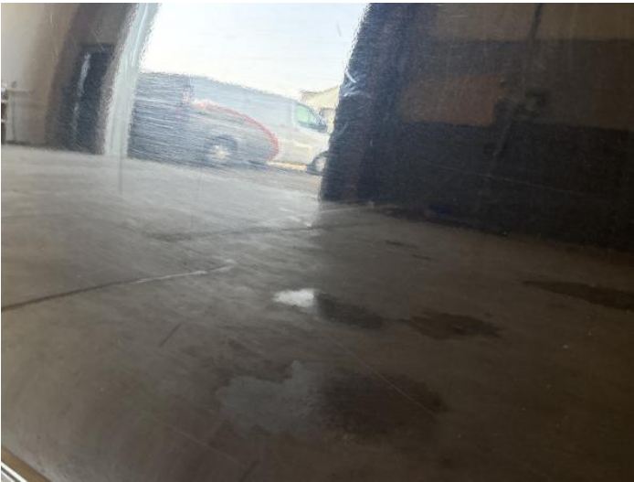
5: Door nsf Scratched Over 25mm Thru Paint