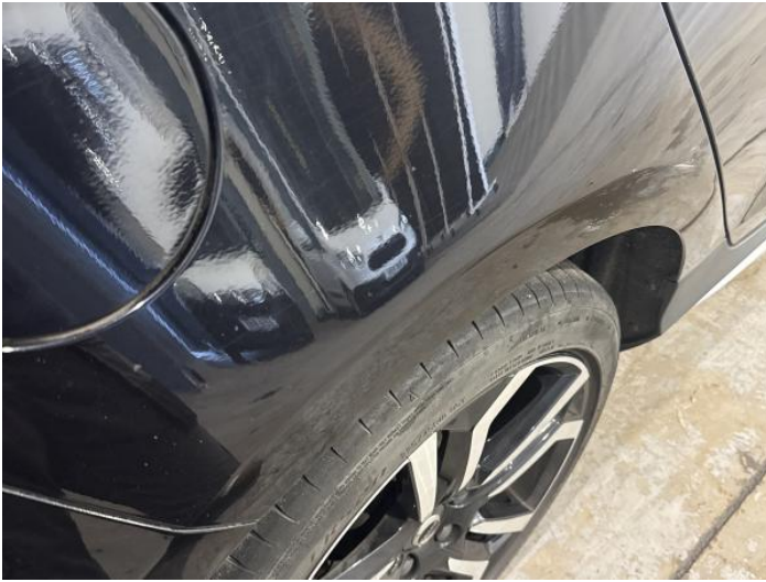
9: Qtr Panel osr Chipped Multiple Chips