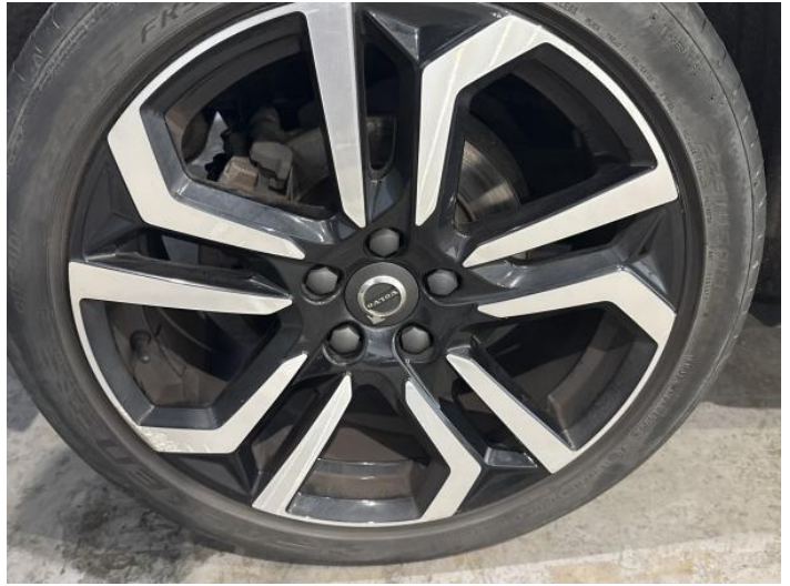
10: Wheel osr Scratched Over 50mm