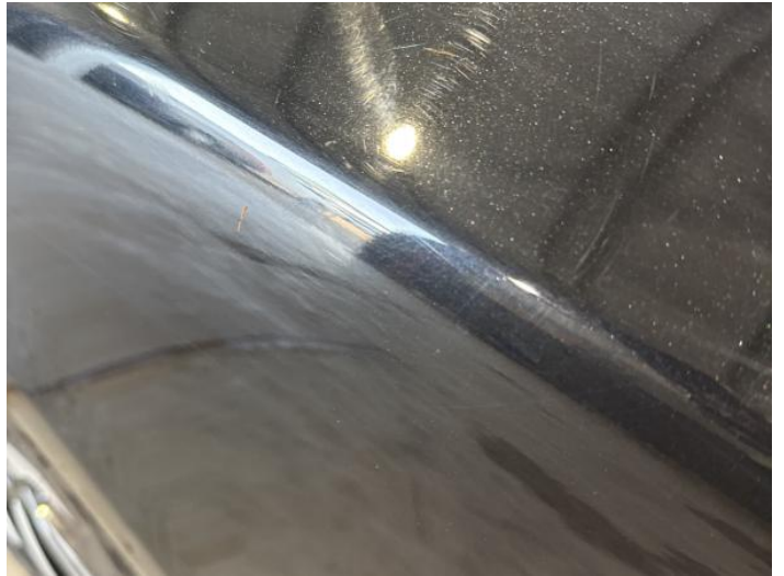
4: Wing nsf Scratched UpTo 25mm Thru Paint