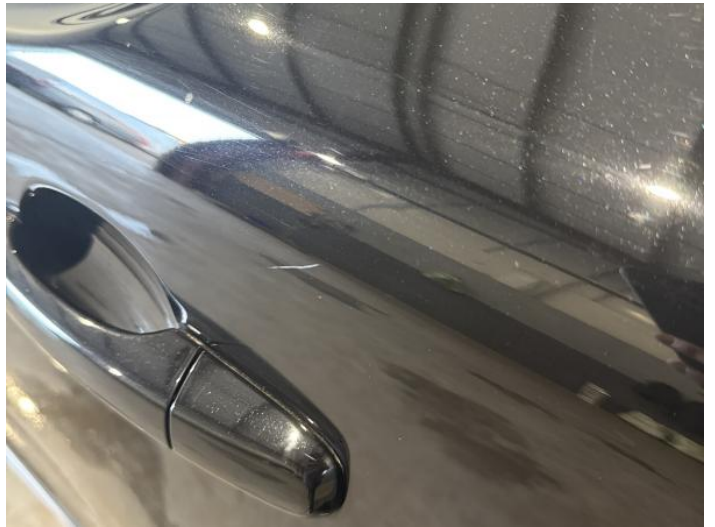
6: Door nsr Scratched UpTo 25mm Thru Paint