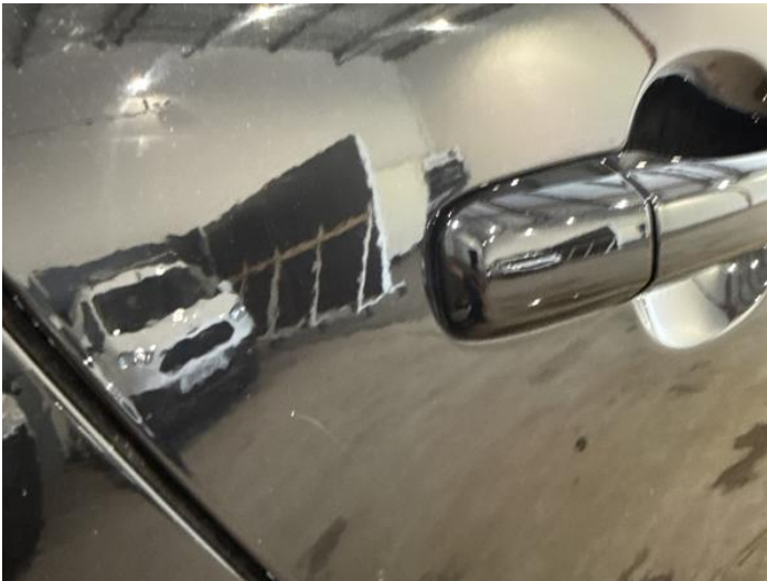
11: Door osr Scratched Over 25mm Thru Paint