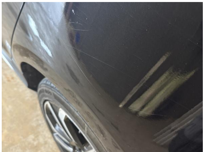
8: Qtr Panel nsr Scratched Over 25mm Thru Paint