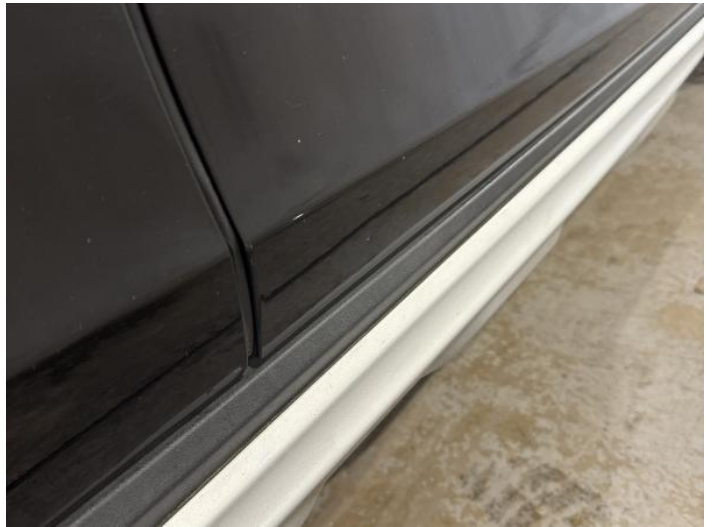
12: Door osf Dented Between 10mm + 30mm