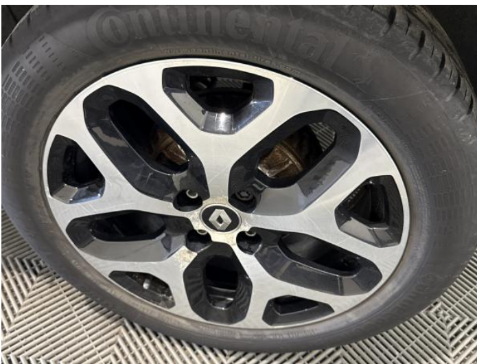
7: Wheel nsr Scratched Over 50mm