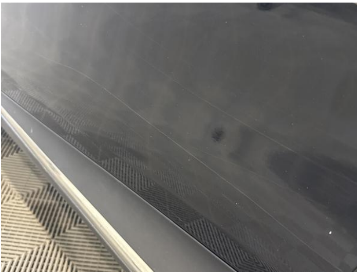
5: Door nsf Scratched Over 25mm Thru Paint