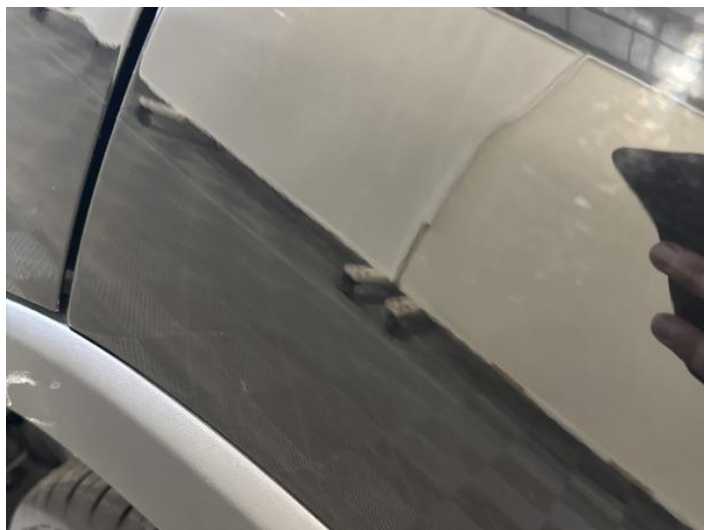
8: Qtr Panel nsr Scratched Over 25mm Thru Paint