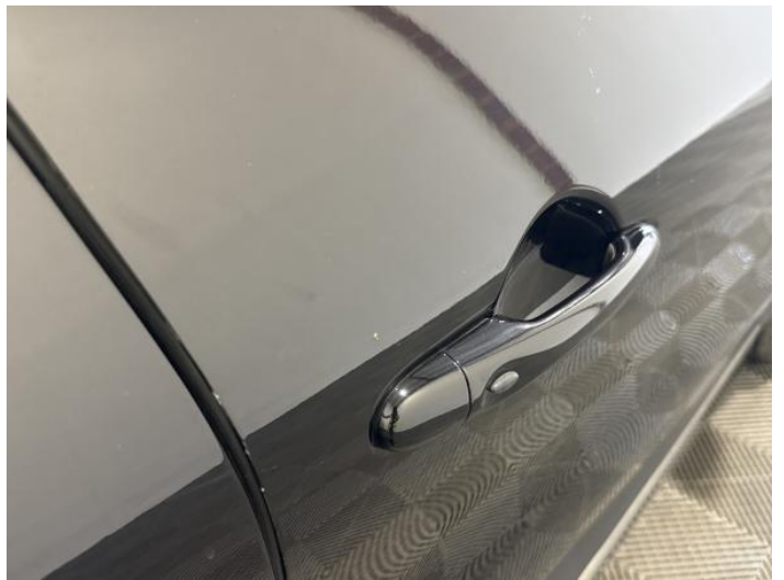
12: Door osf Dented Between 10mm + 30mm