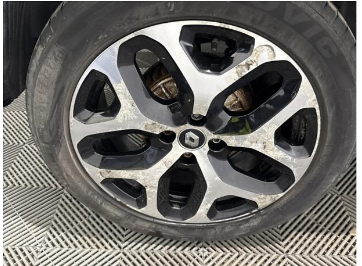
10: Wheel osr Scratched Over 50mm