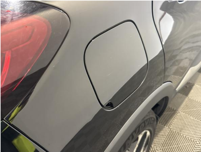
9: Qtr Panel osr Dented Between 10mm + 30mm