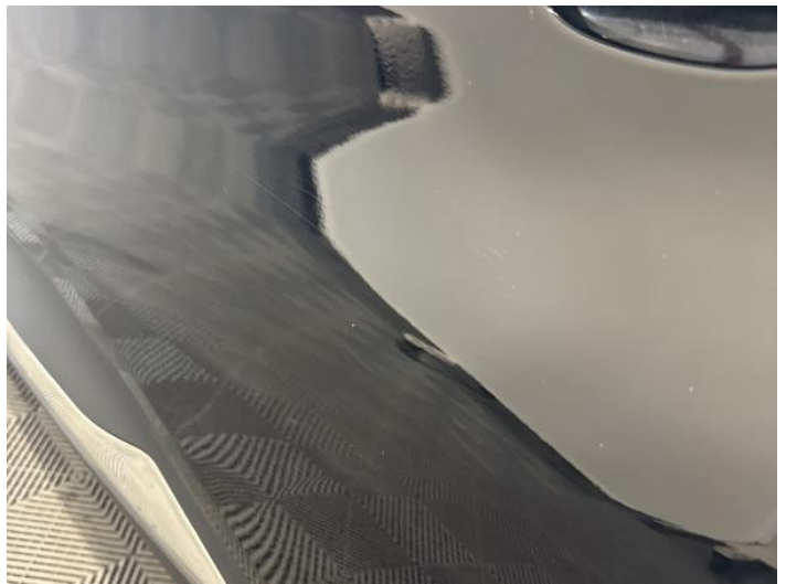
6: Door nsr Scratched Over 25mm Thru Paint