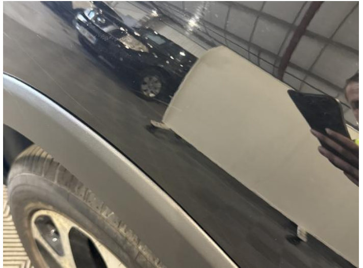
4: Wing nsf Scratched UpTo 25mm Thru Paint