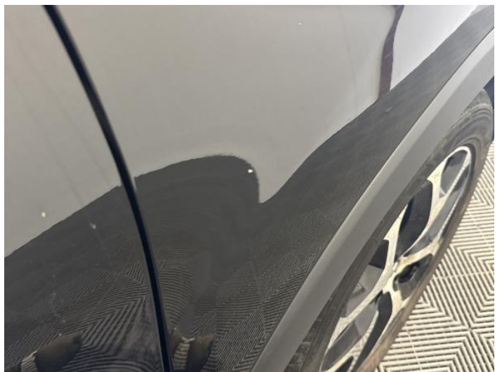
14: Wing osf Chipped 1 To 5