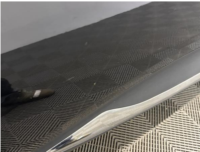
11: Door osr Scratched UpTo 25mm Thru Paint