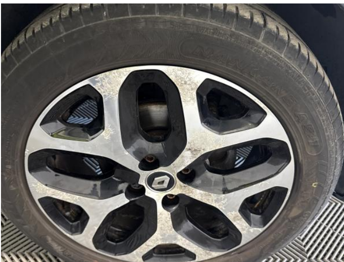
13: Wheel osf Scratched Over 50mm