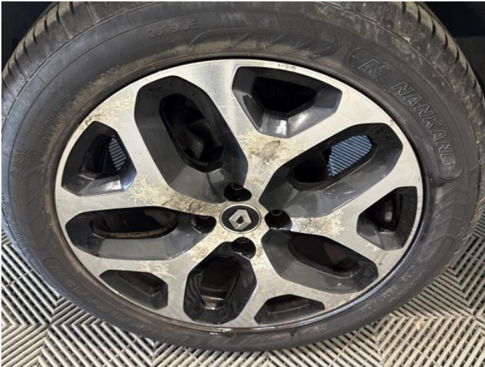
3: Wheel osf Scratched Over 50mm