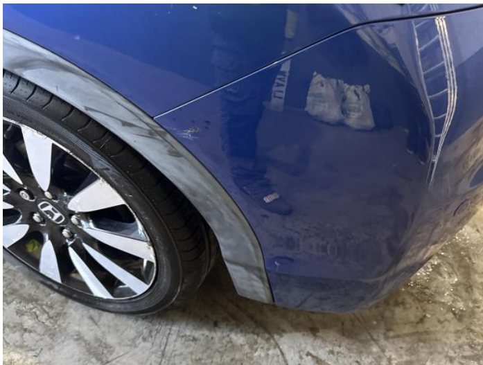
11: Bumper Rear Scratched Over 100mm Thru Paint