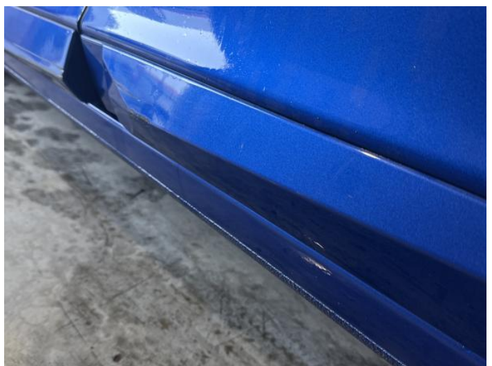
8: Door Moulding nsr Scratched (Painted) Over 25mm Thru Paint