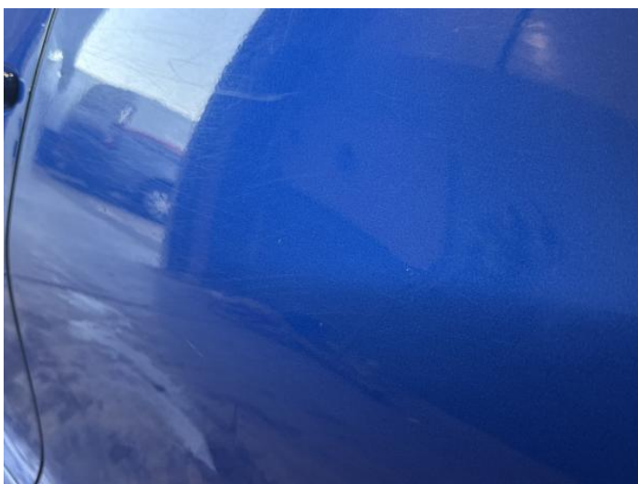
7: Door nsr Scratched Over 25mm Thru Paint