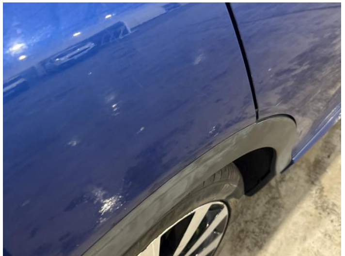
12: Qtr Panel osr Scratched UpTo 25mm Thru Paint