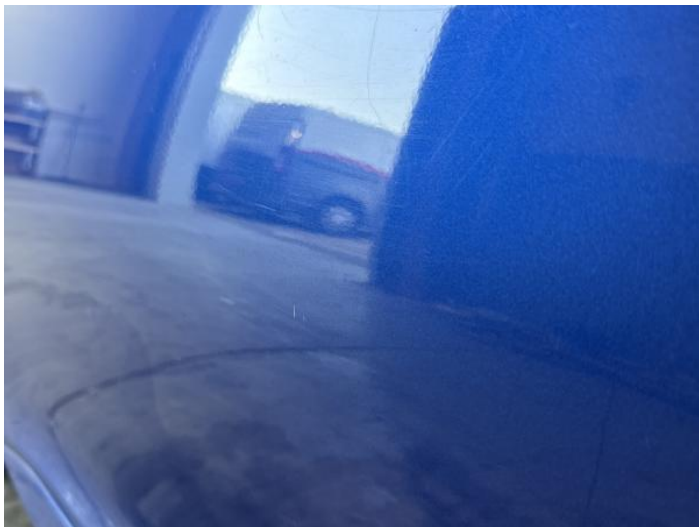
5: Door nsf Scratched Over 25mm Thru Paint