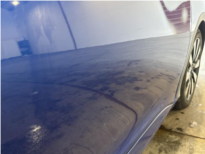
15: Door osf Dented Over 30mm