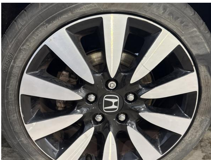
13: Wheel osr Scratched Over 50mm