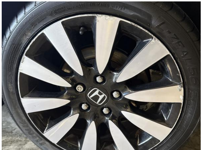
10: Wheel nsr Scratched Over 50mm