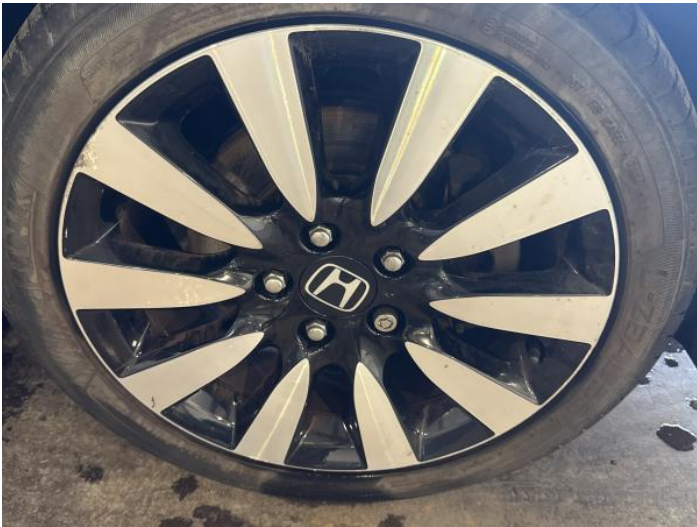
17: Wheel osf Scratched Over 50mm