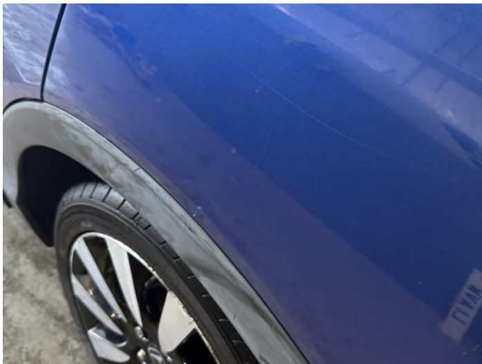
9: Qtr Panel nsr Dented Between 10mm + 30mm