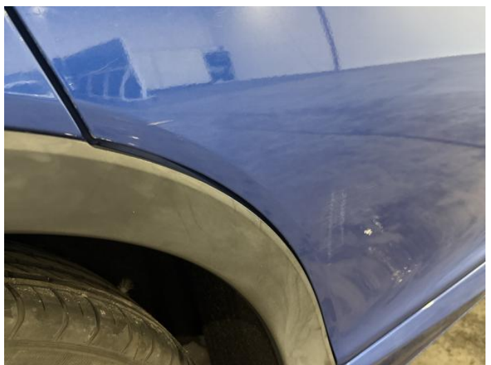
14: Door osr Dented With Paint Damage