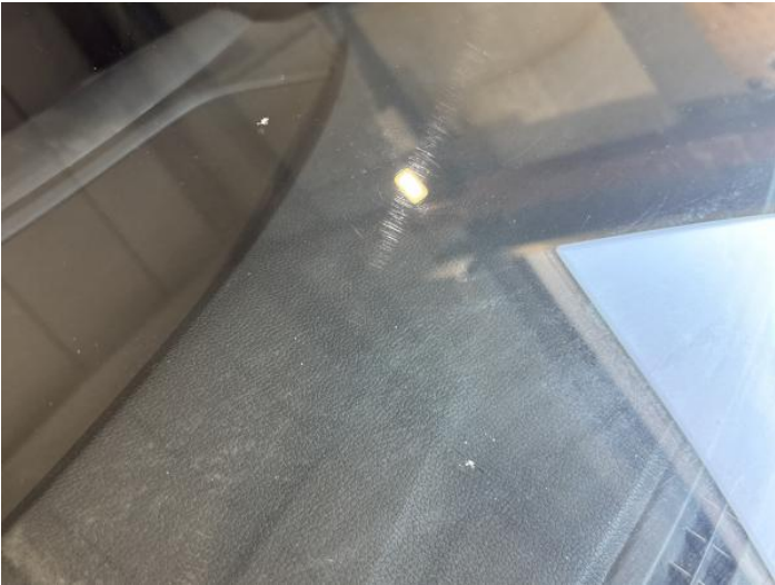
16: Screen Front Chipped Over 10mm