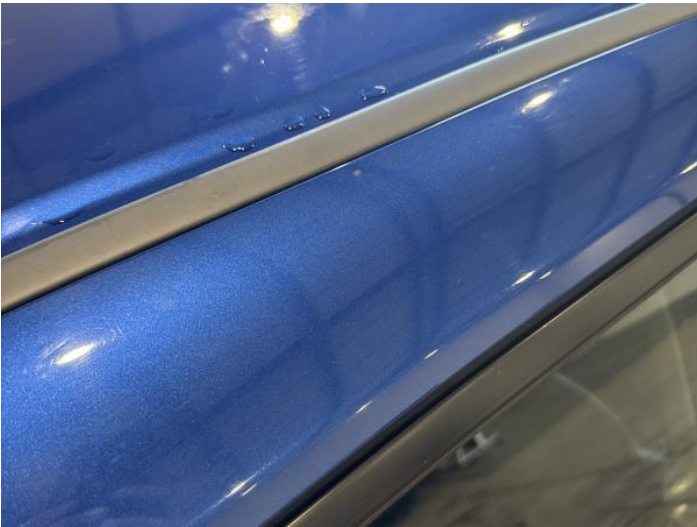
18: Roof Chipped 1 To 5

Carpet Condition Average Seat Condition Average