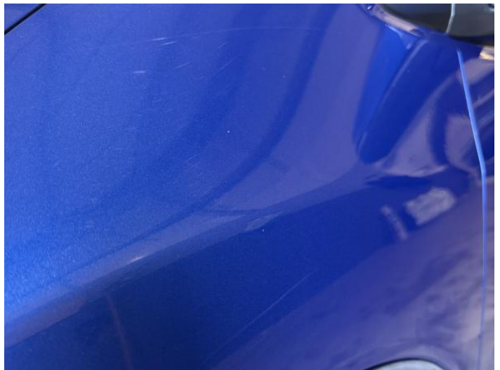
4: Wing nsf Chipped 1 To 5