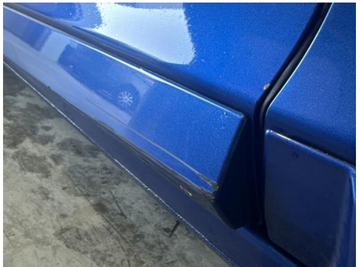
6: Door Moulding nsf Scratched (Painted) Over 25mm Thru Paint