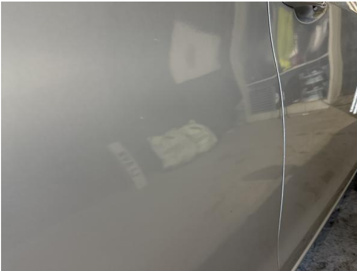
11: Door osr Dented Between 10mm + 30mm