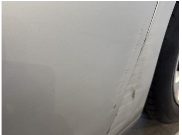
6: Door nsr Dented With Paint Damage