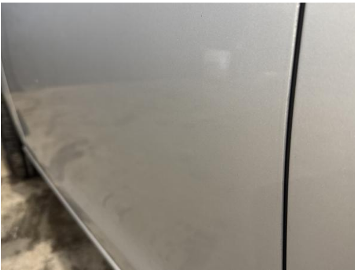
5: Door nsf Dented Over 30mm