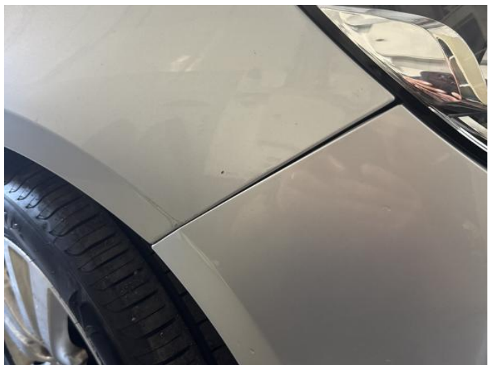
14: Wing osf Scratched Over 25mm Thru Paint