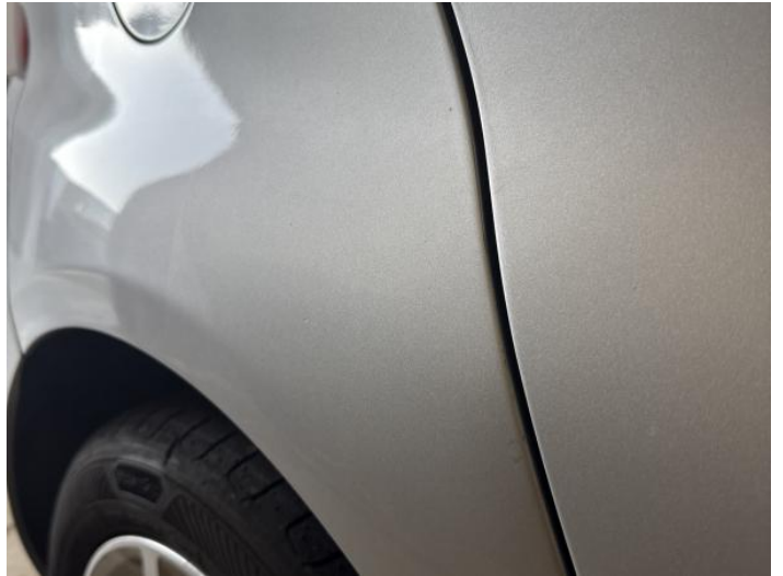
10: Qtr Panel osr Poor Previous Repair Rippled UpTo 30%