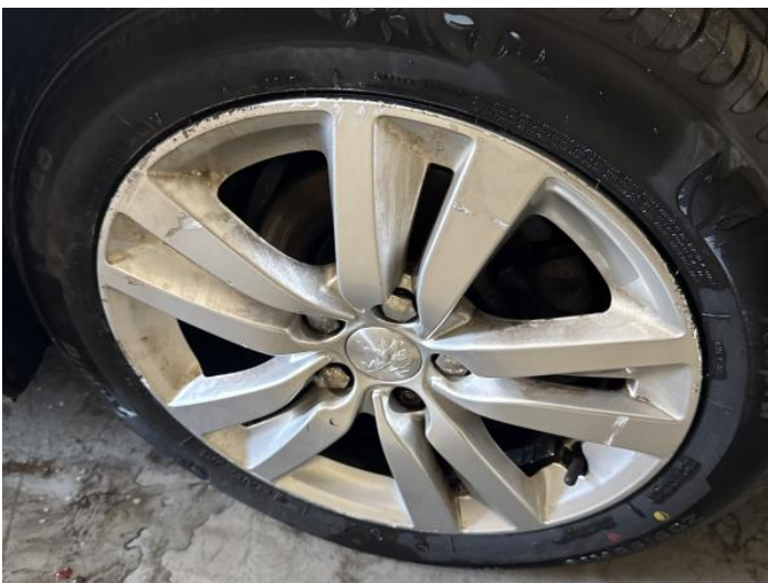
13: Wheel osf Scratched Over 50mm