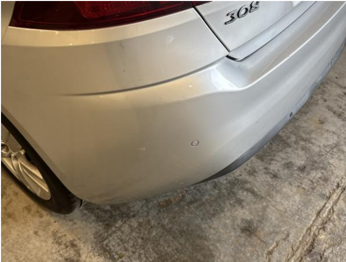
9: Bumper Rear Scratched Over 100mm Thru Paint