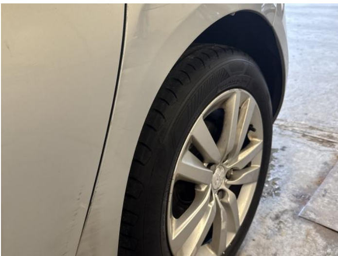
7: Qtr Panel nsr Dented With Paint Damage