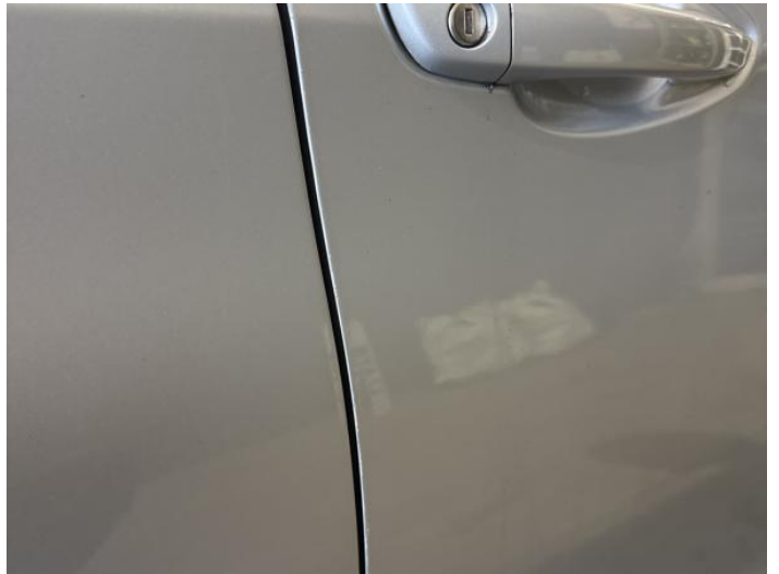
12: Door osf Chipped Edge Chip