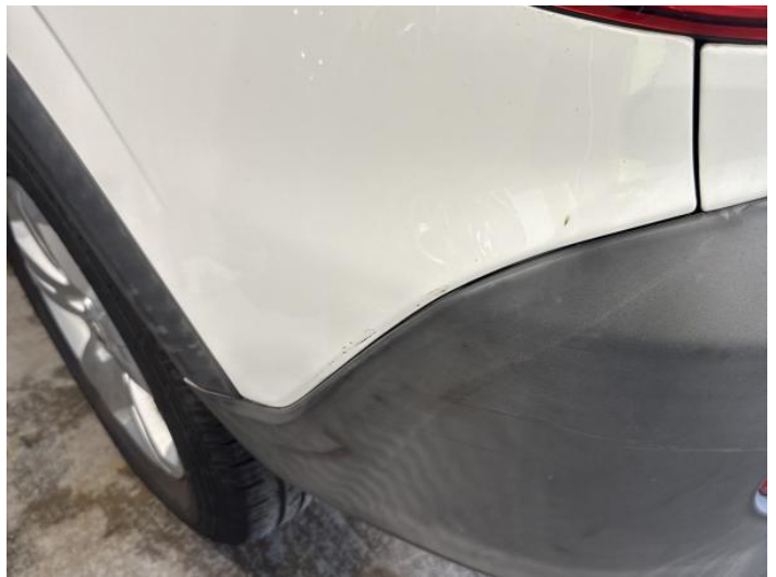
6: Qtr Panel nsr Scratched Over 25mm Thru Paint