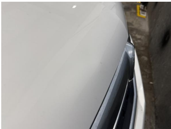
1: Bonnet Dented Between 10mm + 30mm