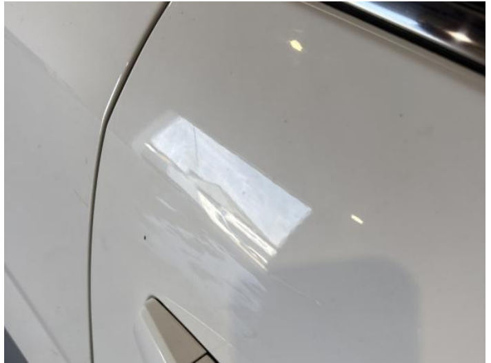
4: Door osr Scratched Over 25mm Thru Paint