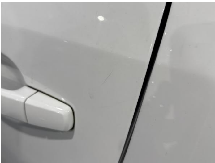
7: Door nsr Scratched UpTo 25mm Thru Paint