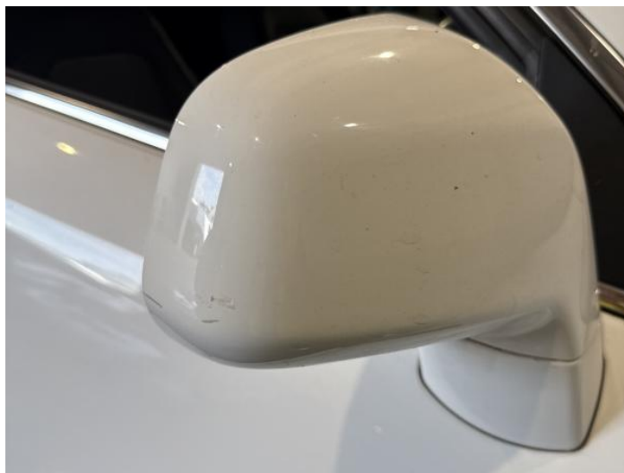
2: Door Mirror Assy osf Scratched (Painted) UpTo 25mm Thru Paint