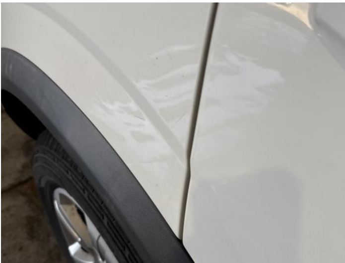
5: Qtr Panel osr Scratched UpTo 25mm Thru Paint