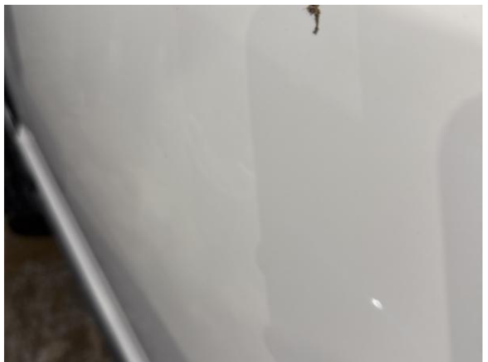
8: Door nsf Dented Between 10mm + 30mm