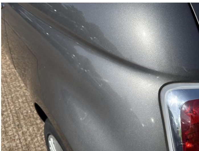
7: Qtr Panel nsr Dented Over 30mm