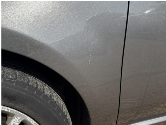
4: Wing nsf Scratched Over 25mm Thru Paint