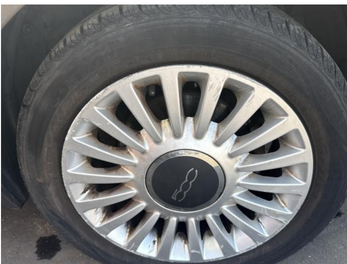
13: Wheel osf Scratched Over 50mm