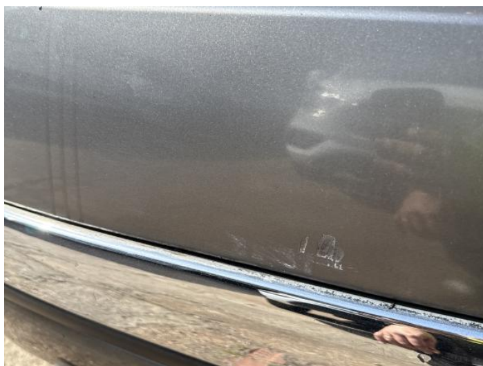
8: Bumper Rear Dented With Paint Damage