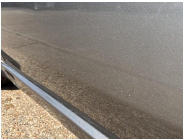
5: Door nsf Dented Over 30mm