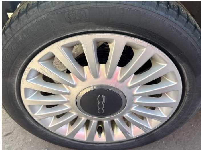
10: Wheel osr Scratched Over 50mm