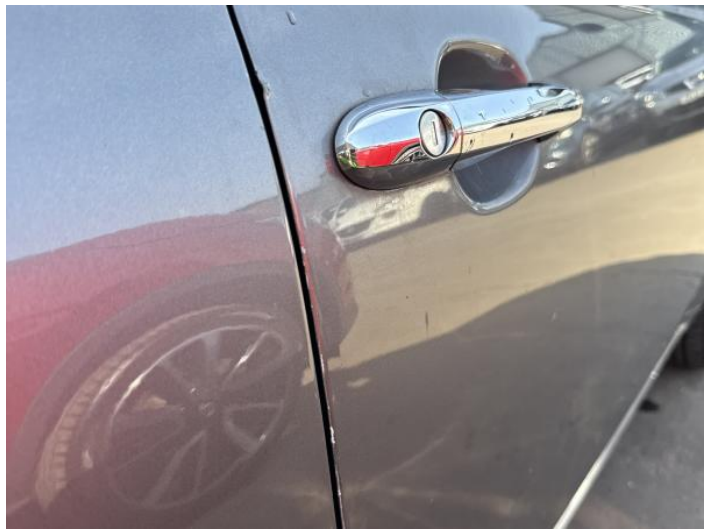
12: Door osf Dented With Paint Damage