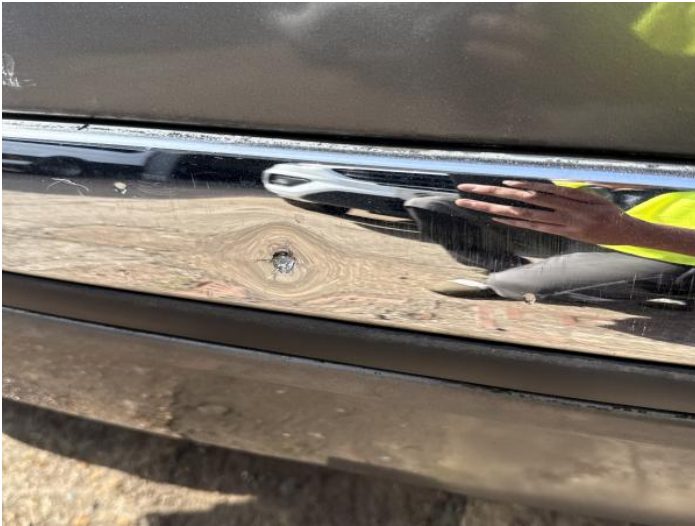
9: Bumper Rear Moulding Broken Replace