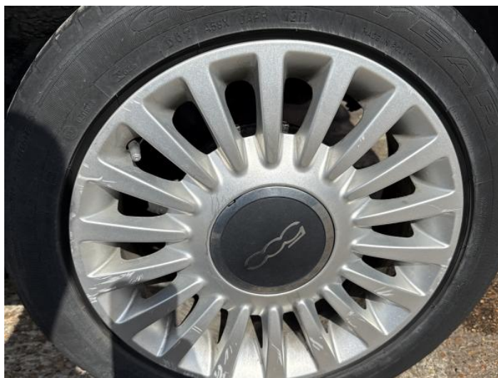
6: Wheel nsr Scratched Over 50mm