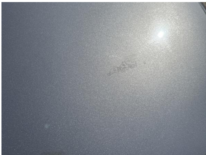
1: Bonnet Scratched Over 25mm Thru Paint