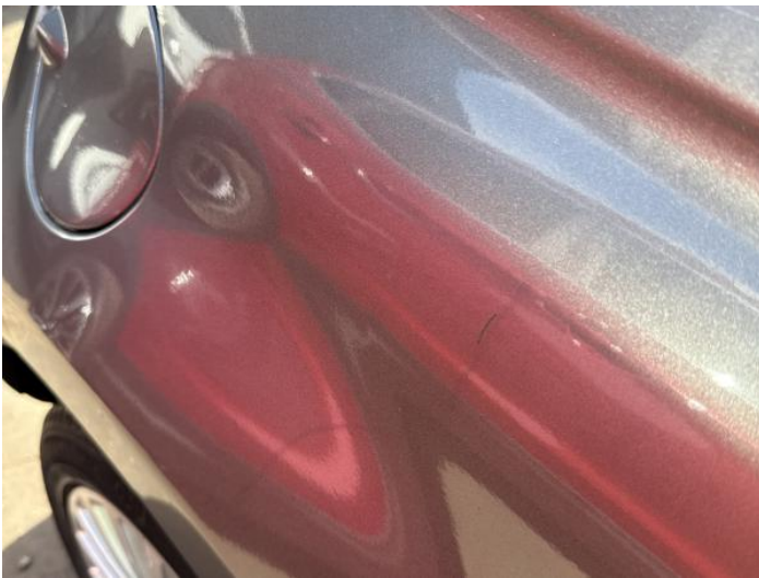
11: Qtr Panel osr Poor Previous Repair Poor Paint