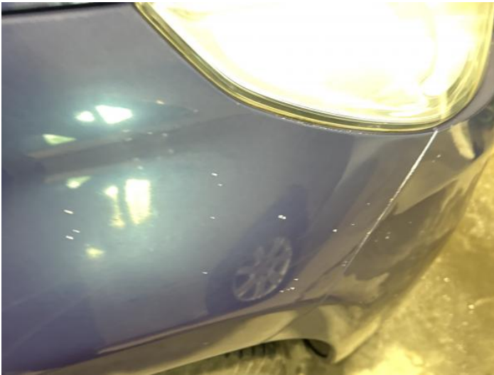
11: Wing osf Chipped Multiple Chips