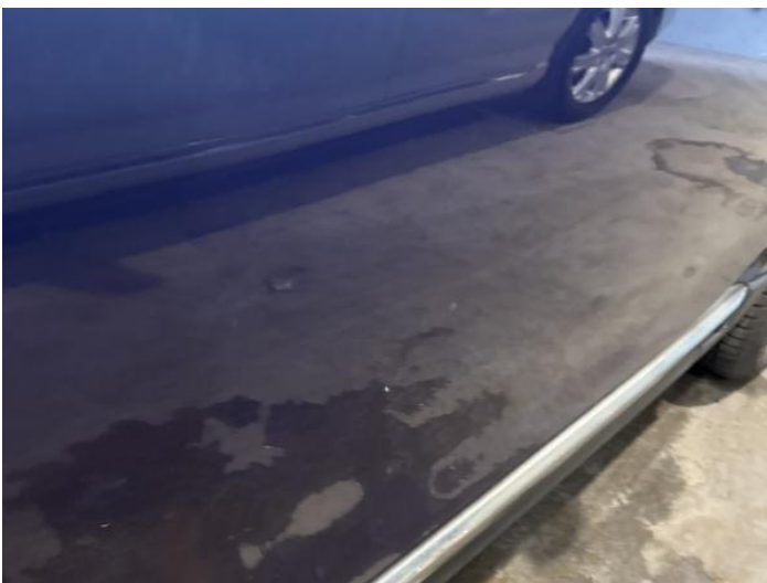
7: Door osf Chipped 1 To 5