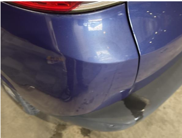
1: Bumper Rear Poor Previous Repair Poor Paint