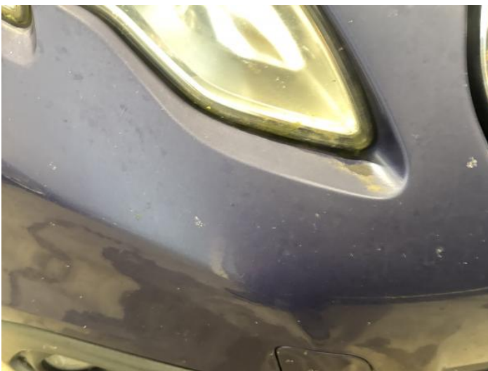
13: Bumper Front Poor Previous Repair Poor Paint