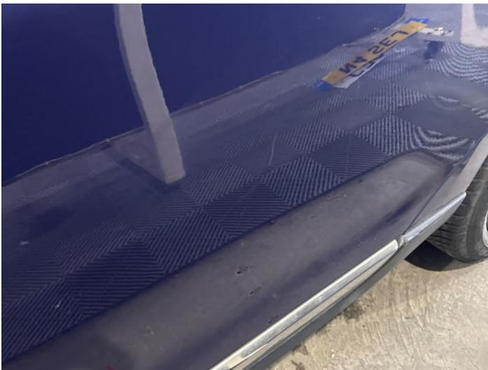
17: Door nsr Chipped 1 To 5