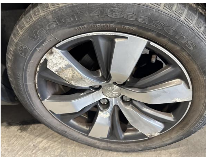
19: Wheel nsr Scratched Over 50mm