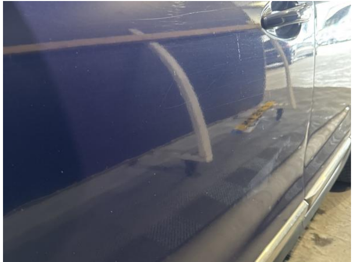
16: Door nsf Poor Previous Repair Poor Paint