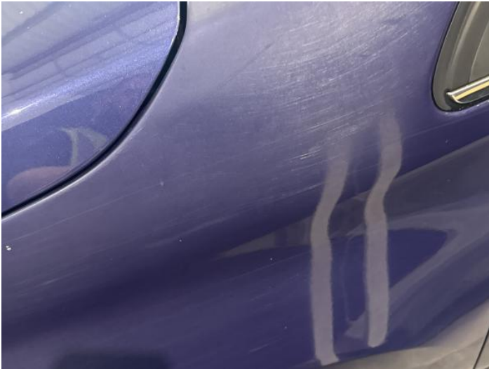
15: Wing nsf Poor Previous Repair Poor Paint