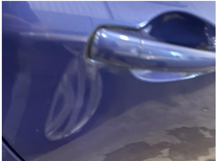
6: Door osr Chipped 1 To 5