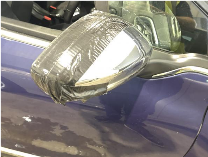
9: Door Mirror Assy osf Broken Replace