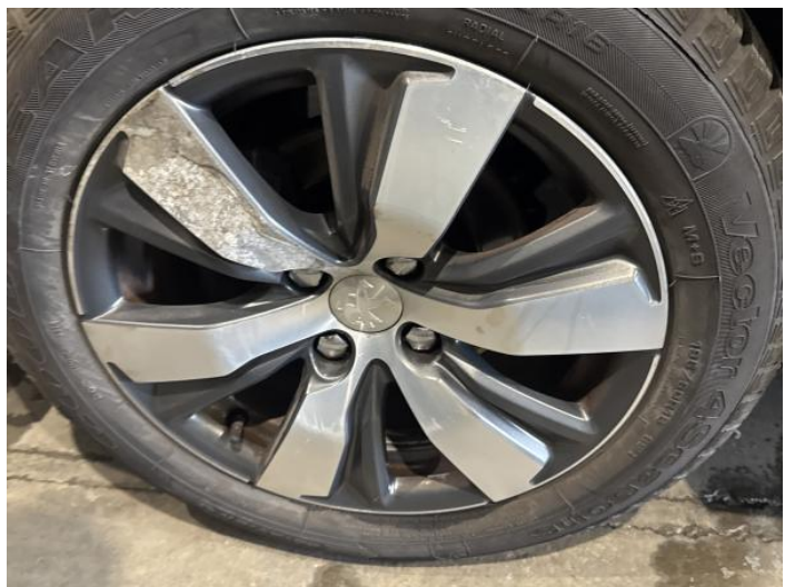
14: Wheel nsf Scratched Over 50mm