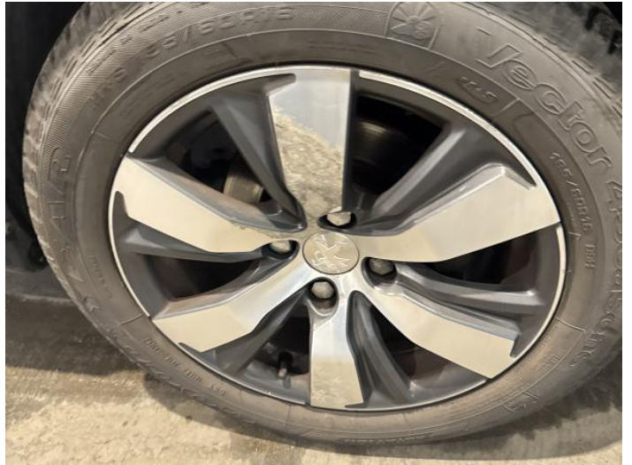
10: Wheel osf Scratched Over 50mm