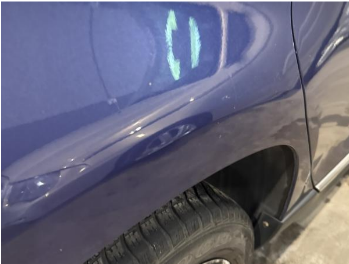
5: Qtr Panel osr Dented 2 Or Less UpTo 10mm