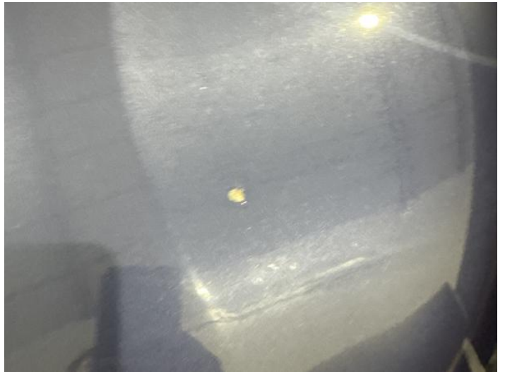
12: Bonnet Chipped Over 5mm