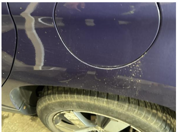
20: Qtr Panel nsr Dented Over 2 UpTo 10mm