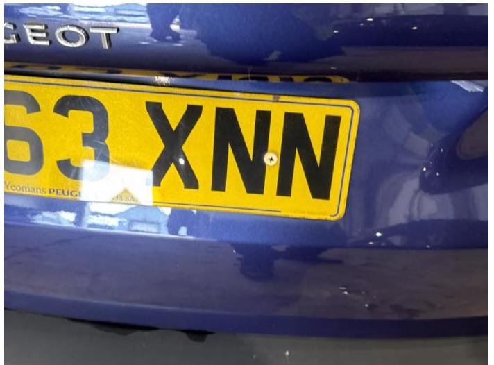
2: Boot Lid Chipped 1 To 5