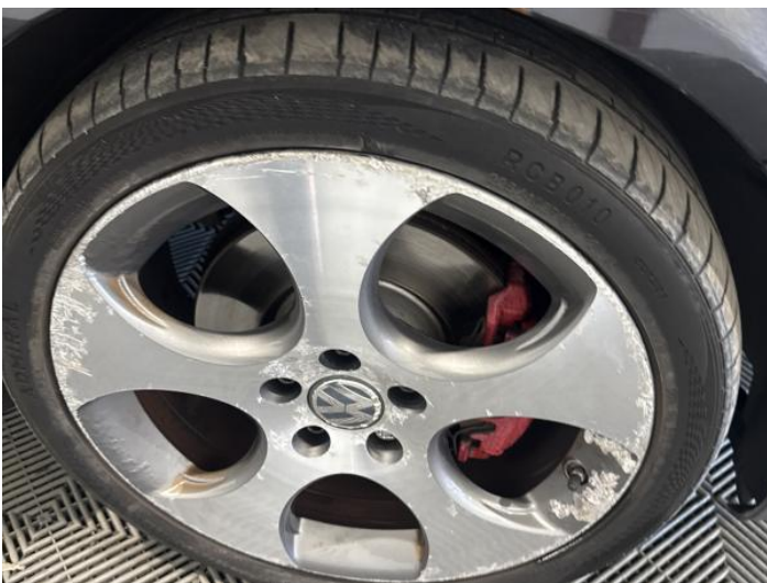
19: Wheel osf Scratched Over 50mm