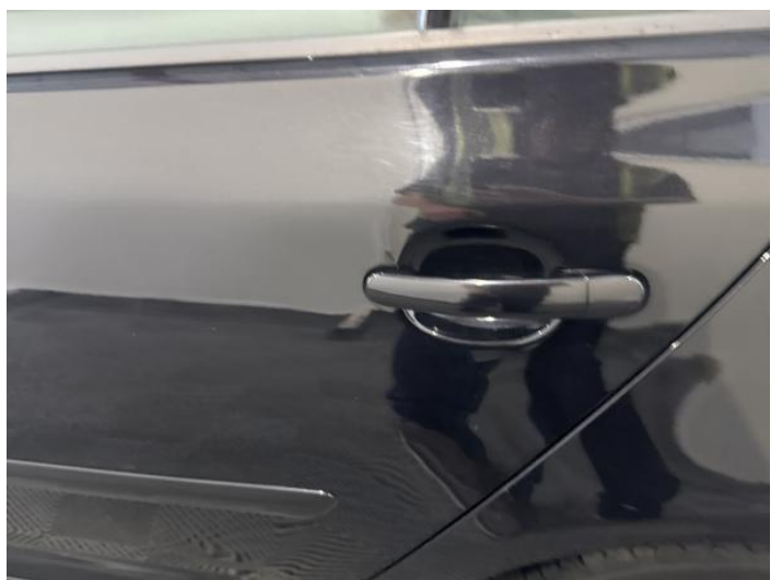
8: Door nsr Dented Over 30mm