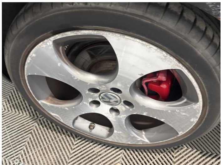
14: Wheel osr Scratched Over 50mm