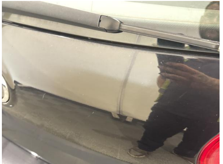
12: Boot Lid Dented Over 2 UpTo 10mm