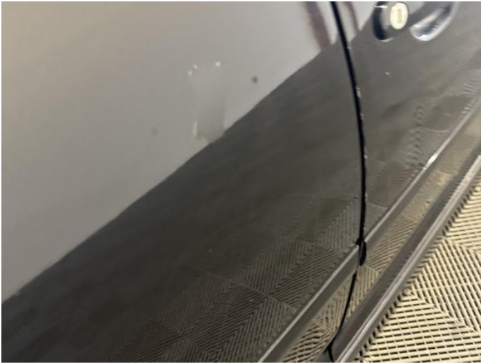
15: Door osr Poor Previous Repair Paint Flake