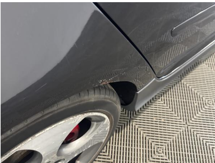
13: Qtr Panel osr Rusted Over 5mm