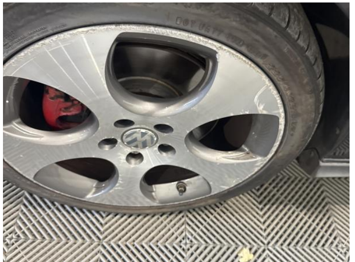
6: Wheel nsf Scratched Over 50mm