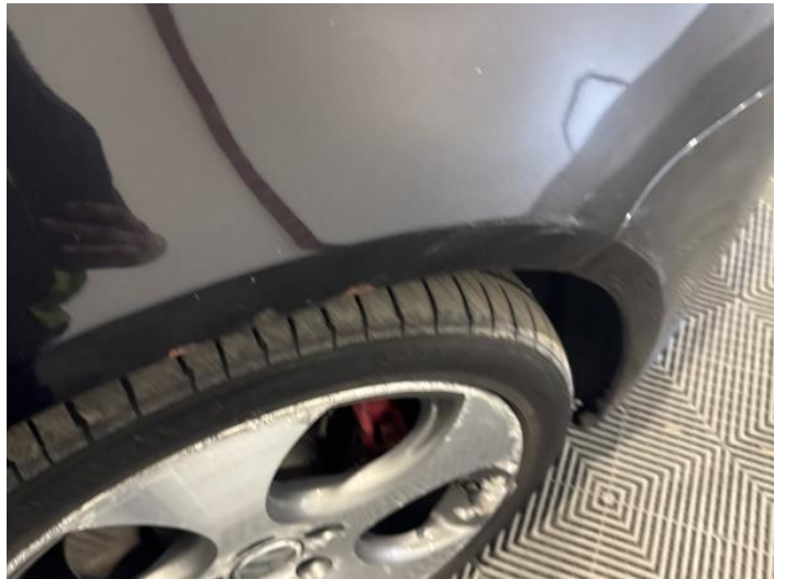
18: Wing osf Rusted Over 5mm