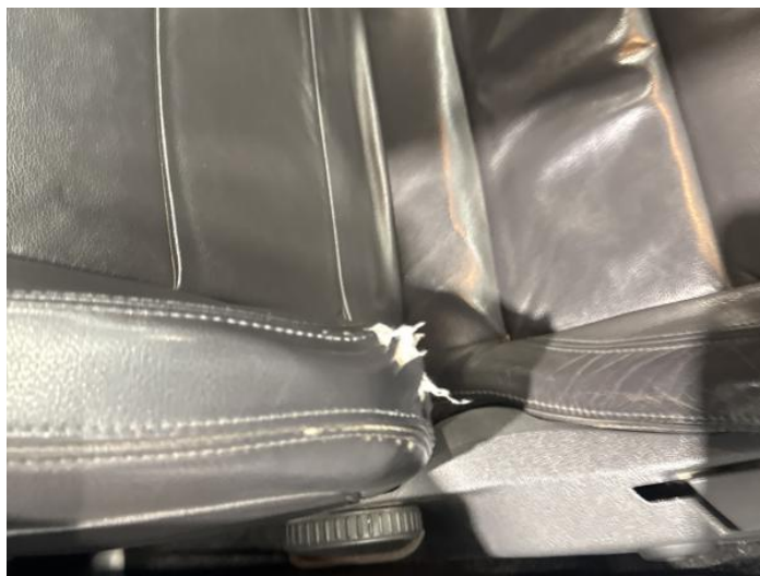
2: Seat Back Cover osf Torn Over 3mm