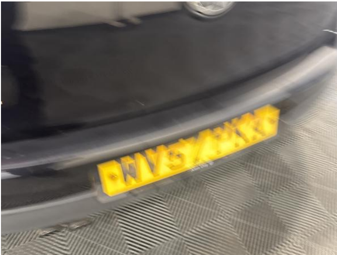
11: Bumper Rear Poor Previous Repair Poor Paint