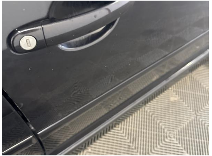
16: Door osf Dented Over 30mm