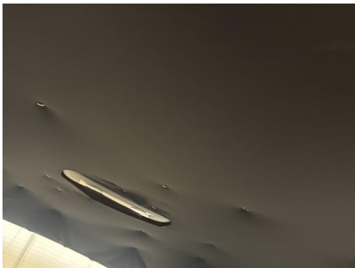
1: Roof Lining Torn Over 3mm