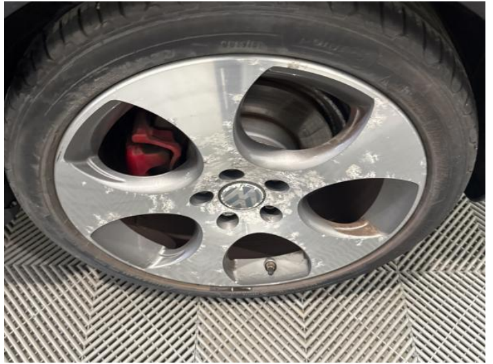
10: Wheel nsr Scratched Over 50mm