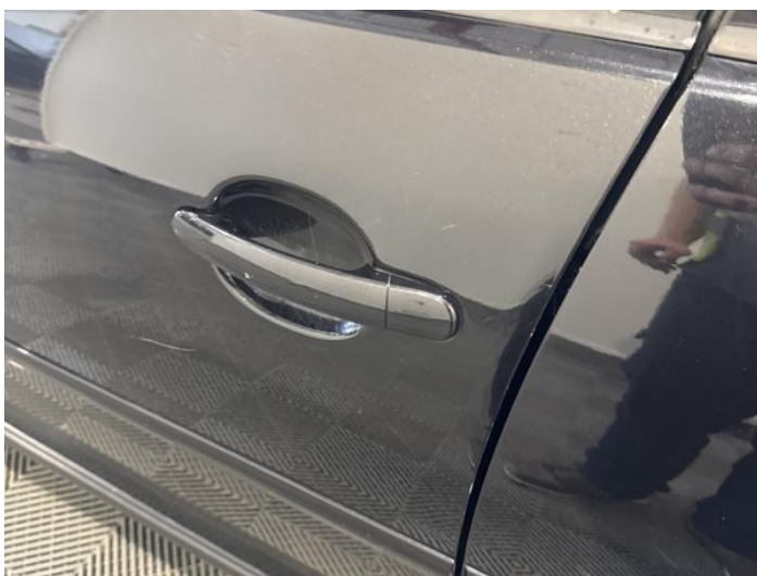
7: Door nsf Dented With Paint Damage