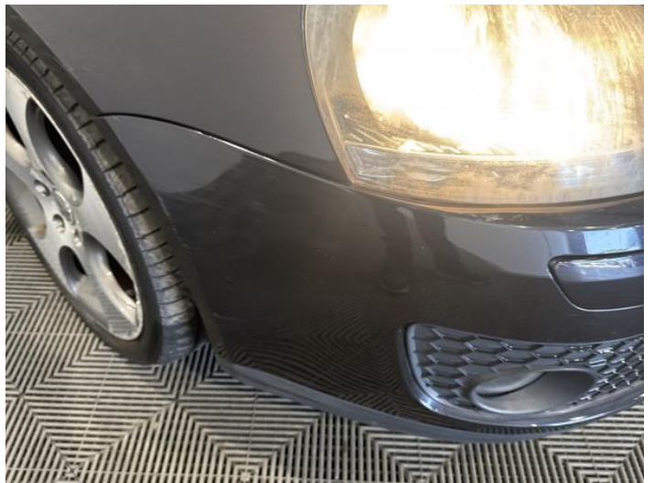
4: Bumper Front Scratched Over 100mm Thru Paint