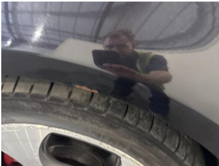
5: Wing nsf Rusted Over 5mm