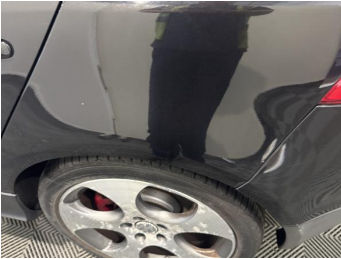
9: Qtr Panel nsr Dented With Paint Damage