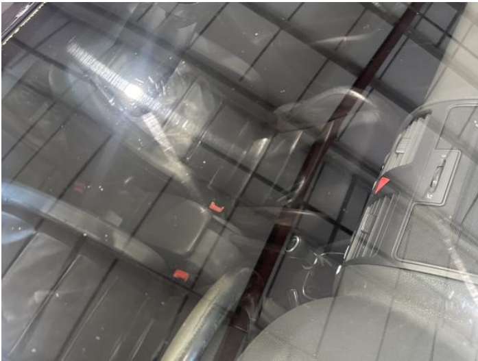
17: Screen Front Chipped UpTo 10mm