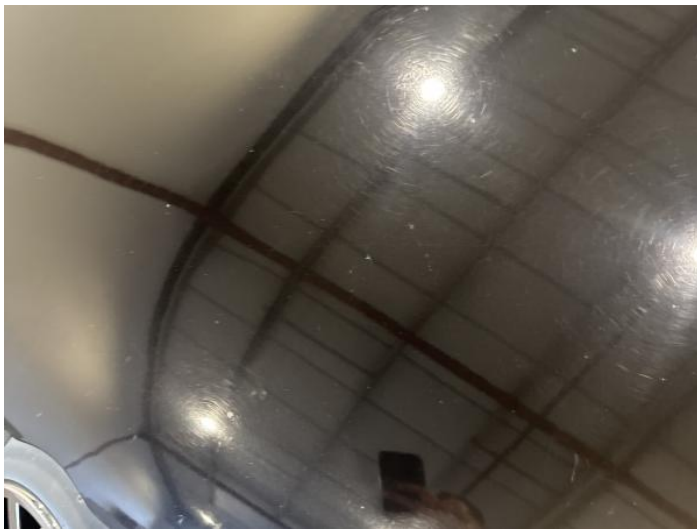
3: Bonnet Chipped Multiple Chips