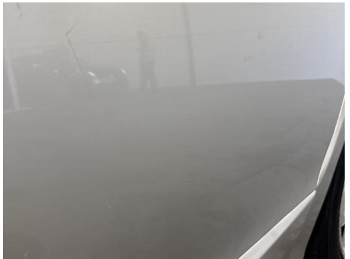
12: Door nsr Scratched Over 25mm Thru Paint