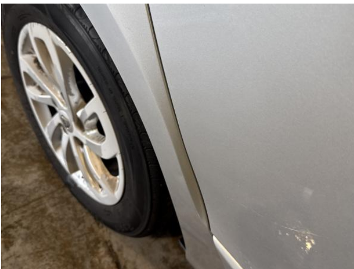
7: Qtr Panel osr Dented Between 10mm + 30mm