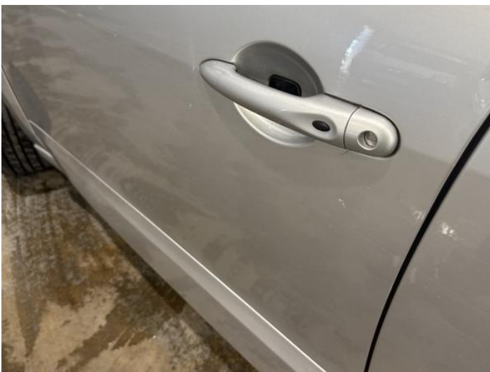
13: Door nsf Scratched Over 25mm Thru Paint