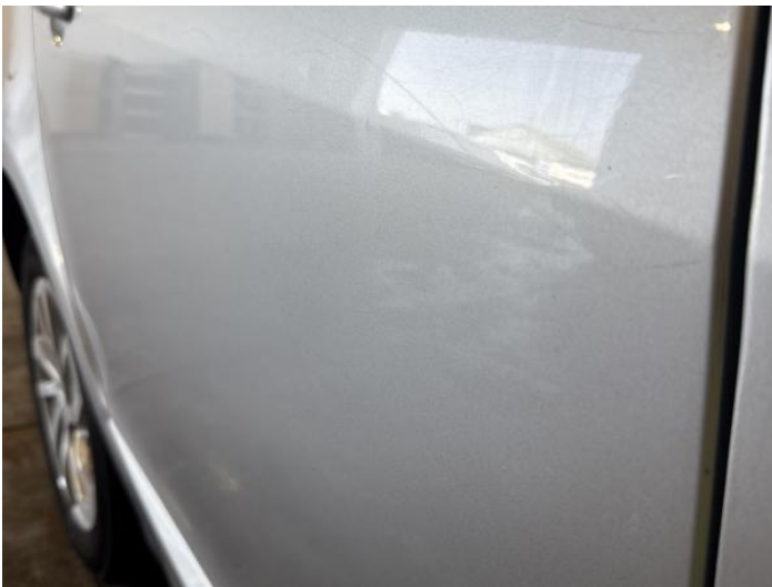
5: Door osr Dented Between 10mm + 30mm