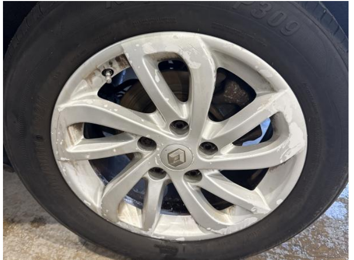
10: Wheel nsr Scratched Over 50mm