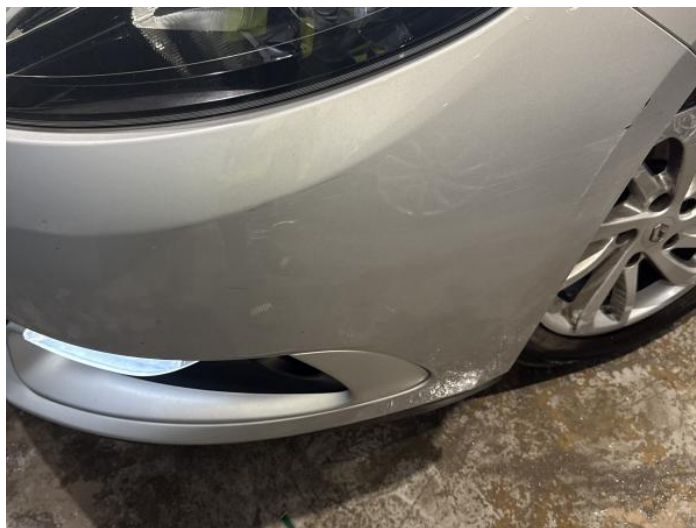
2: Bumper Front Dented With Paint Damage