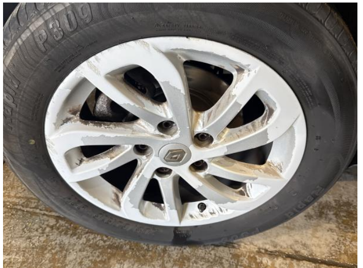
6: Wheel osr Scratched Over 50mm