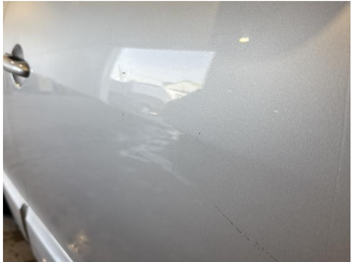
4: Door osf Dented With Paint Damage