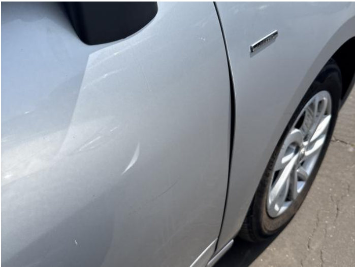
17: Wing osf Dented Over 30mm