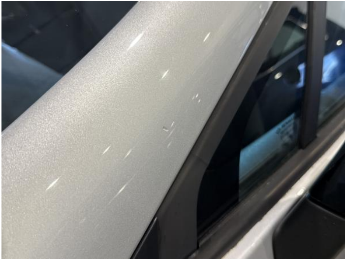
16: A Post ns Chipped 1 To 5