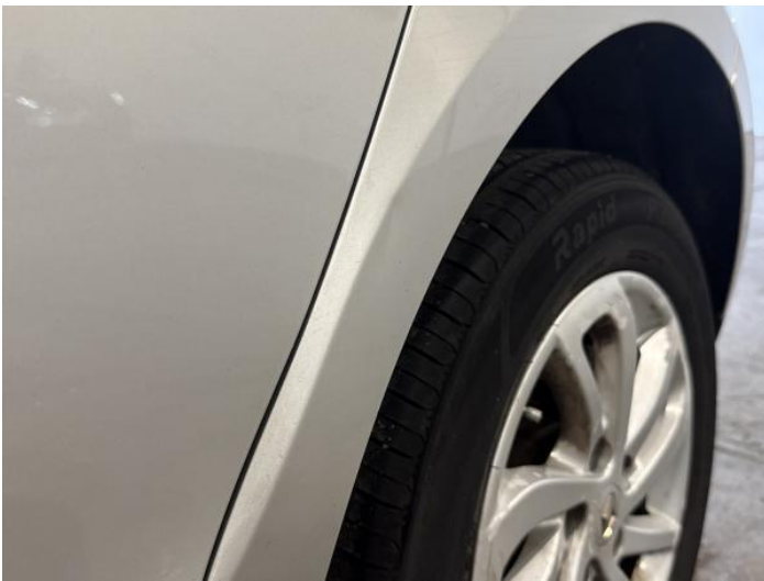
11: Qtr Panel nsr Dented Between 10mm + 30mm