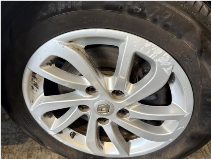
3: Wheel osf Scratched Over 50mm