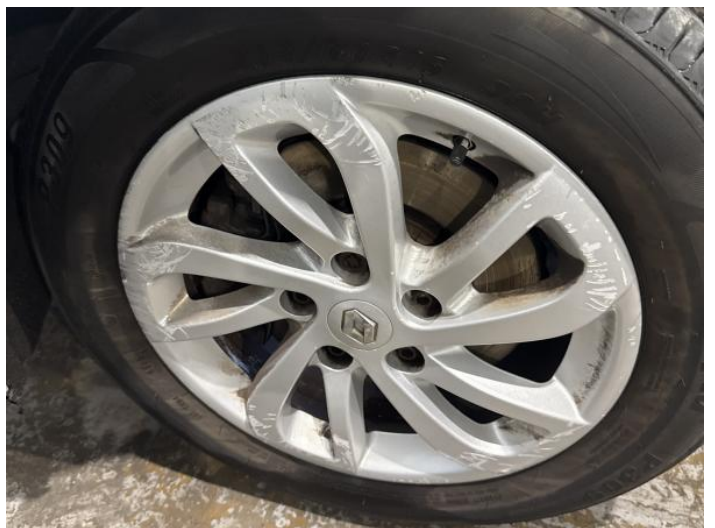
14: Wheel nsf Scratched Over 50mm