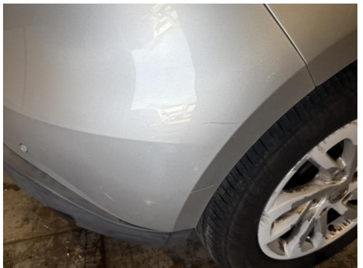
8: Bumper Rear Scratched Over 100mm Thru Paint