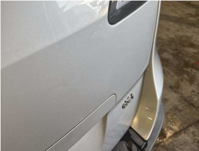
9: Tailgate Scratched Over 25mm Thru Paint