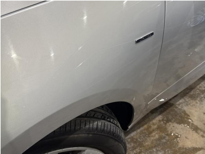
15: Wing nsf Scratched Over 25mm Thru Paint