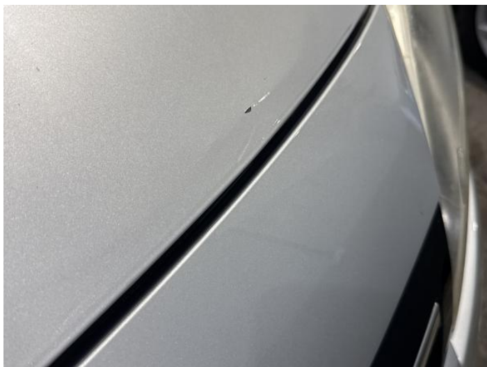
1: Bonnet Dented With Paint Damage