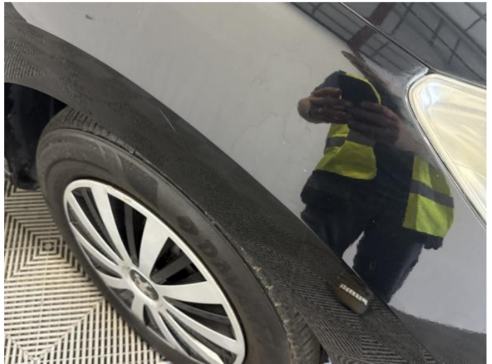
12: Wing osf Scratched Over 25mm Thru Paint