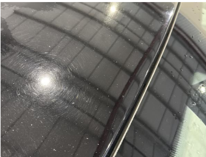
13: Roof Scratched Over 25mm Thru Paint