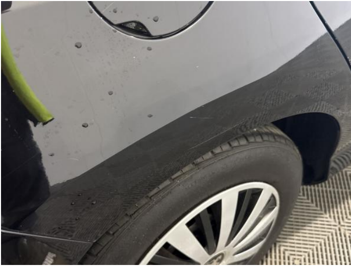
9: Qtr Panel osr Scratched Over 25mm Thru Paint