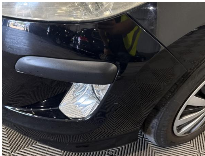
2: Bumper Front Scratched 25 to 100mm Thru Paint