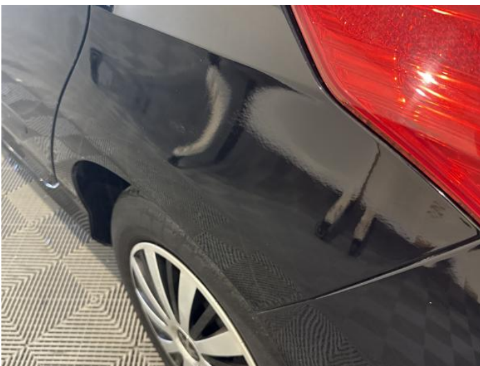
7: Qtr Panel osr Dented Over 30mm