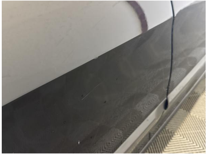
10: Door osr Dented With Paint Damage