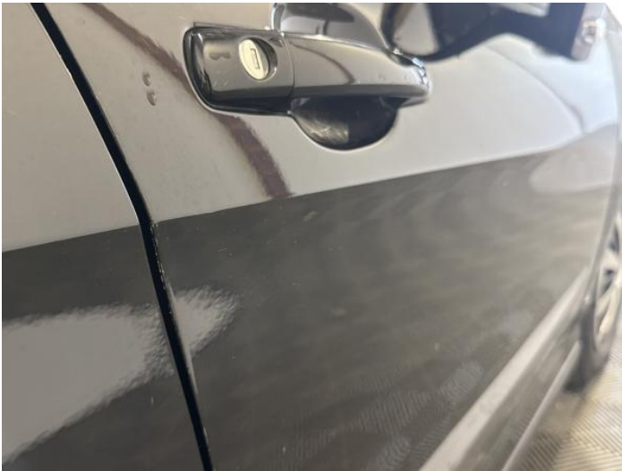
11: Door osf Dented Between 10mm + 30mm