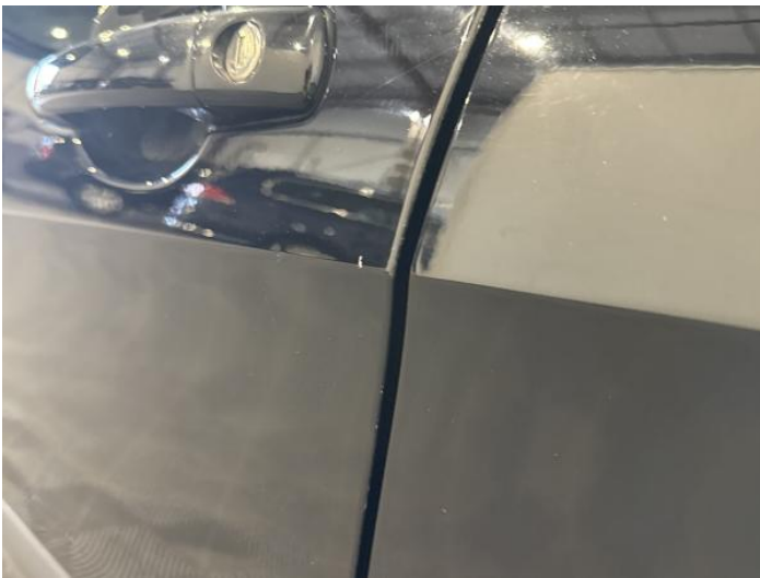
5: Door nsf Dented Between 10mm + 30mm