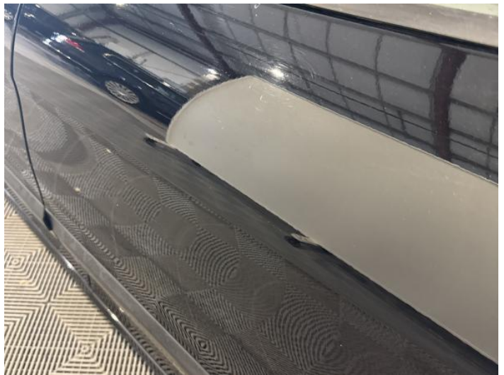
6: Door nsr Dented Between 10mm + 30mm