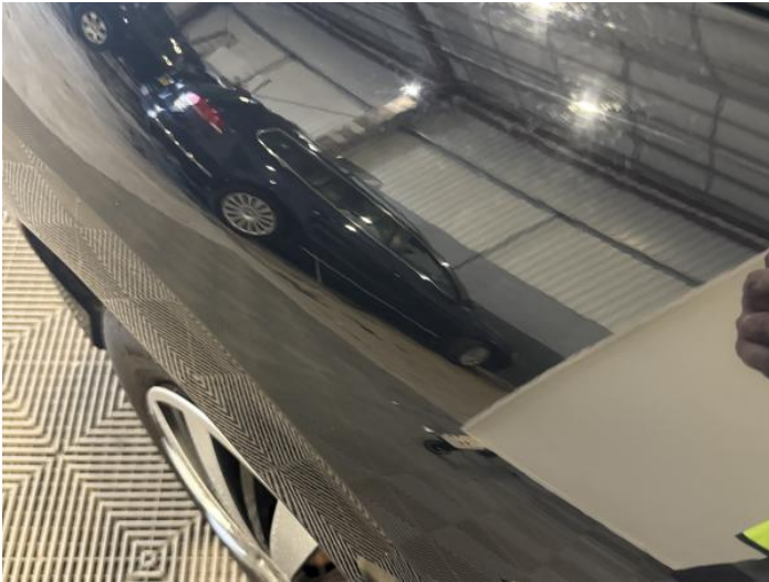
3: Wing nsf Scratched UpTo 25mm Thru Paint