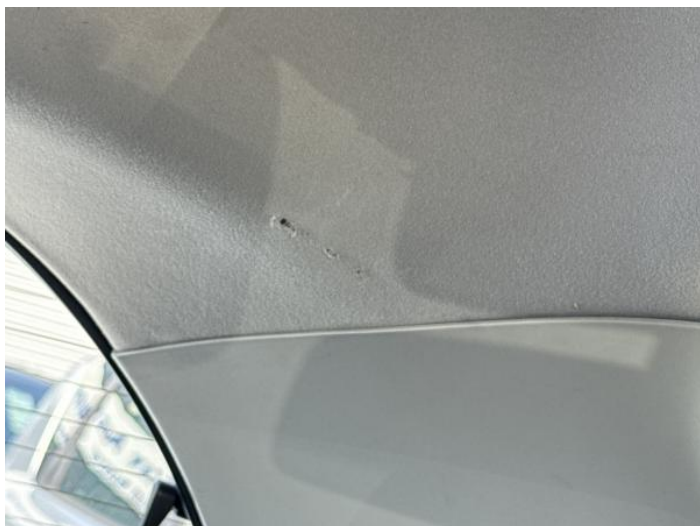
15: Roof Lining Scuffed Over 25mm