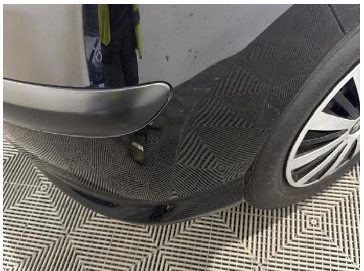
8: Bumper Rear Scratched Over 100mm Thru Paint