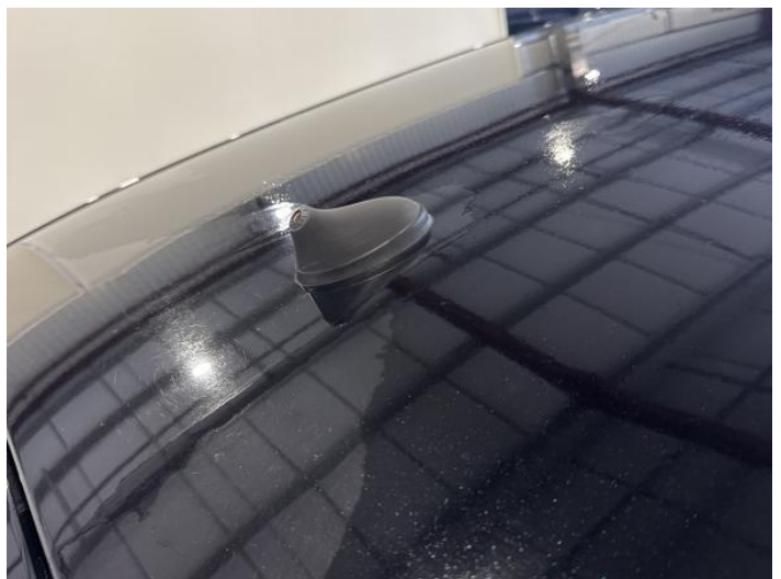
14: Aerial Missing Replace