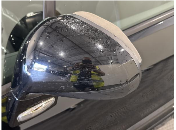
4: Door Mirror Assy nsf Scratched (Painted) Over 25mm Thru Paint