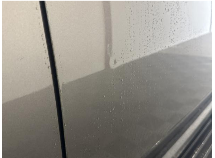
10: Door osf Dented With Paint Damage