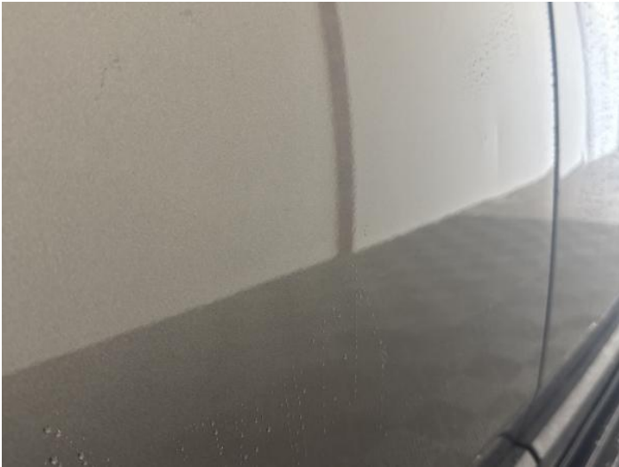
9: Door osr Dented Over 30mm