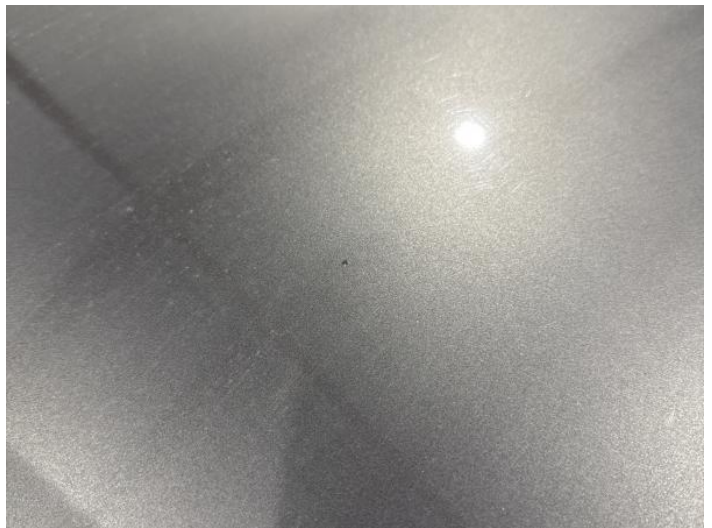
2: Bonnet Chipped 1 To 5