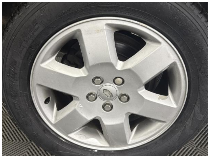
8: Wheel osr Scratched Over 50mm