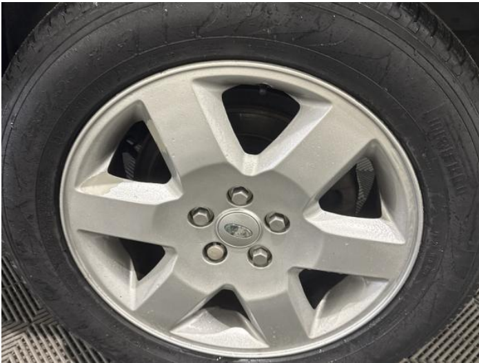
5: Wheel nsr Scratched Over 50mm