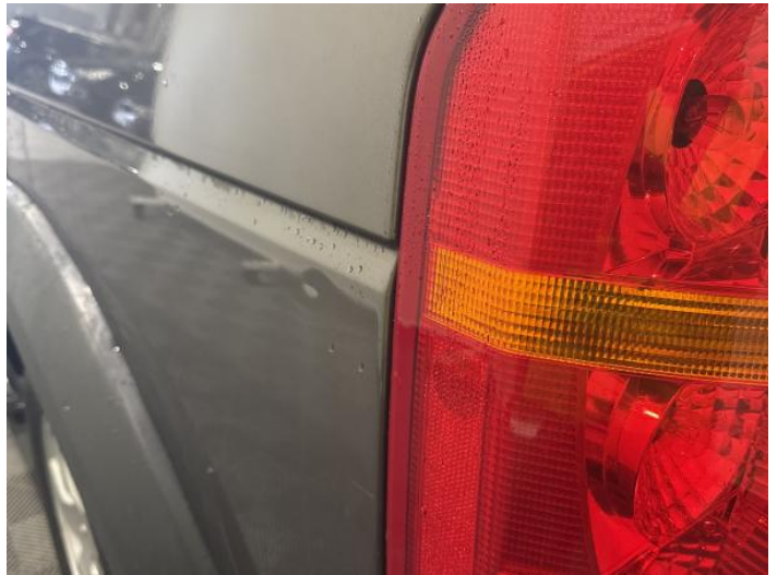
6: Qtr Panel nsr Dented Between 10mm + 30mm