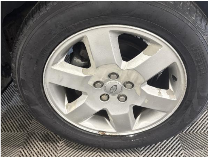
11: Wheel osf Scratched Over 50mm