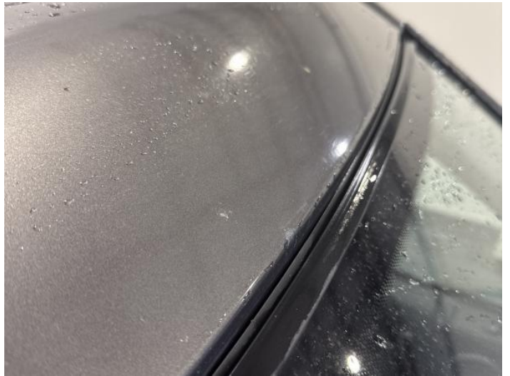
12: Roof Chipped Over 5mm