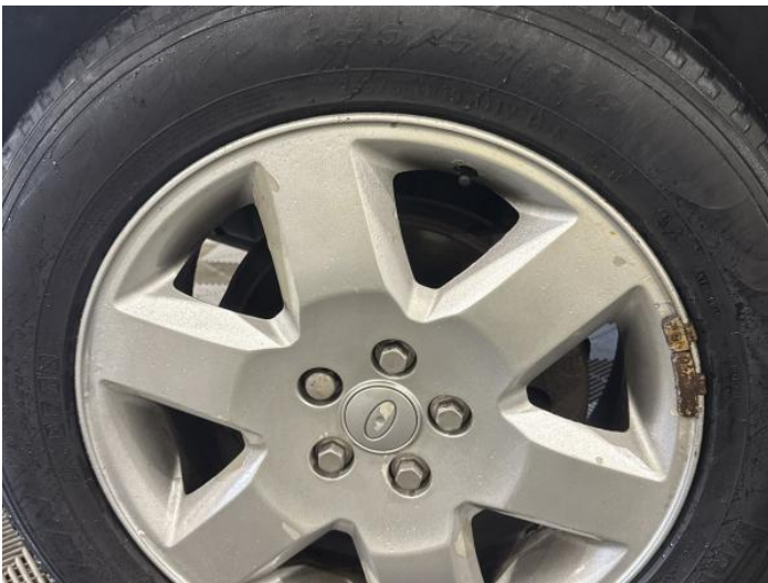
1: Wheel nsf Scratched Over 50mm