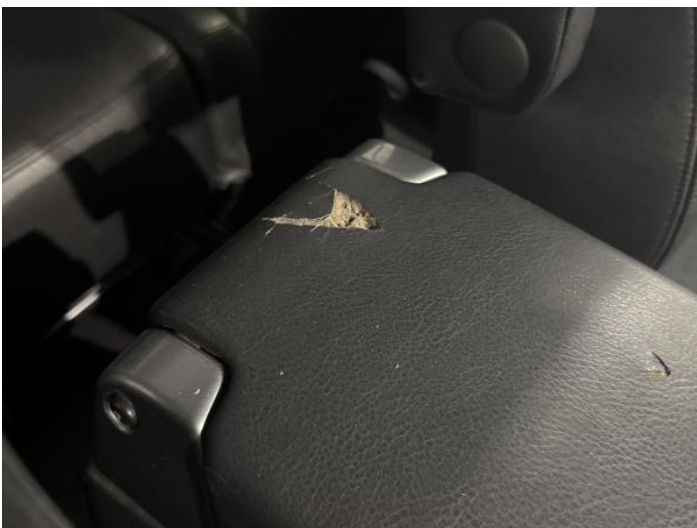
13: Fascia Panel Holed Over 3mm