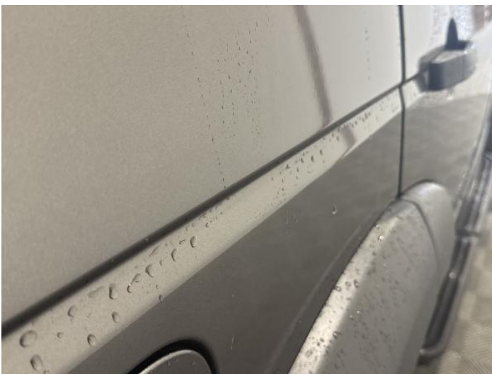
7: Qtr Panel osr Dented Between 10mm + 30mm