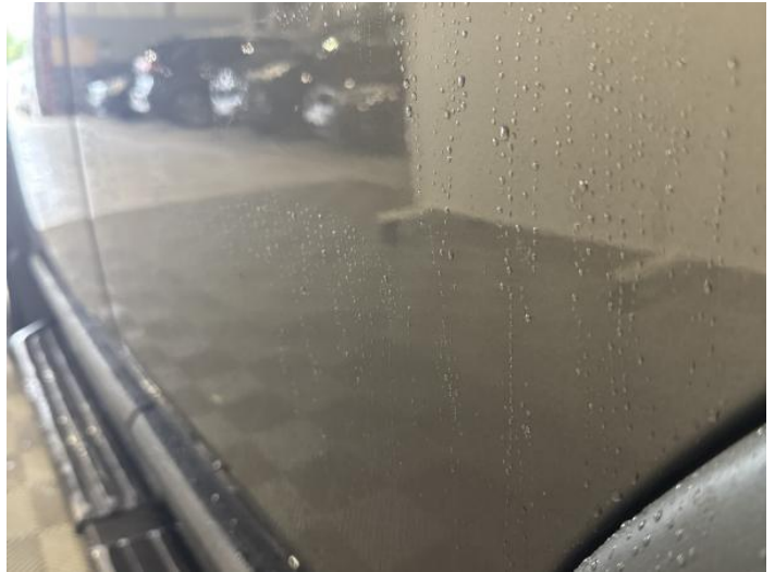
4: Door nsr Dented Between 10mm + 30mm