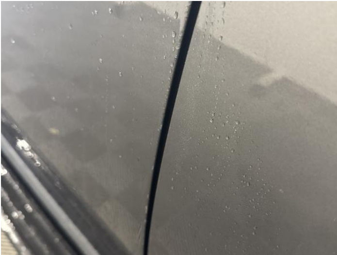
3: Door nsf Chipped Edge Chip