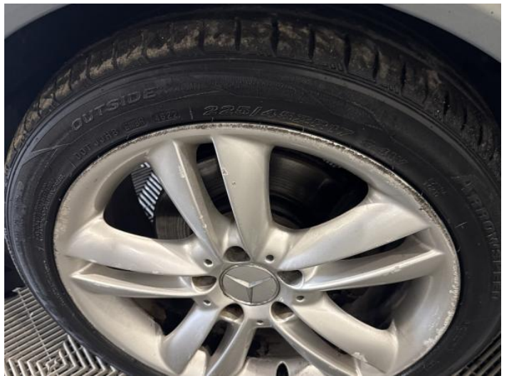
6: Wheel nsf Scratched Over 50mm