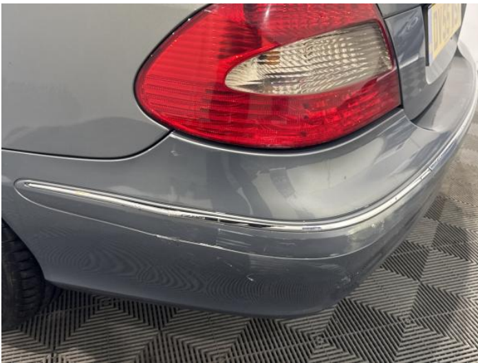
11: Bumper Rear Scratched Over 100mm Thru Paint