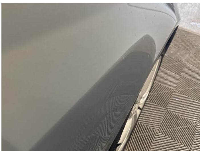
17: Wing osf Dented With Paint Damage