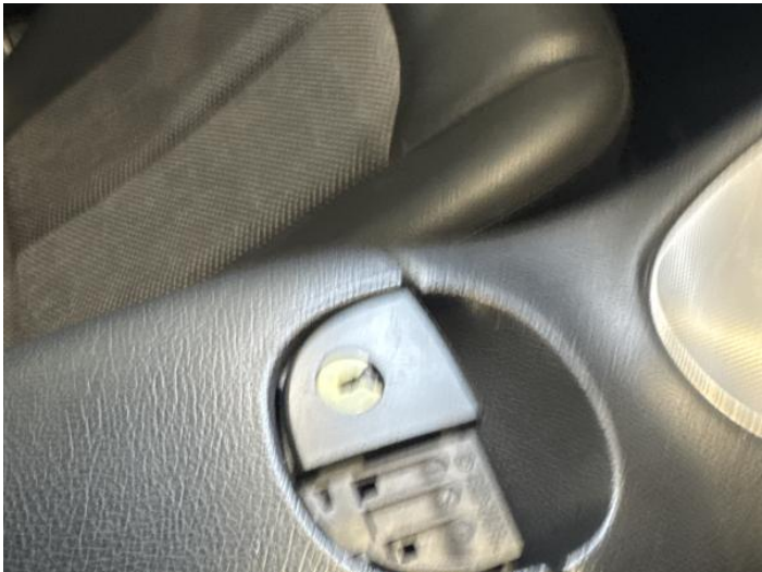
2: Other N/A N/A