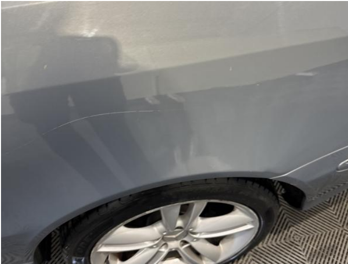
9: Qtr Panel nsr Dented With Paint Damage