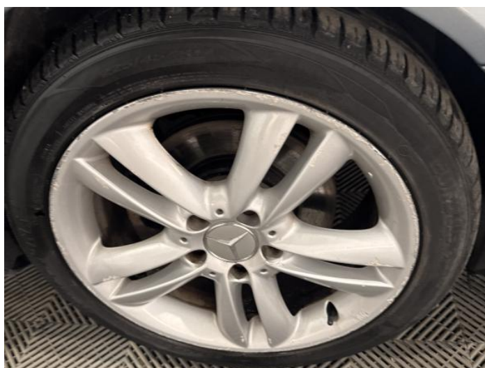
18: Wheel osf Scratched Over 50mm