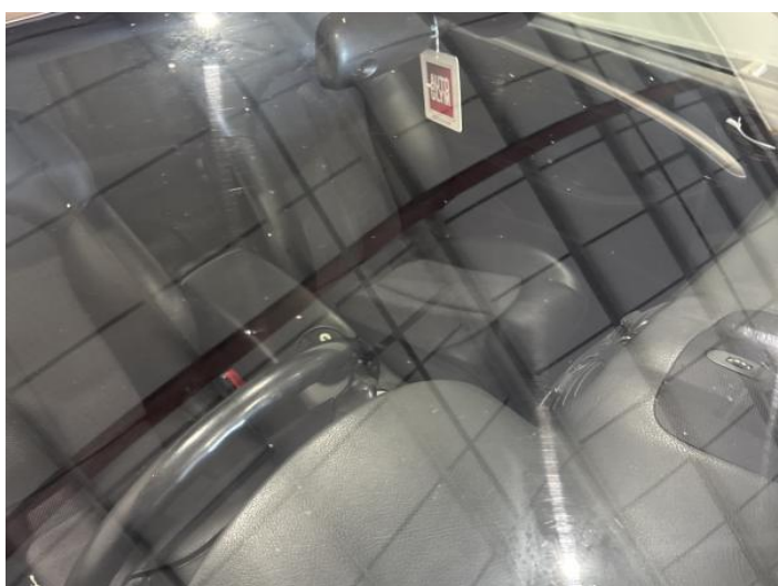
19: Screen Front Chipped UpTo 10mm