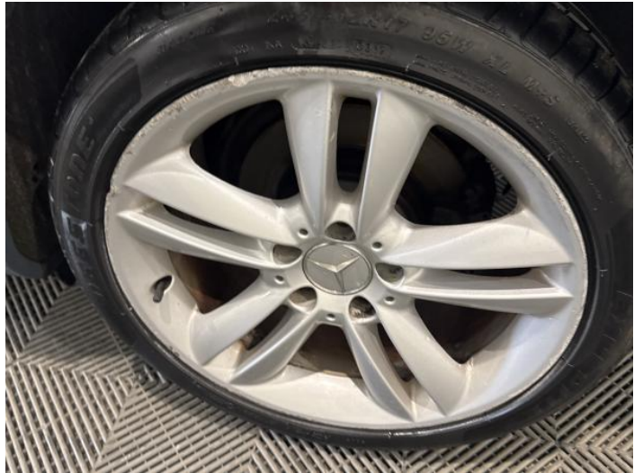
10: Wheel nsr Scratched Over 50mm