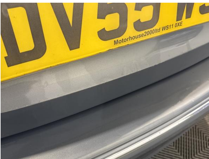
13: Boot Lid Scratched Over 25mm Thru Paint