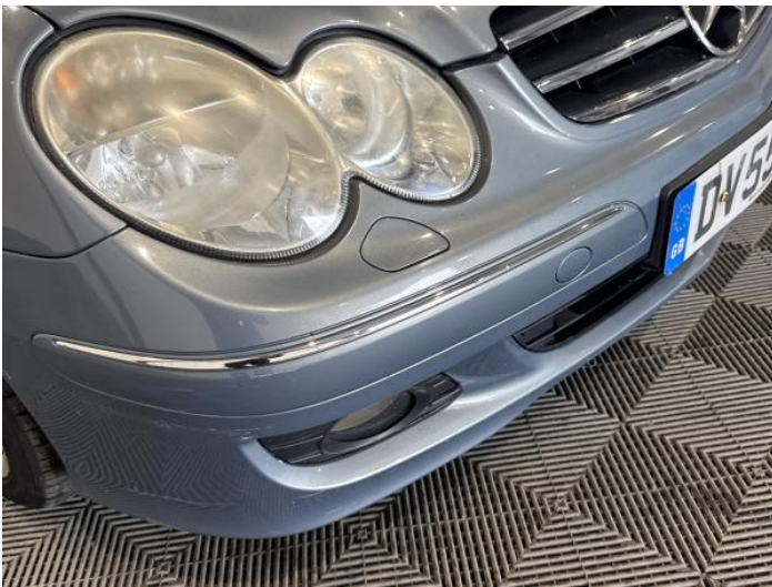
5: Bumper Front Scratched Over 100mm Thru Paint