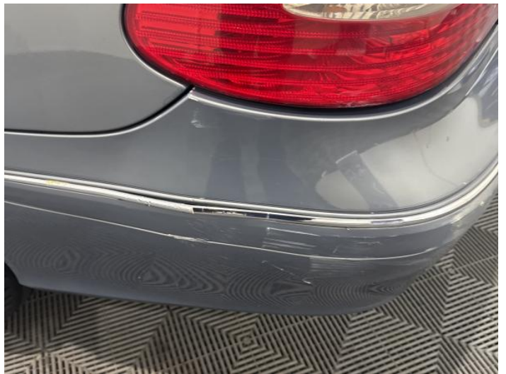
12: Bumper Rear Moulding Broken Replace