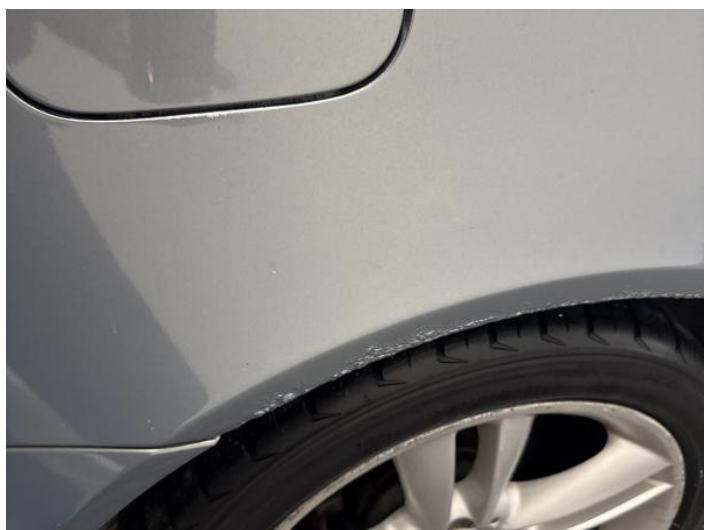
14: Qtr Panel osr Rusted Over 5mm