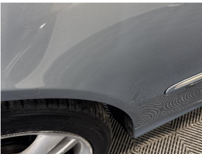
7: Wing nsf Scratched Over 25mm Thru Paint