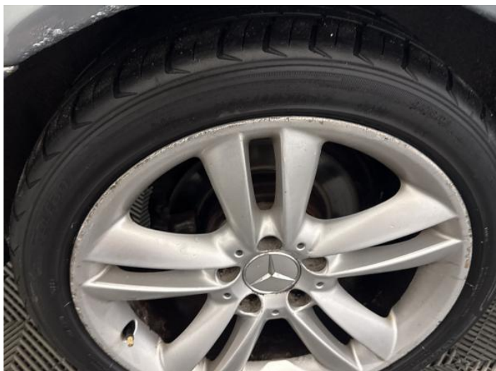
15: Wheel osr Scratched Over 50mm