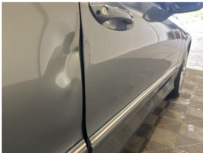
16: Door osf Dented Over 30mm