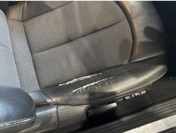
1: Seat Base Cover osf Torn Over 3mm