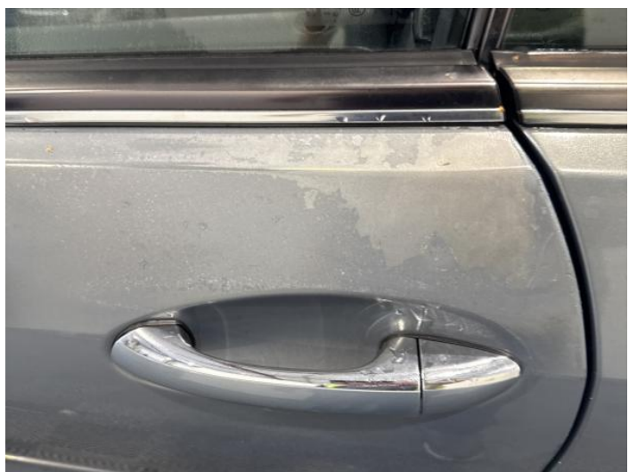
8: Door nsf Poor Previous Repair Paint Flake