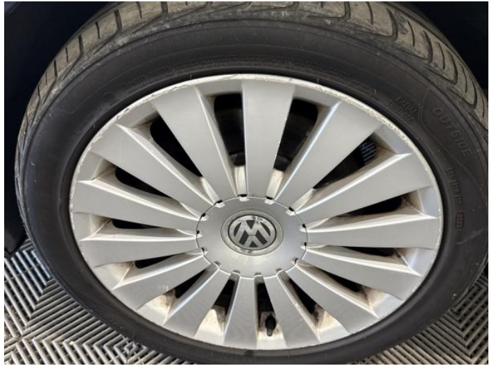
4: Wheel nsf Scratched Over 50mm