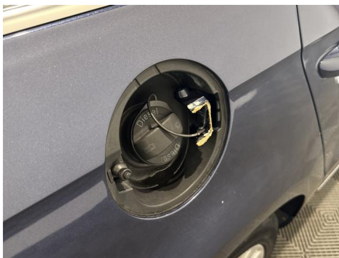
12: Fuel Flap Missing Replace