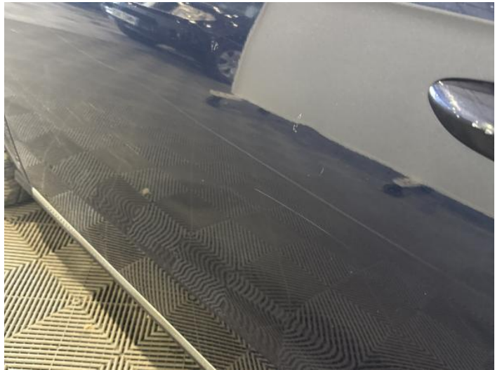
6: Door nsf Dented With Paint Damage