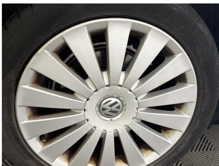
14: Wheel osr Scratched Over 50mm