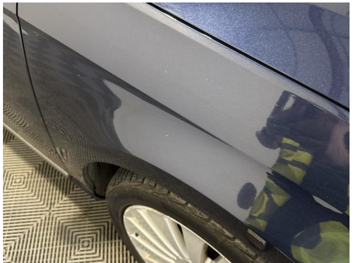
18: Wing osf Chipped 1 To 5