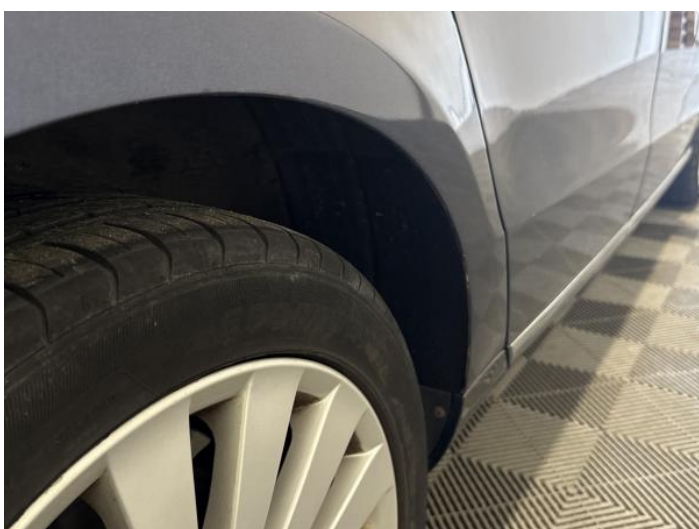
13: Qtr Panel osr Scratched Over 25mm Thru Paint