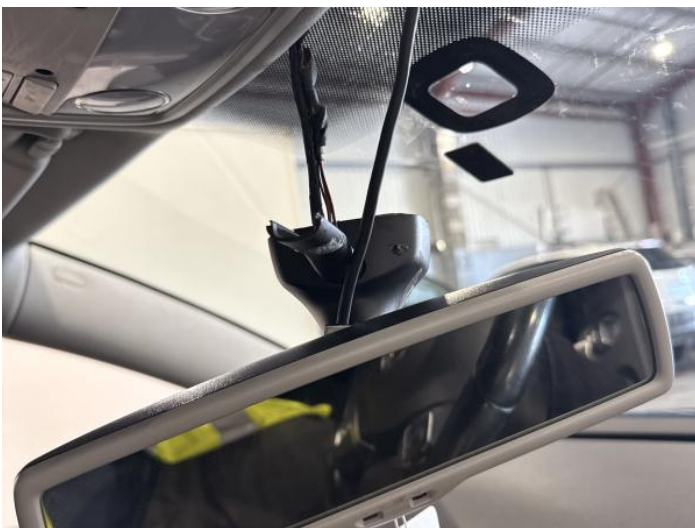
19: Fascia Panel Broken Replace