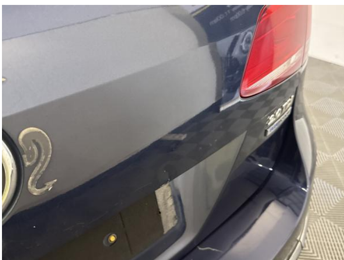
11: Tailgate Dented Over 30mm