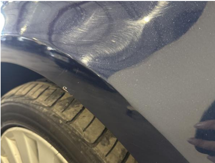
5: Wing nsf Dented With Paint Damage