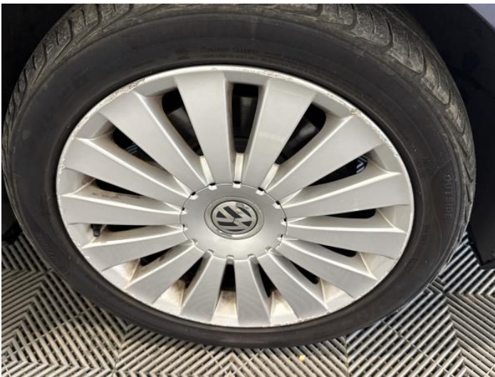
17: Wheel osf Scratched Over 50mm