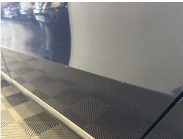
7: Door nsr Scratched Over 25mm Thru Paint