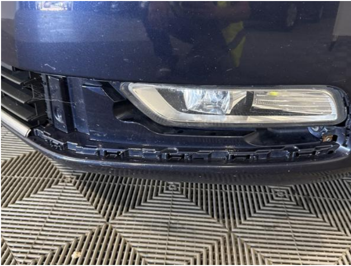
3: Bumper Front Moulding Missing Replace