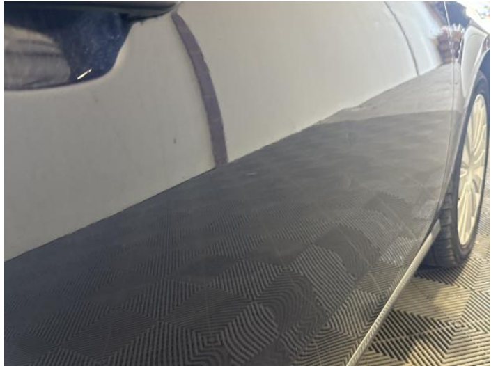
16: Door osf Dented Over 30mm