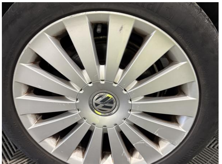
8: Wheel nsr Scratched Over 50mm