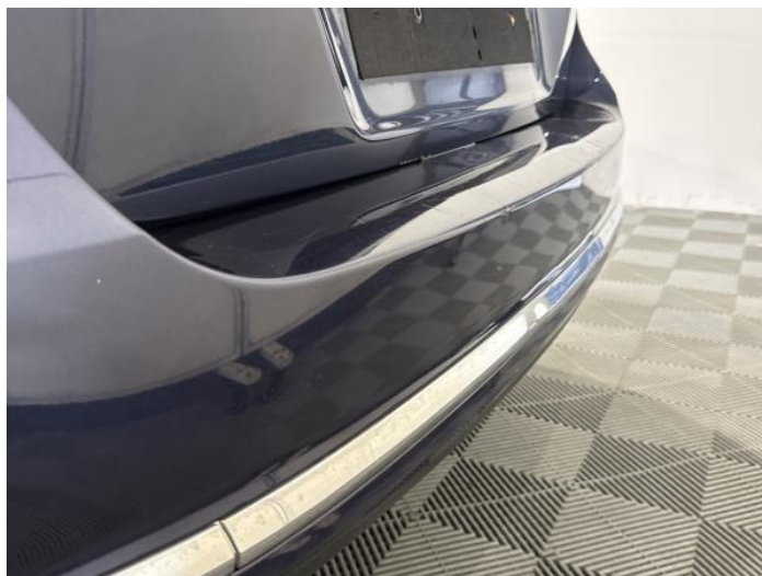
10: Bumper Rear Dented With Paint Damage