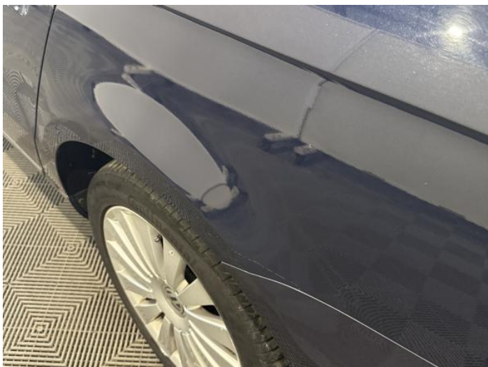
9: Qtr Panel nsr Scratched Over 25mm Thru Paint