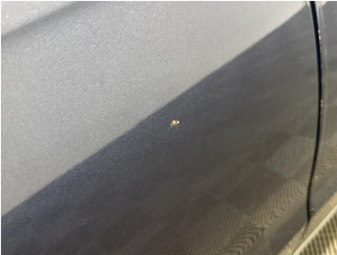
15: Door osr Chipped Over 5mm