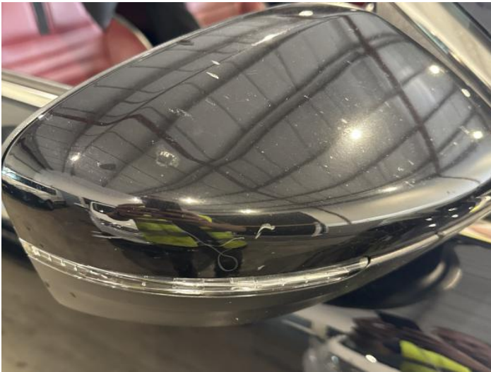
11: Door Mirror Assy osf Scratched (Painted) UpTo 25mm Thru Paint