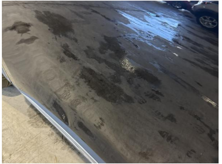
4: Door nsf Scratched Over 25mm Thru Paint