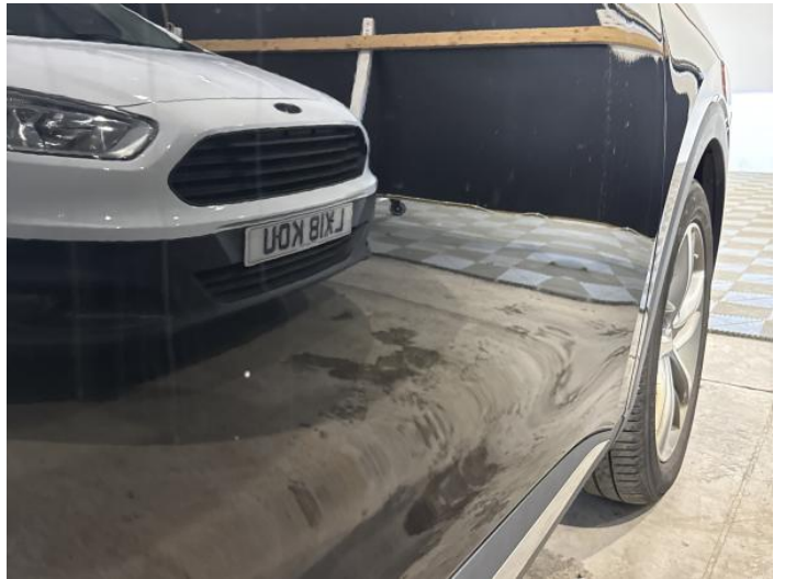
12: Door osf Dented Over 30mm