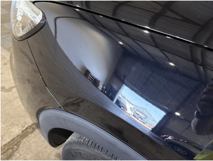
3: Wing nsf Chipped Multiple Chips