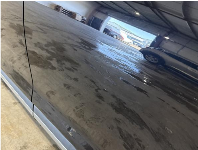
5: Door nsr Scratched Over 25mm Thru Paint