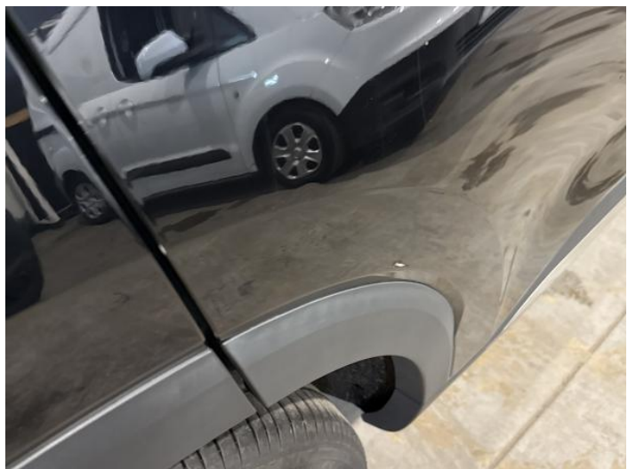
8: Door osr Dented Between 10mm + 30mm