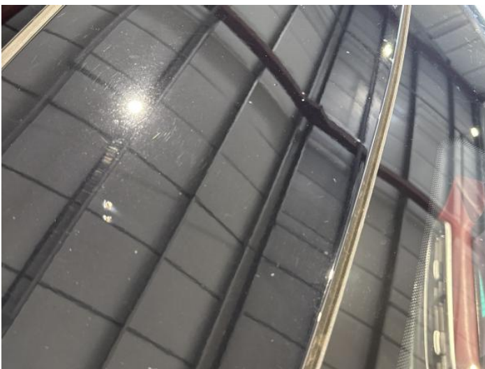
13: Roof Chipped Multiple Chips