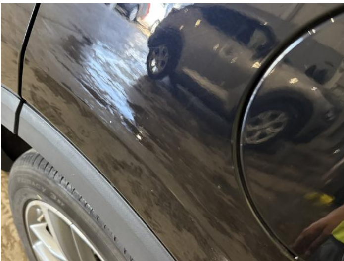
7: Qtr Panel nsr Chipped 1 To 5