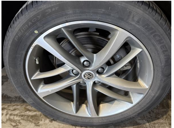
6: Wheel nsr Scratched Over 50mm