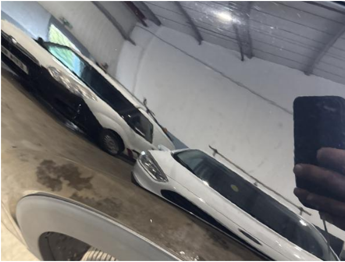
9: Wing osf Chipped 1 To 5