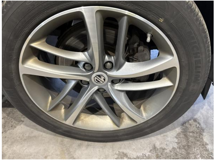
10: Wheel osf Scratched Up To 50mm