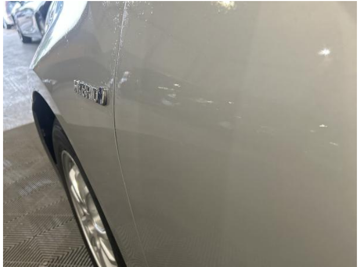
10: Door nsf Dented 2 Or Less UpTo 10mm