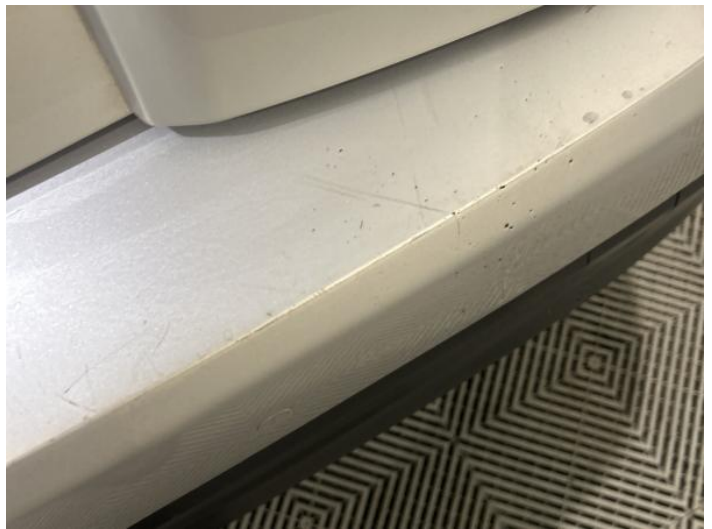
6: Bumper Rear Scratched 25 to 100mm Thru Paint