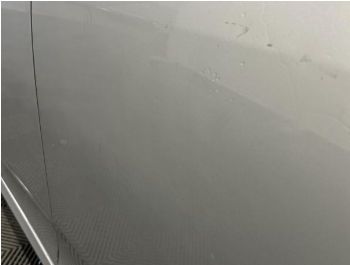
9: Door nsr Poor Previous Repair Poor Paint