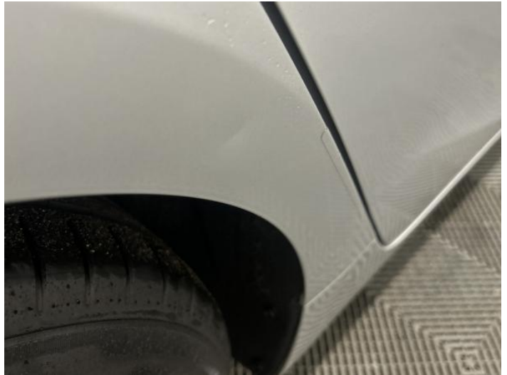
4: Qtr Panel osr Dented 2 Or Less UpTo 10mm