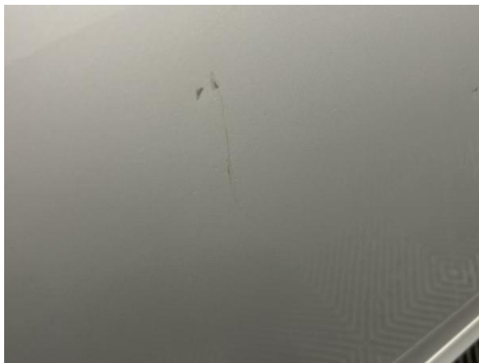
2: Door osf Scratched Over 25mm Thru Paint