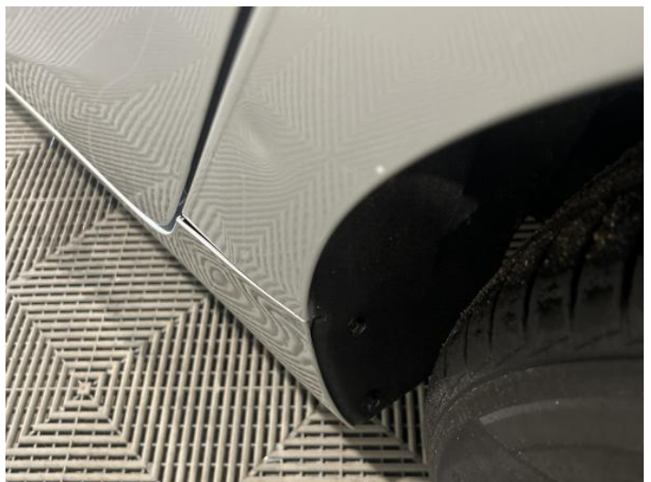
8: Qtr Panel nsr Dented Between 10mm + 30mm