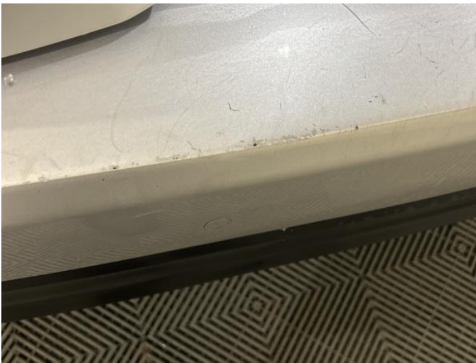
5: Bumper Rear Chipped Multiple Chips