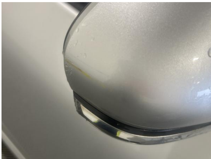
1: Door Mirror Assy osf Scratched (Painted) UpTo 25mm Not Thru Paint