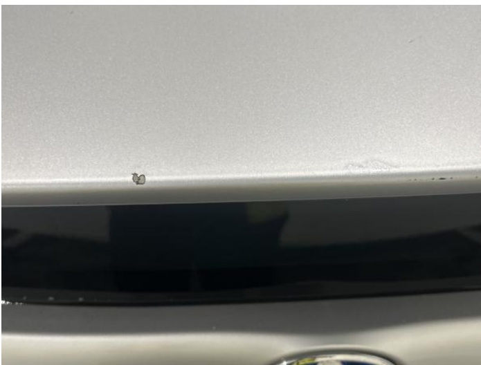
7: Boot Lid Chipped 1 To 5