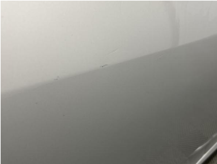
3: Door osr Chipped 1 To 5