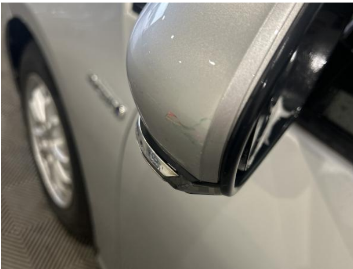
11: Door Mirror Assy nsf Scratched (Painted) UpTo 25mm Thru Paint