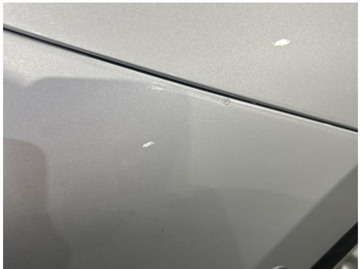
12: Bumper Front Poor Previous Repair Poor Paint